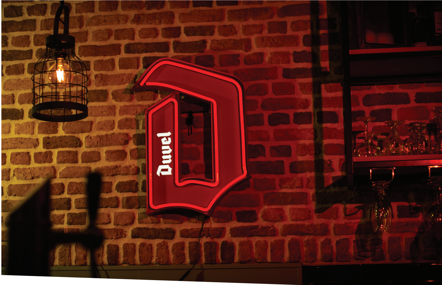
LEDNeon - Duvel