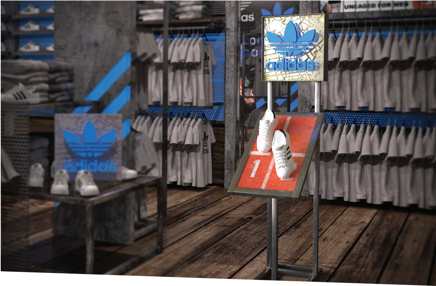
Shop display - Adidas (3D render)