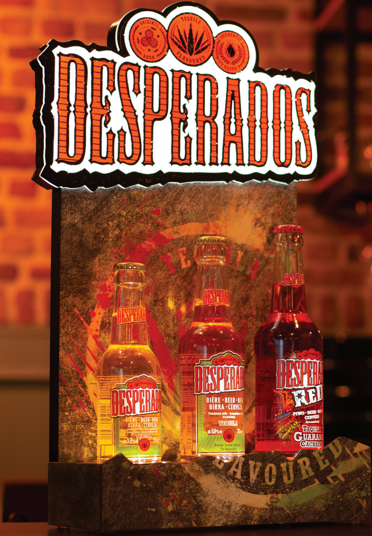
Bottle glorifier - Desperados