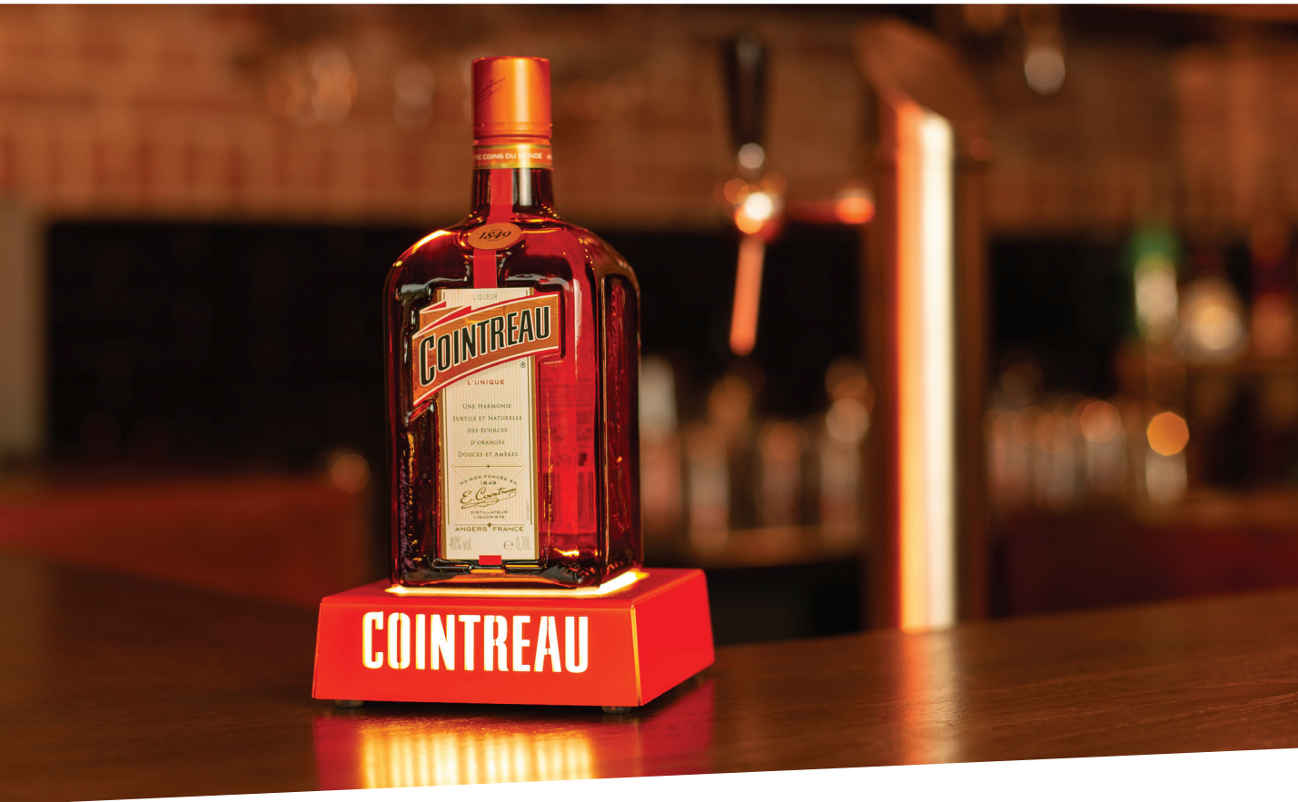
Bottle glorifier - Cointreau