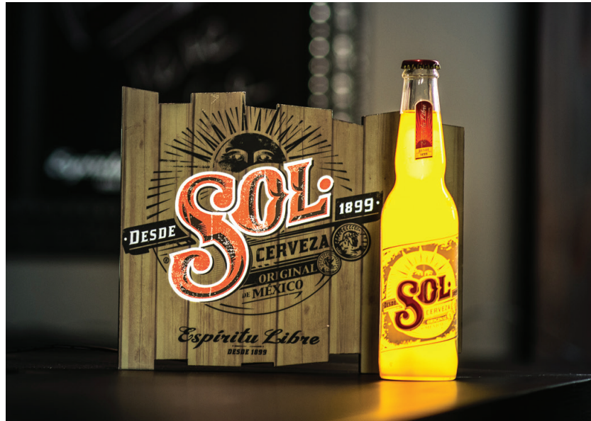
Bottle glorifier - Sol