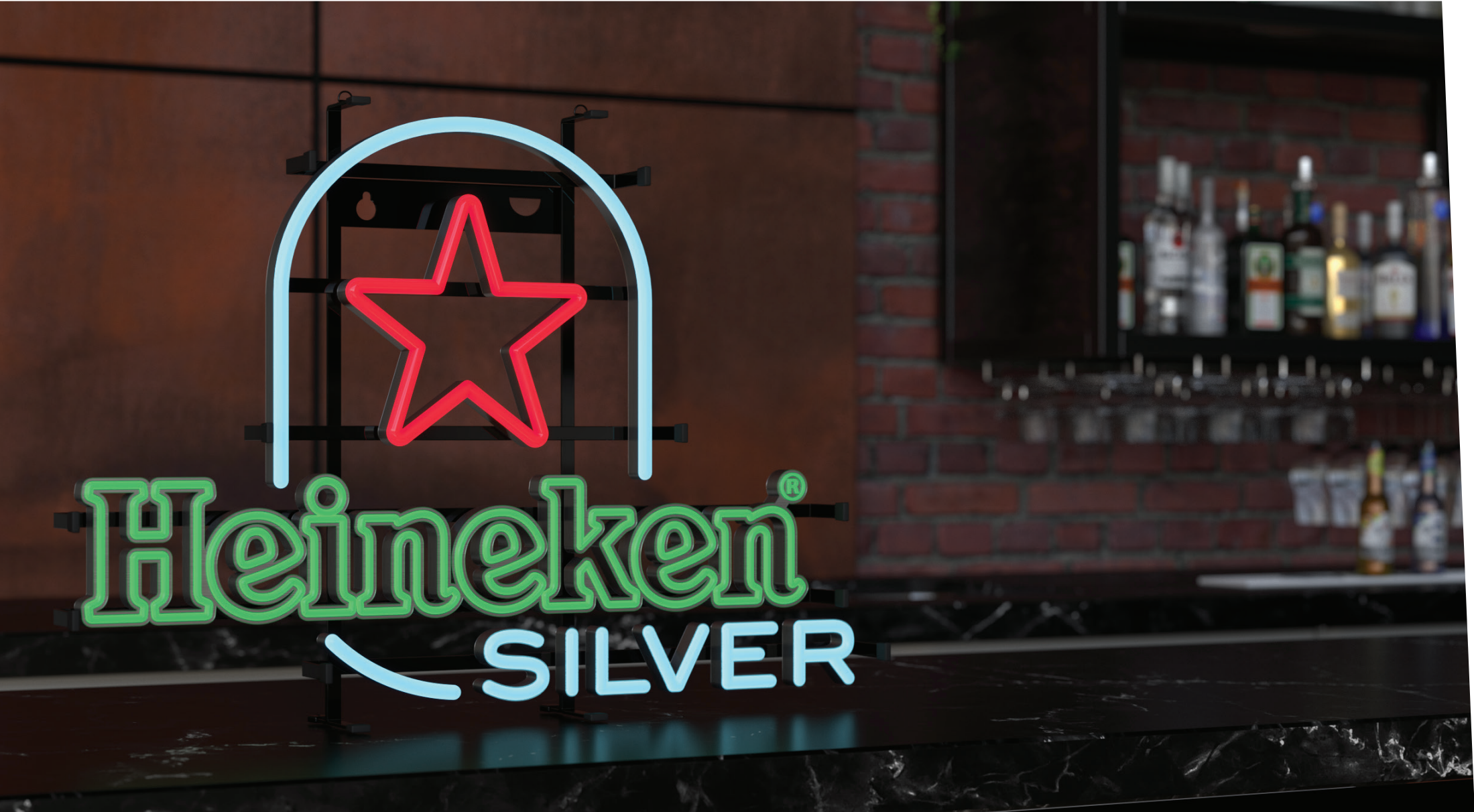
LEDNeon - Heineken Silver