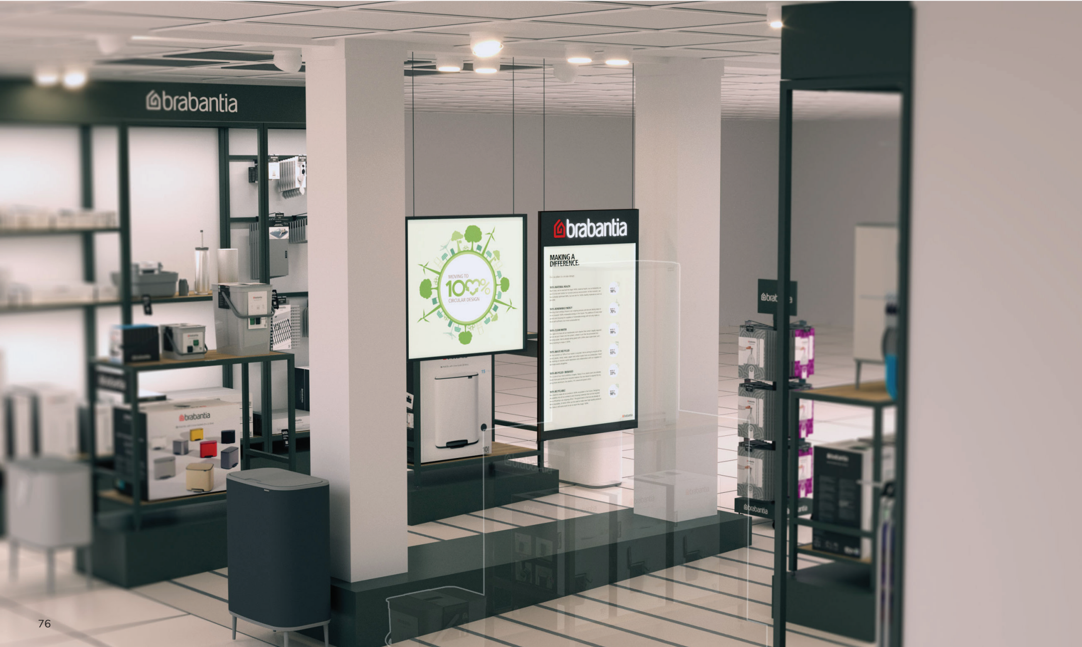
Shop in shop - Brabantia