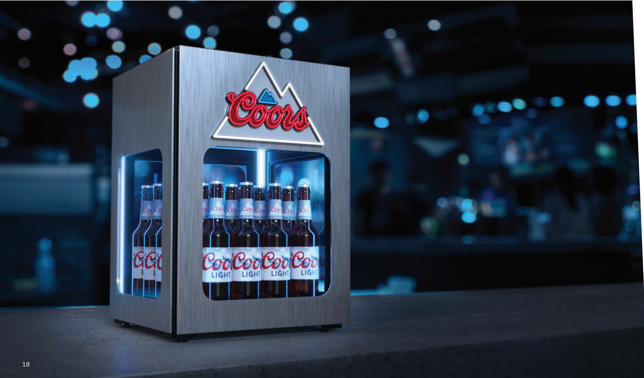
B.360 fridge - Coors (3D render)