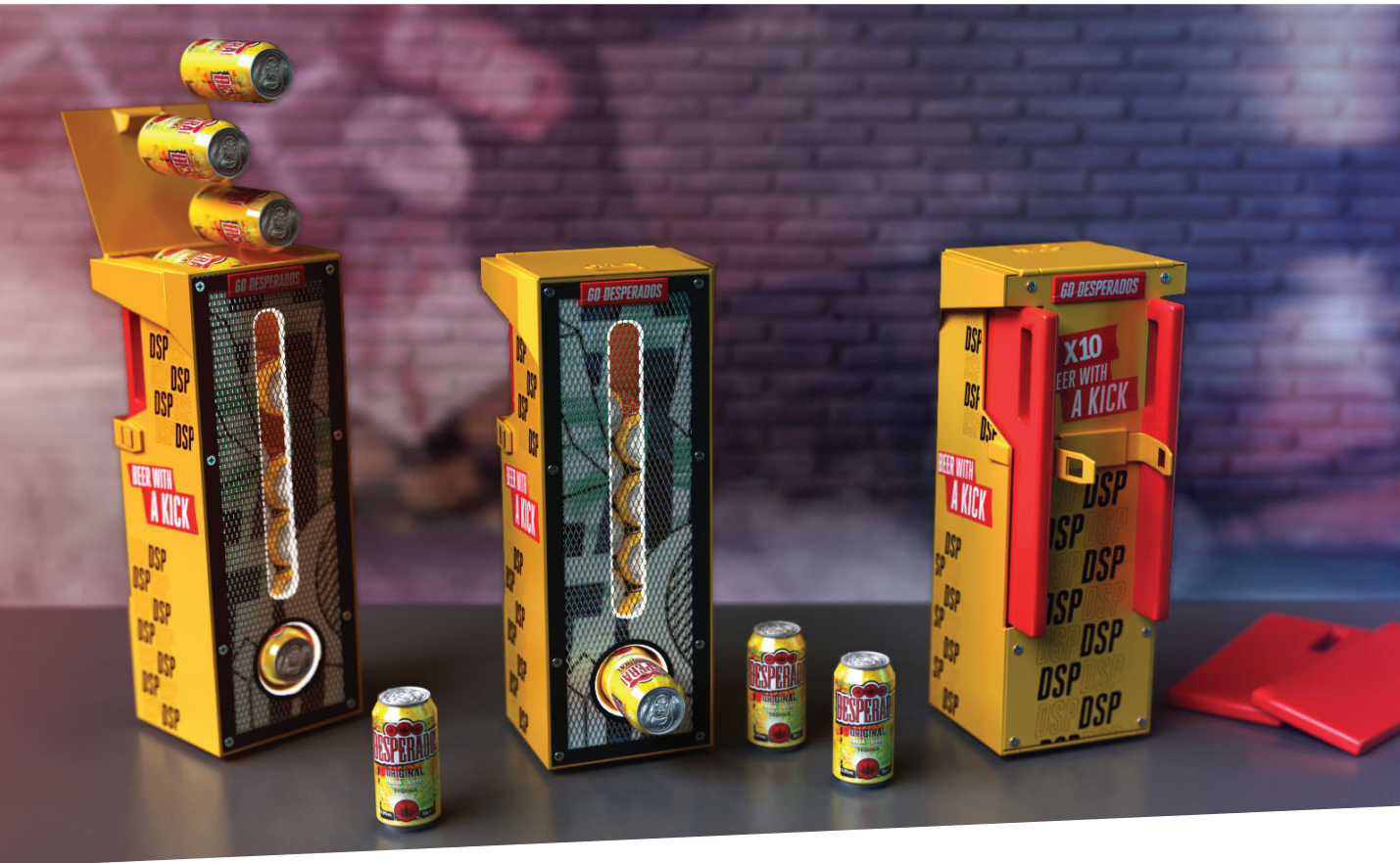
Can Tower - Desperados (3D render)