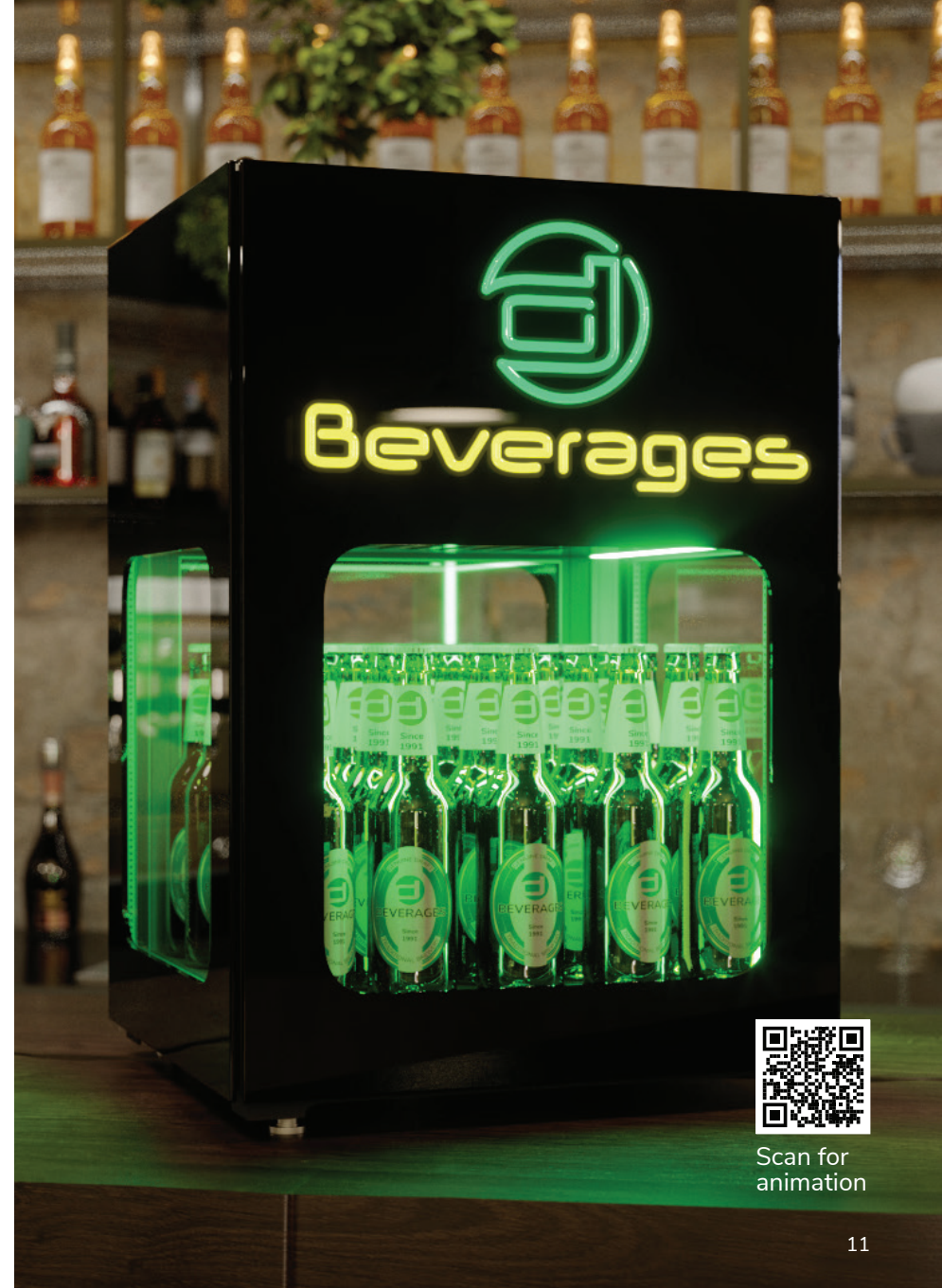
B.360 fridge - Dekkers Beverages