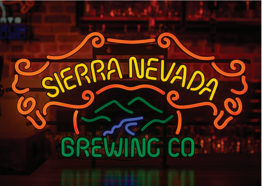
LEDNeon - Sierra Nevada