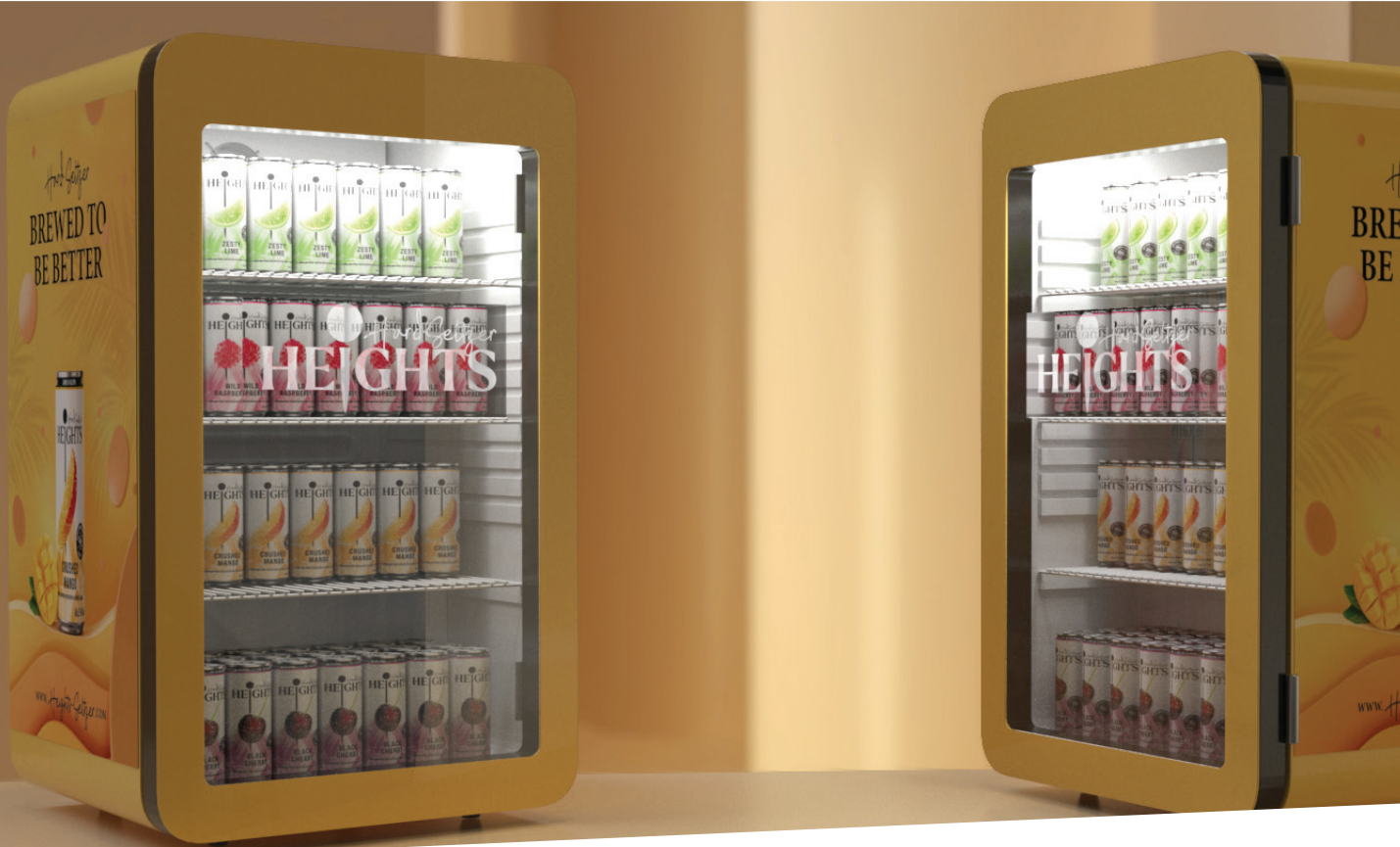
B.360 fridge - Hard Seltzer (3D render)