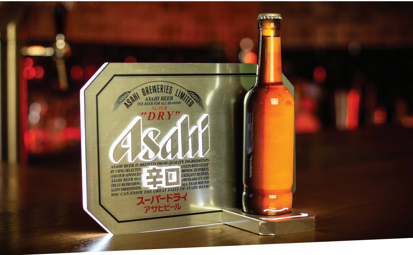
Bottle glorifier - Asahi