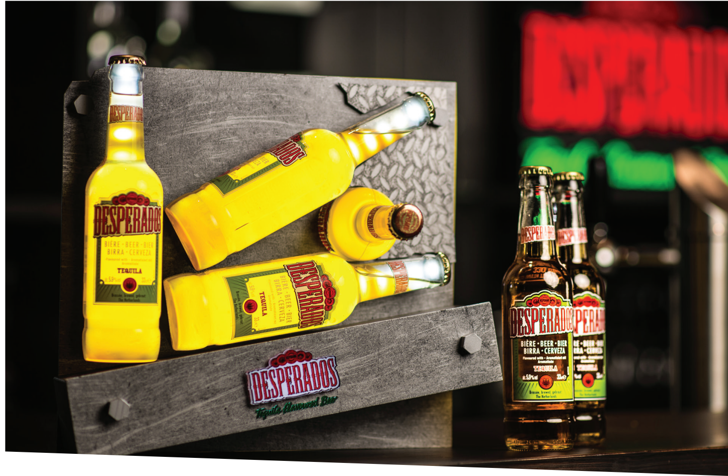
Bottle glorifier - Desperados