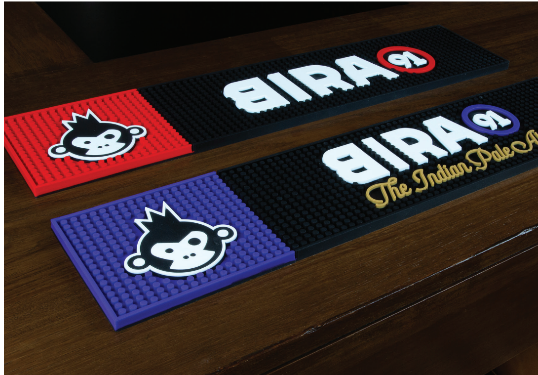
Barrunner - Bira91