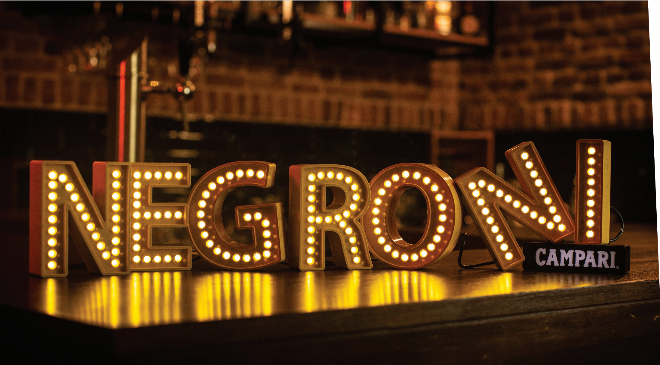
LEDSign - Negroni