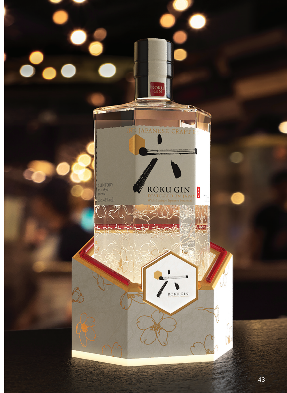
Bottle glorifier - Roku