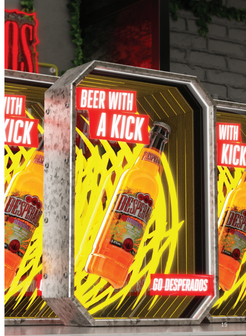
Bottle glorifier - Desperados