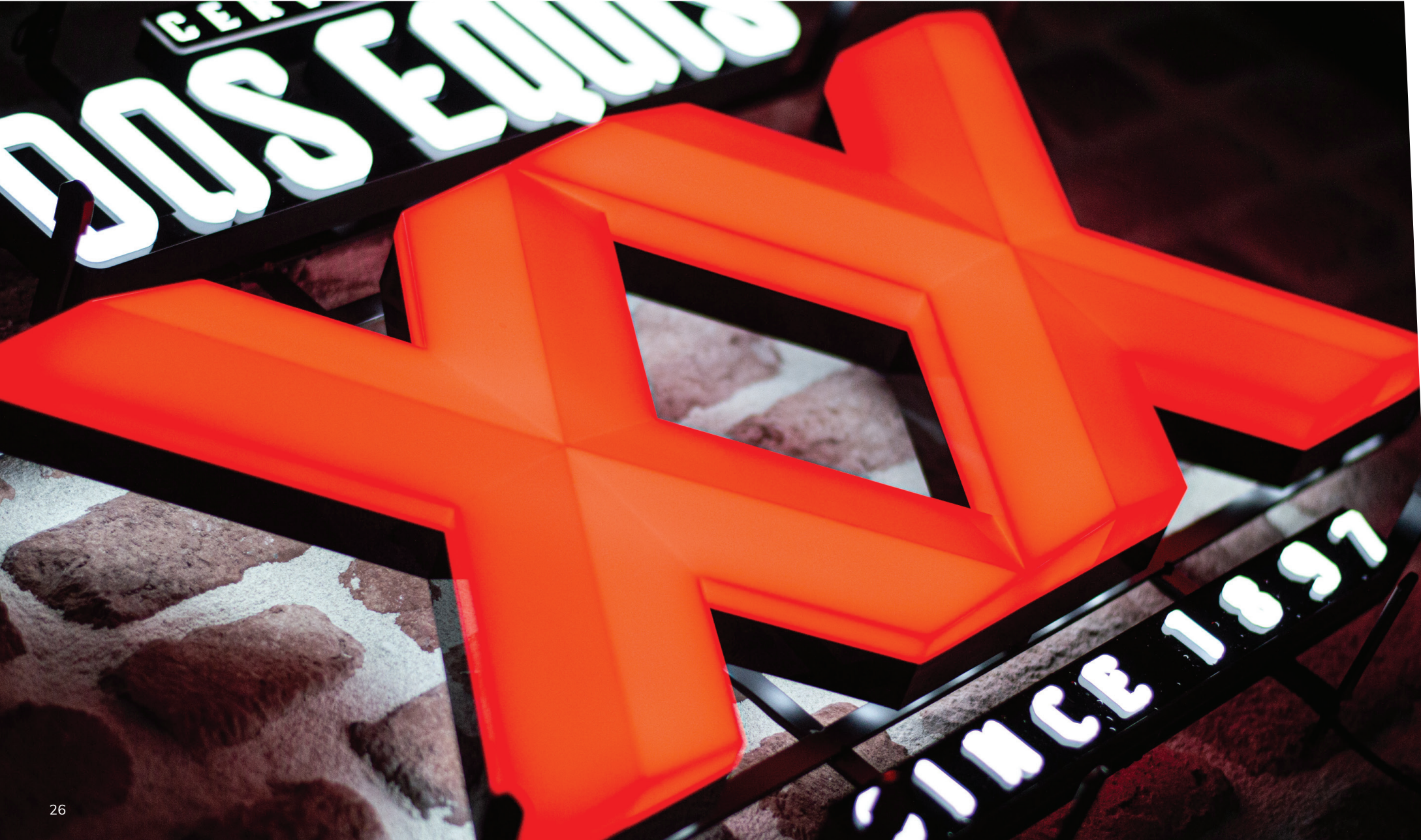
LEDSign - Dos Equis