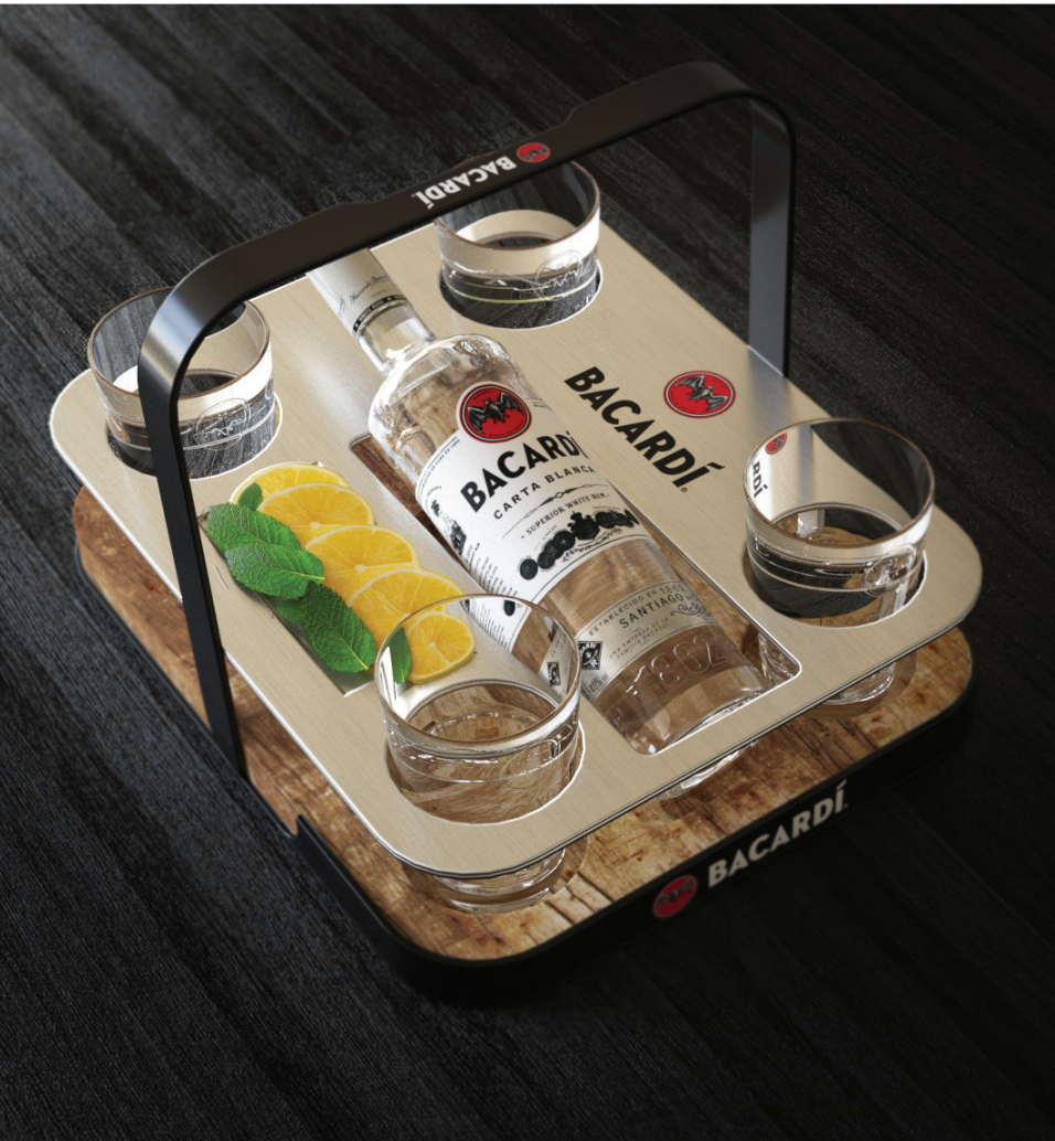
Serving tray - Bacardi