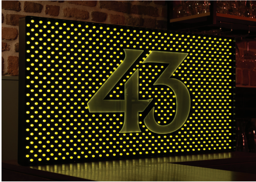
LEDSign - Licor 43