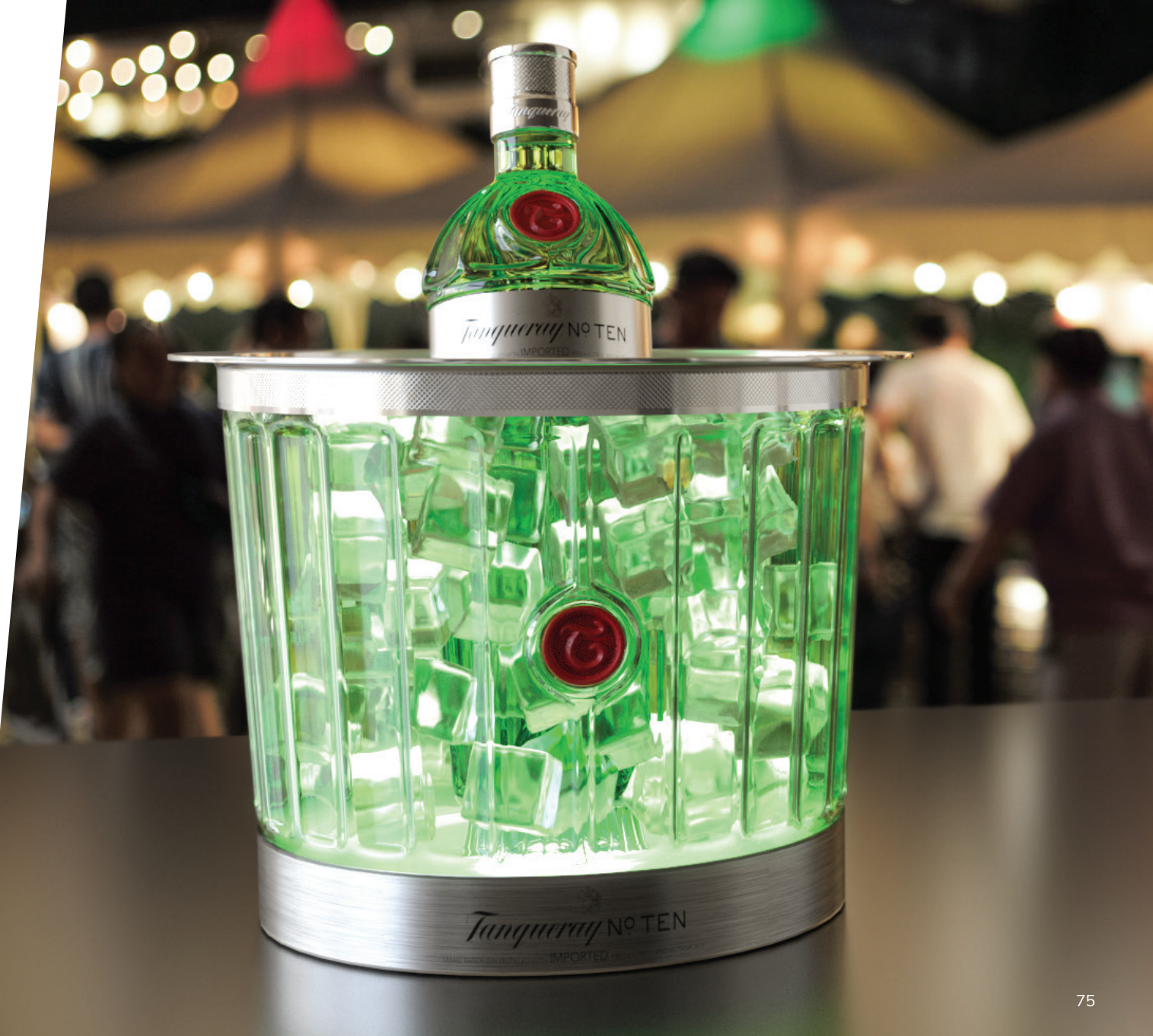
Ice bucket - Tanqueray