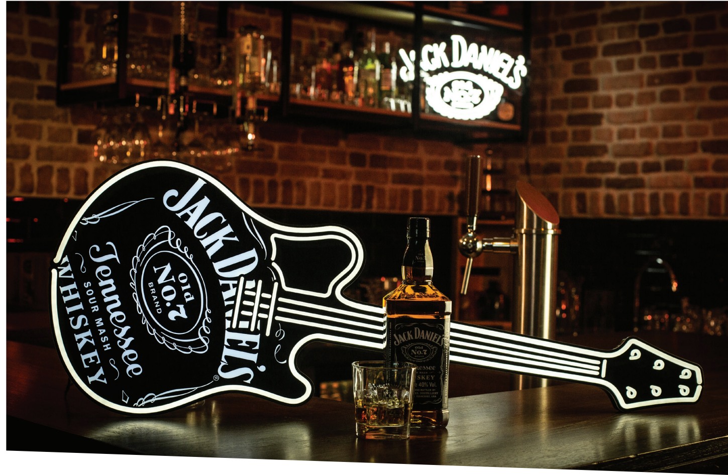
LEDNeon - Jack Daniels