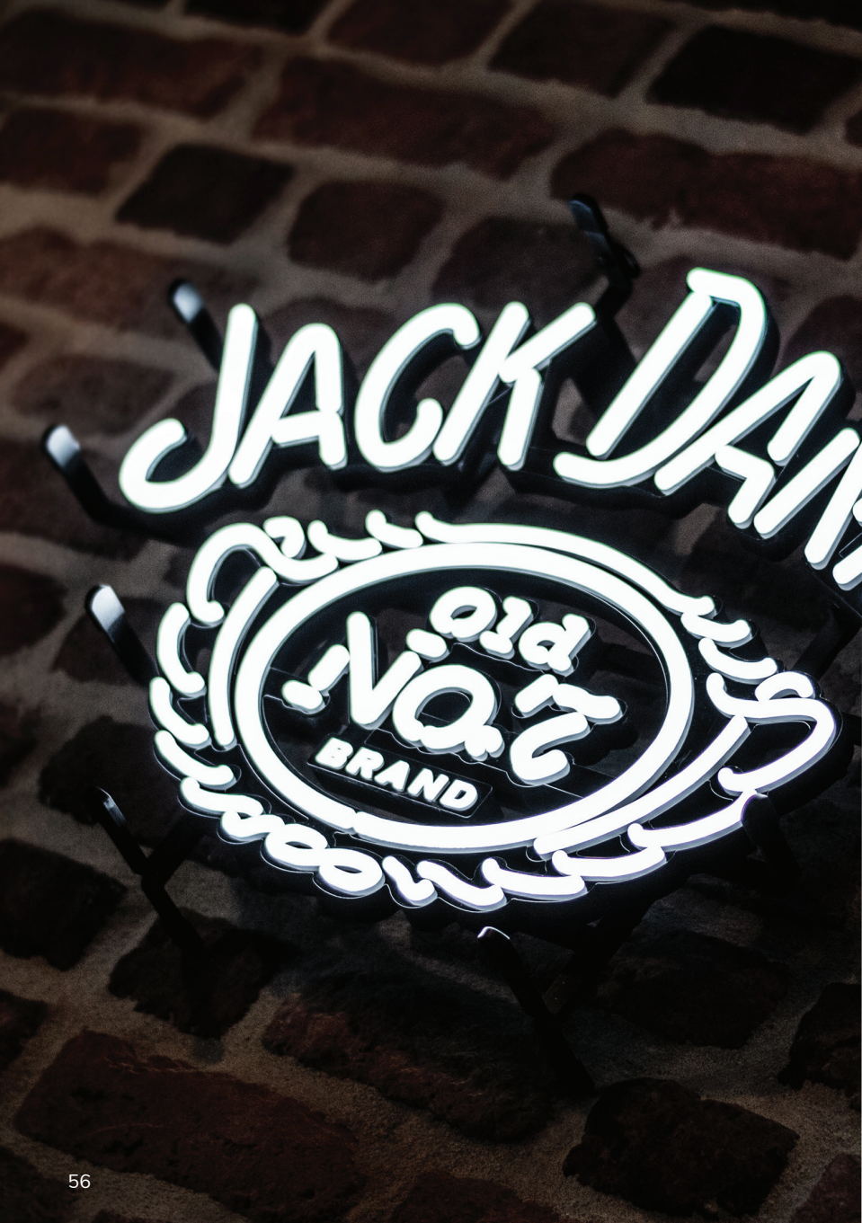
LEDNeon - Jack Daniels