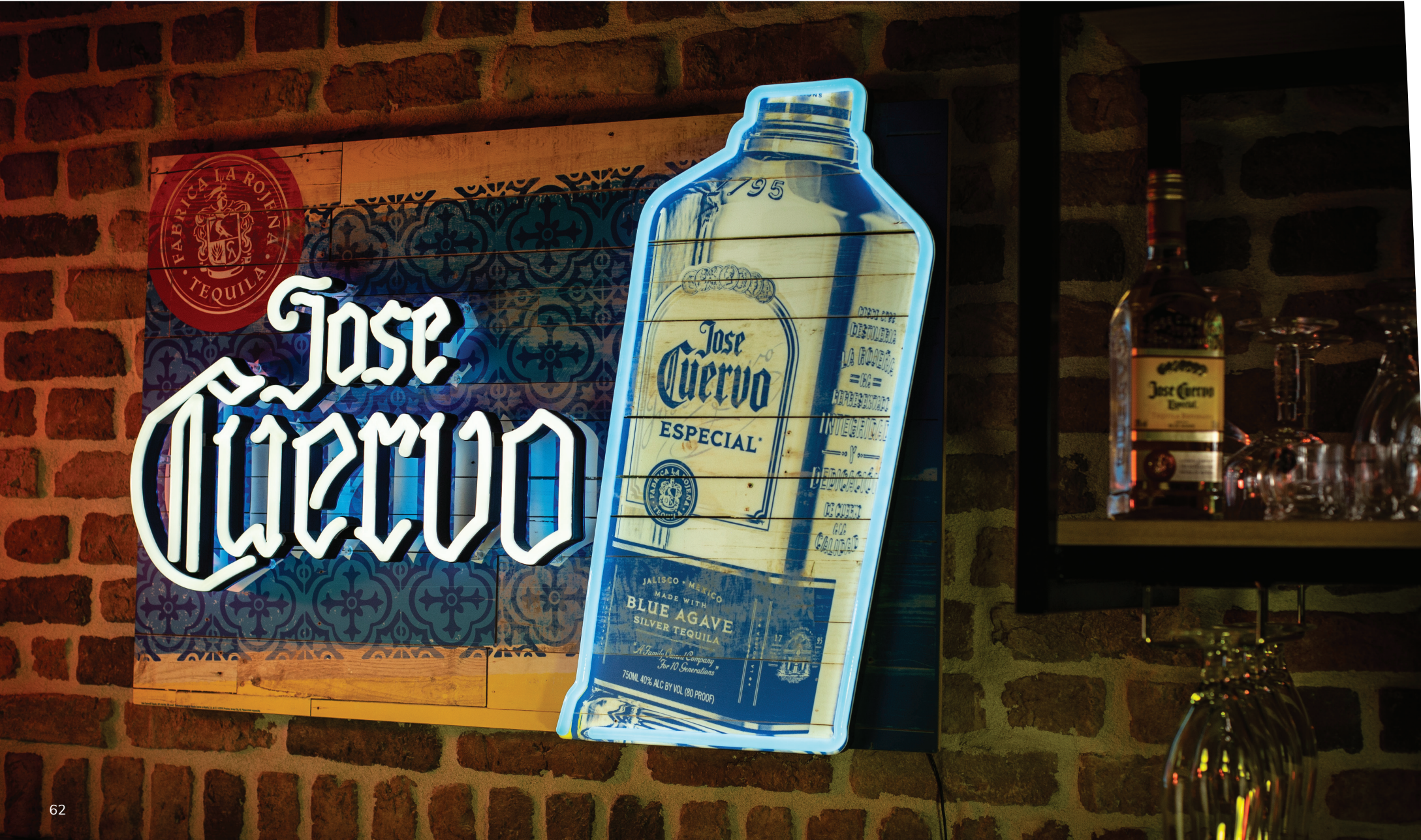
LEDSign - Jose Cuervo