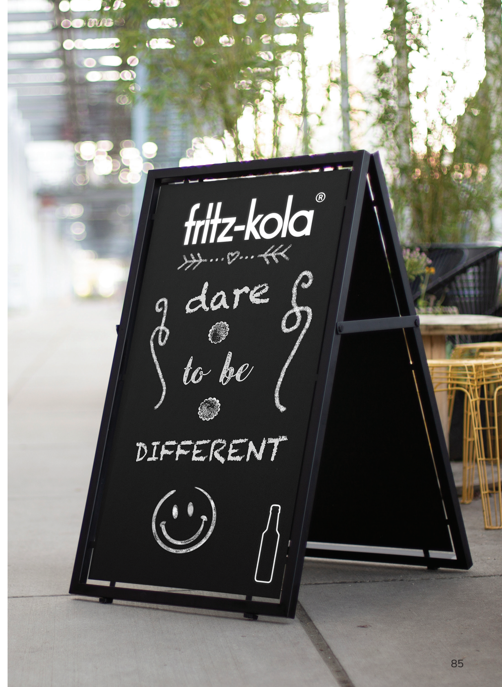
Pavement stand - Fritz-Kola