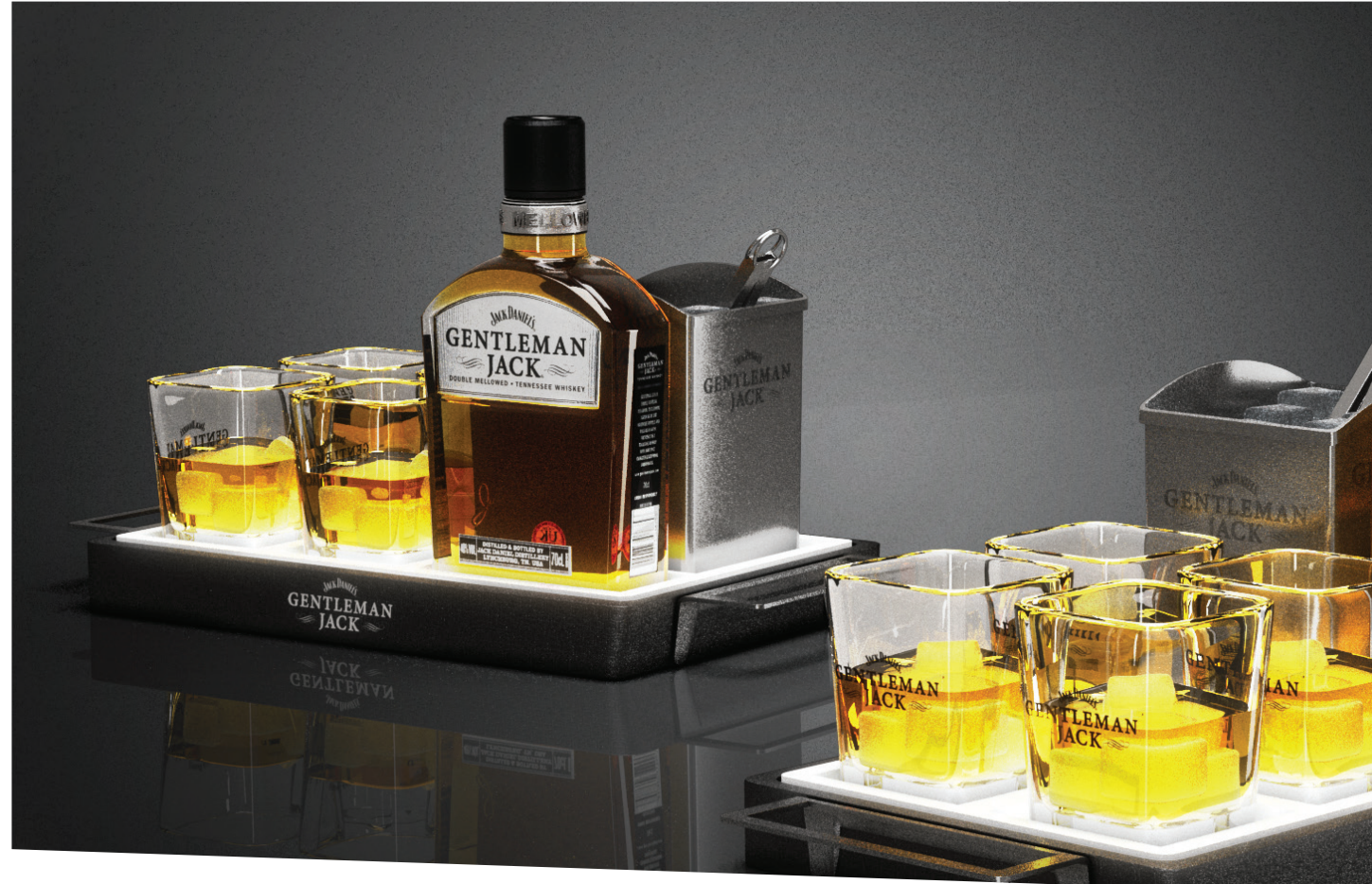
Serving tray - Gentleman Jack (3D render)