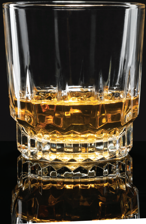
LEDSign - Jack Daniels