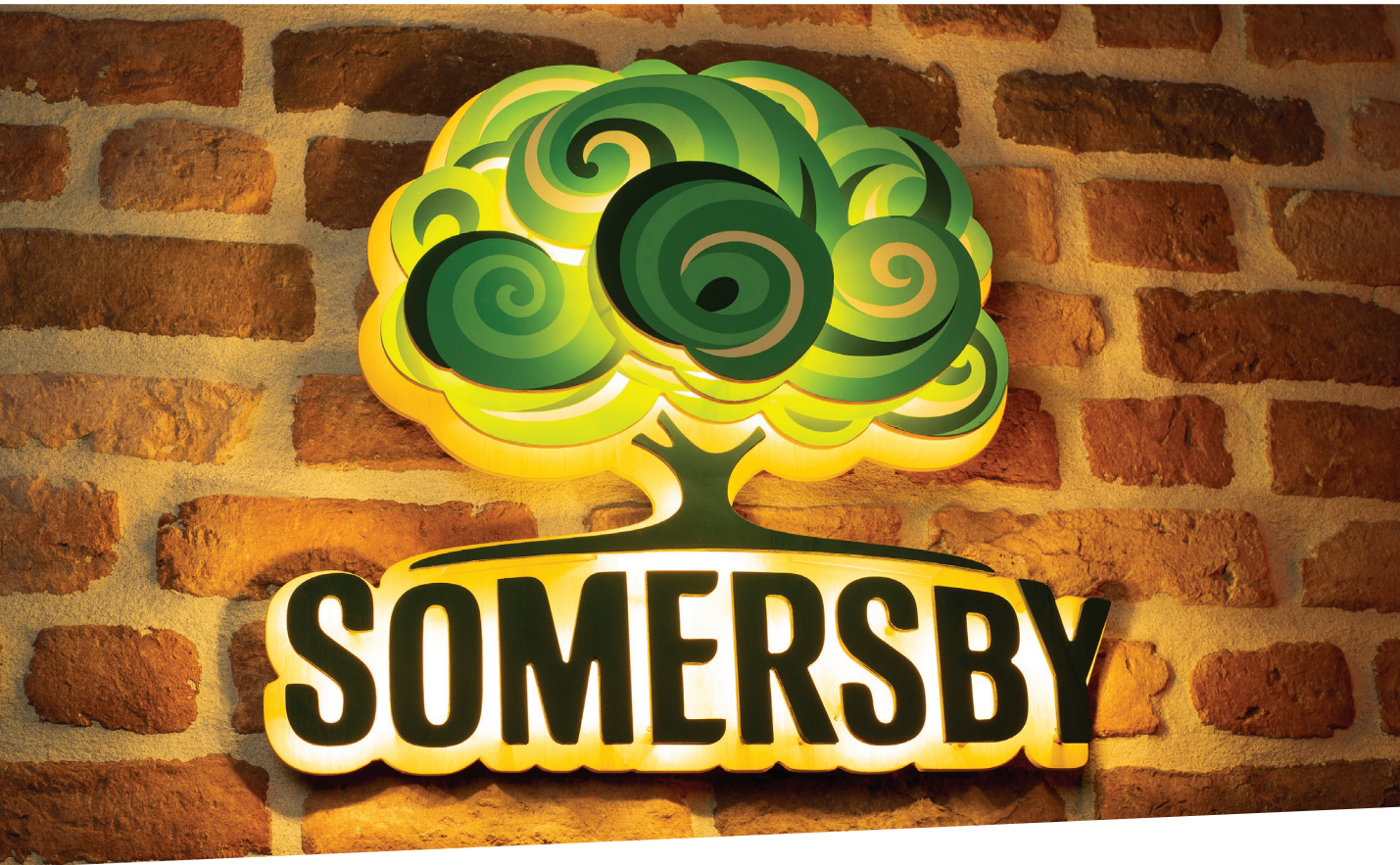
LEDSign - Somersby