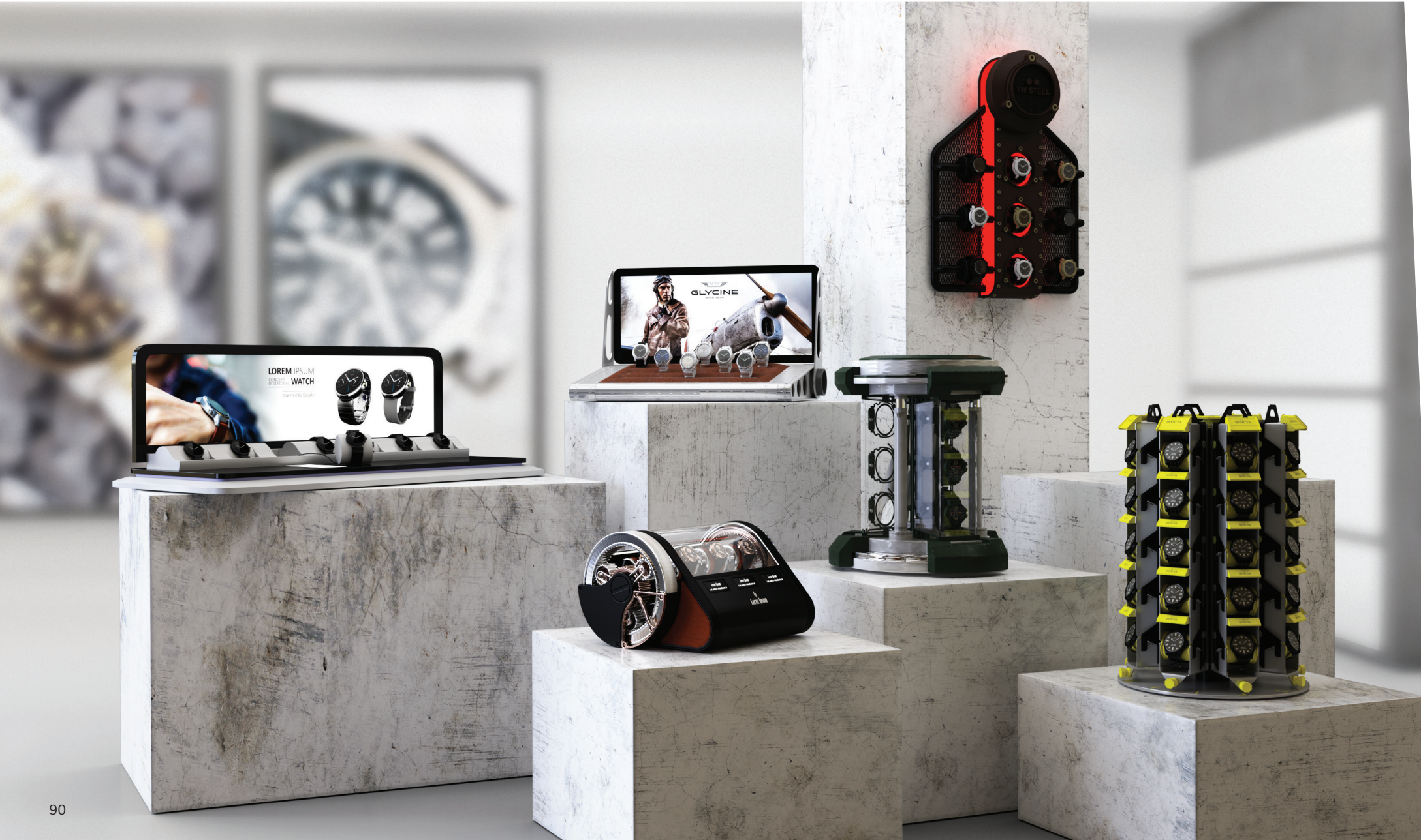
Watch displays - Multiple brands (3D render)