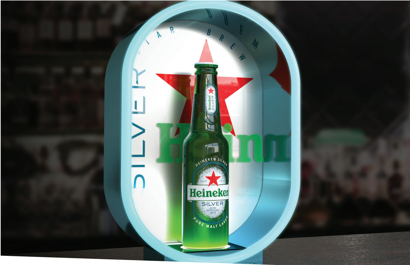
Bottle glorifier - Heineken Silver