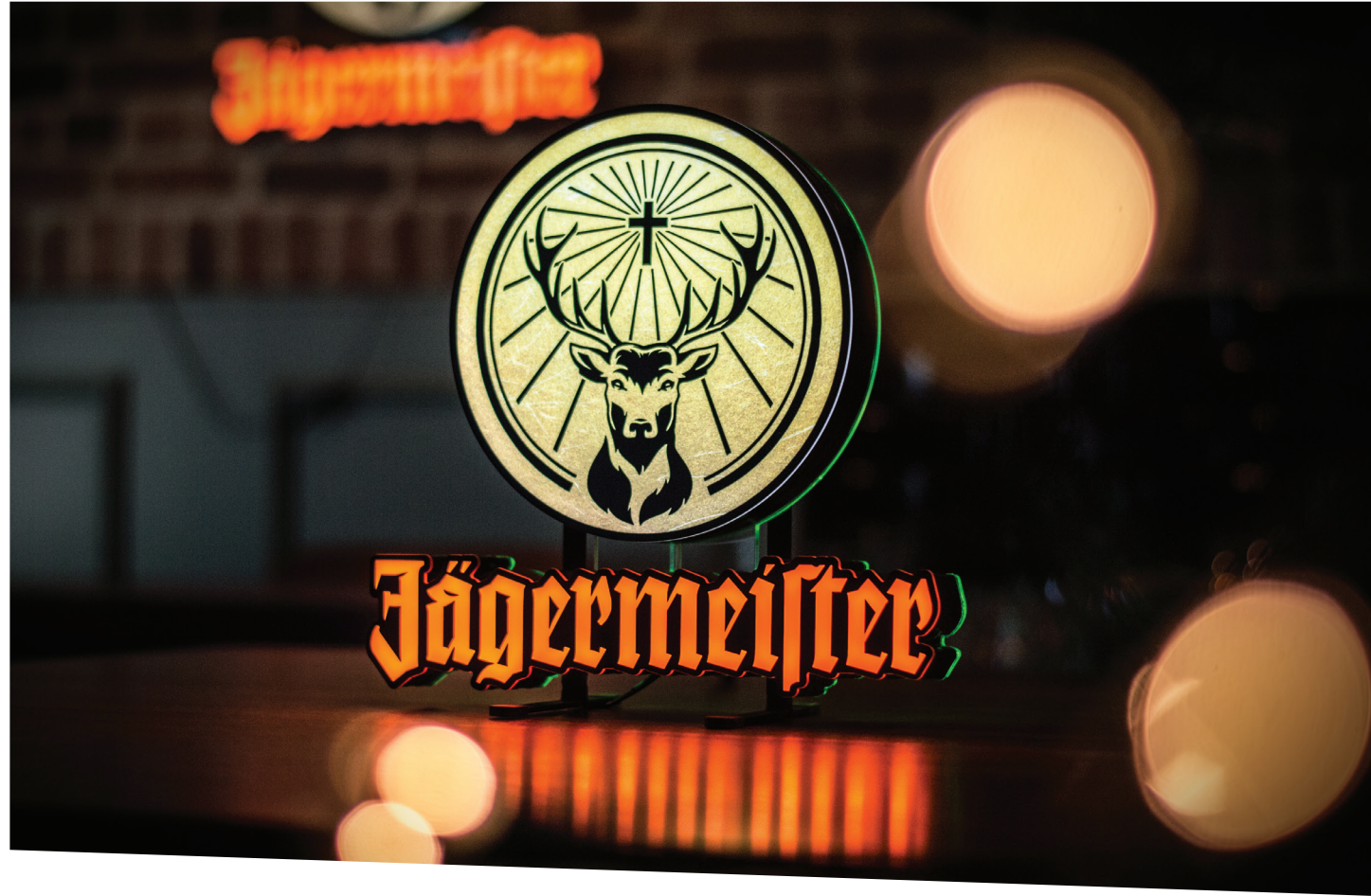
LEDSign - Jägermeister