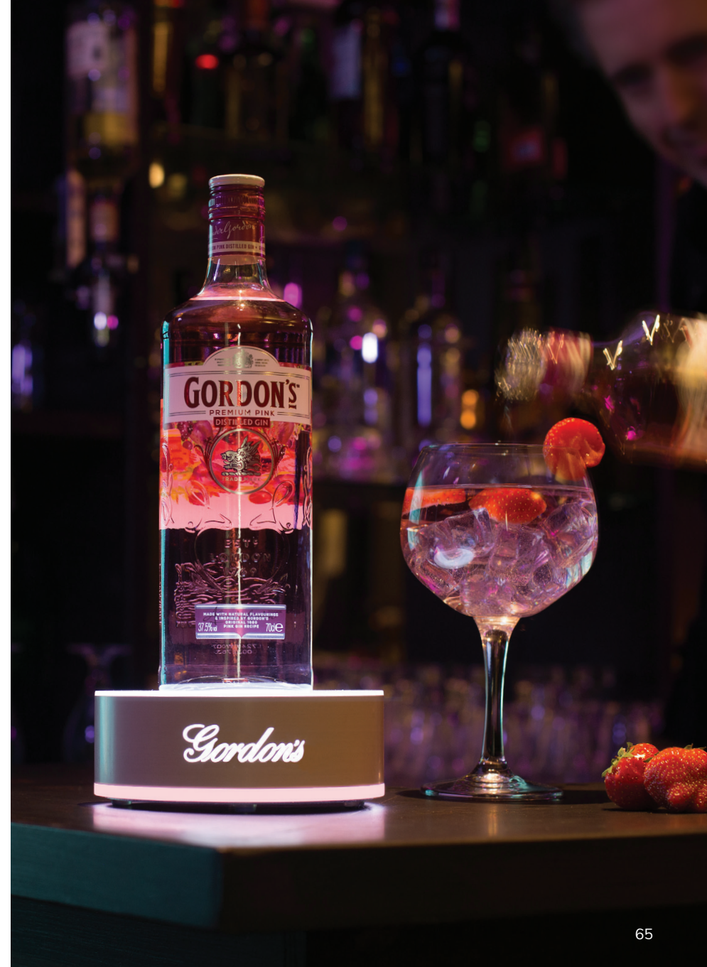
Bottle glorifier - Gordon's