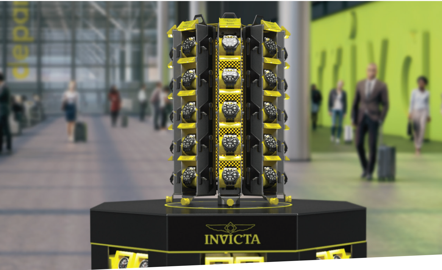
Watch display - Invicta (3D render)