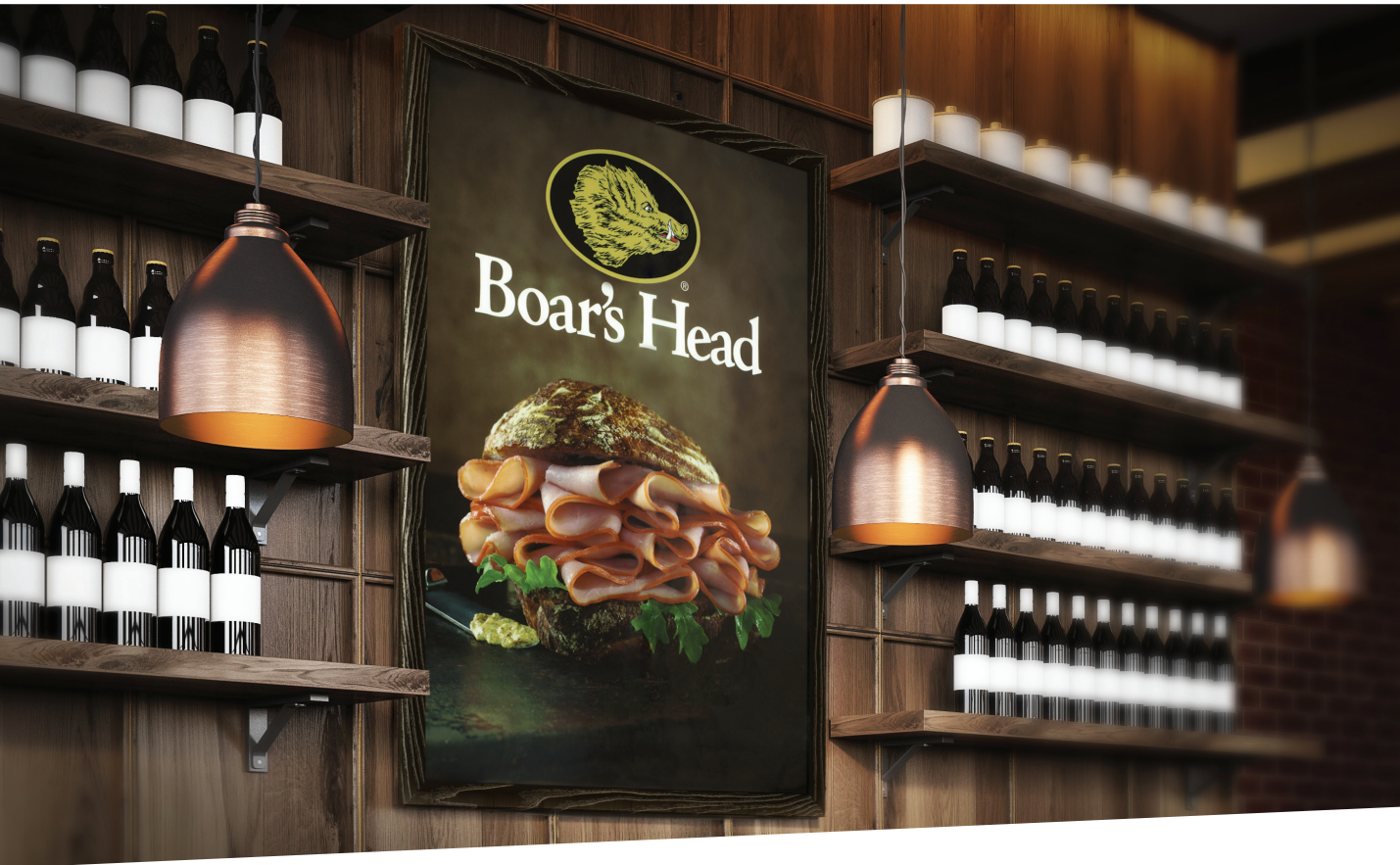
Wall LEDSign - Boar's Head