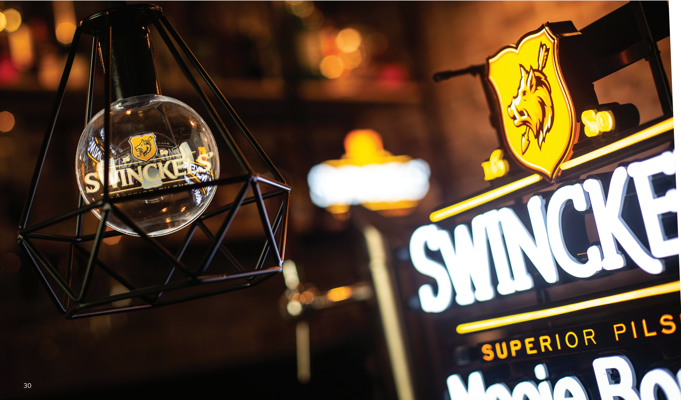
Light Bulb / LEDNeon - Swinckels