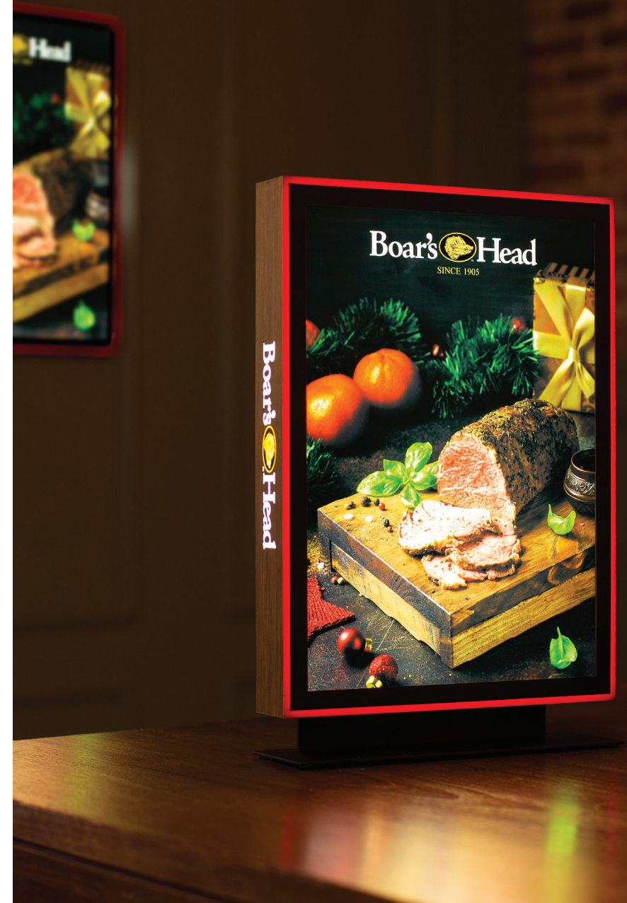
Display - Boar's Head