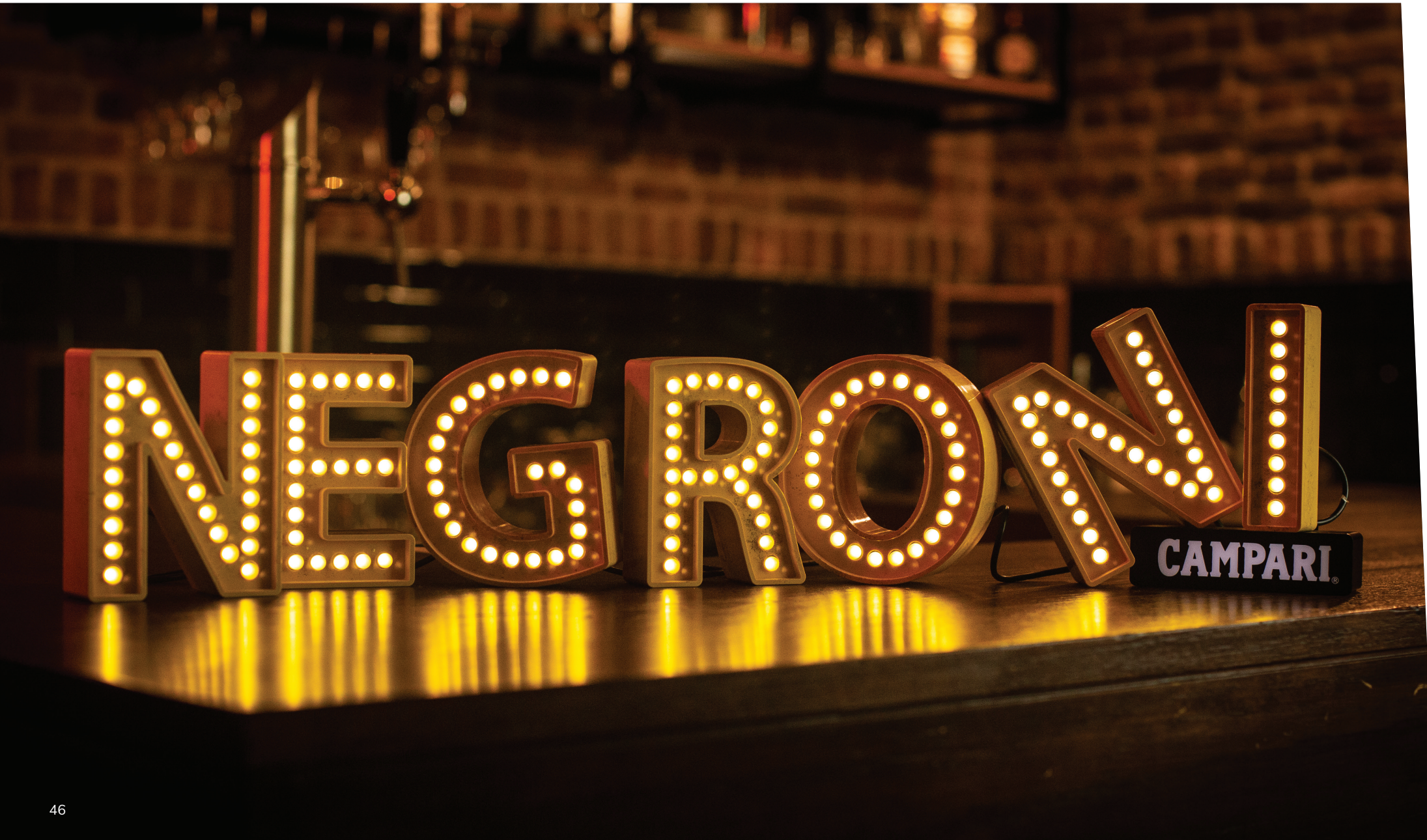
LEDSign - Negroni