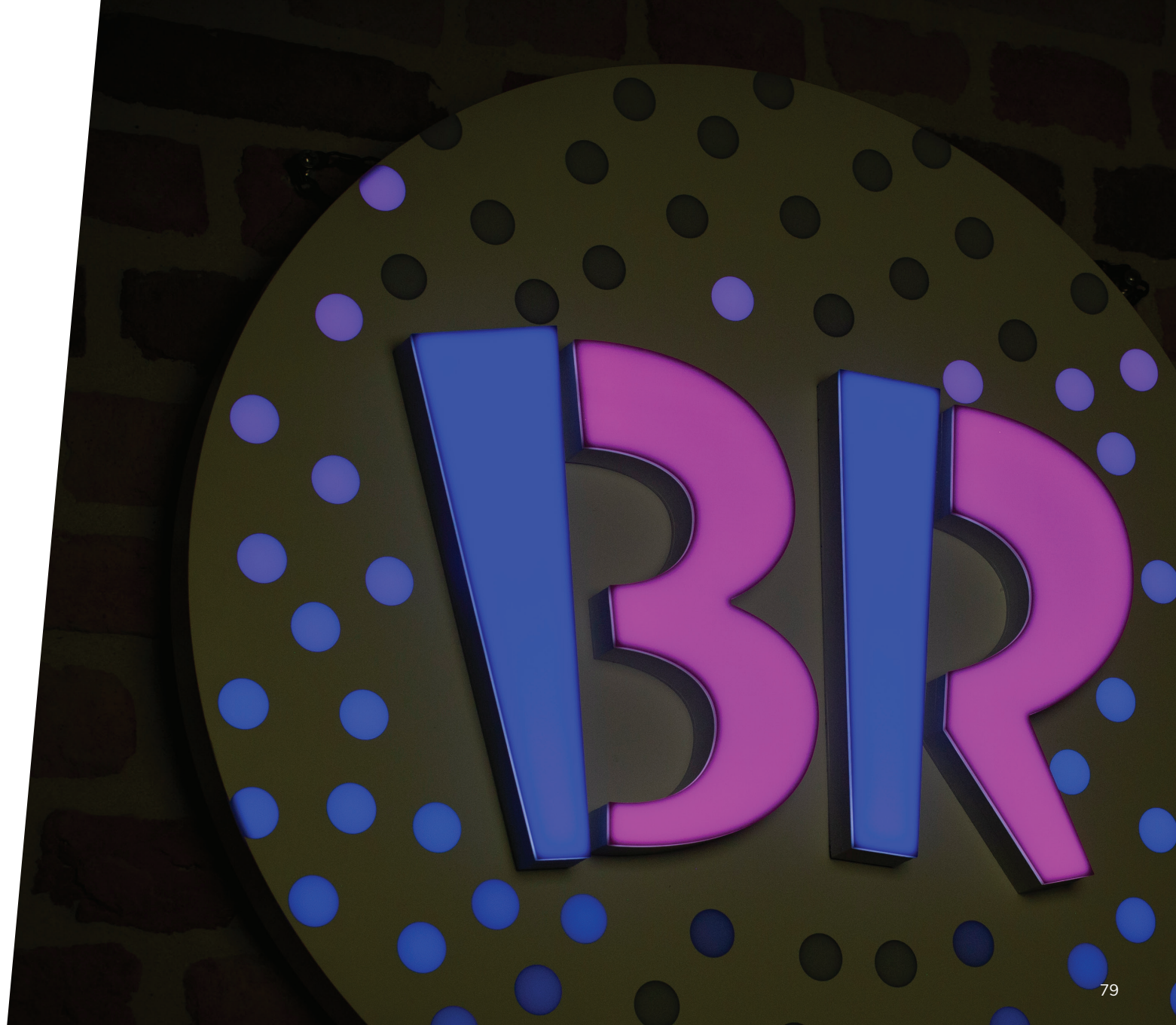
Animated LEDSign - Baskin Robbins