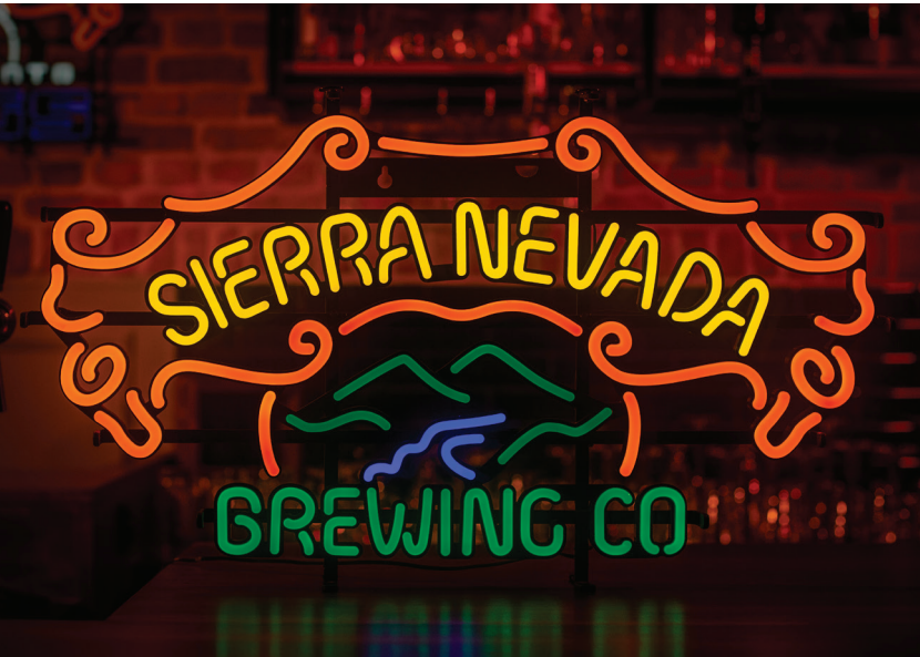
LEDNeon - Sierra Nevada