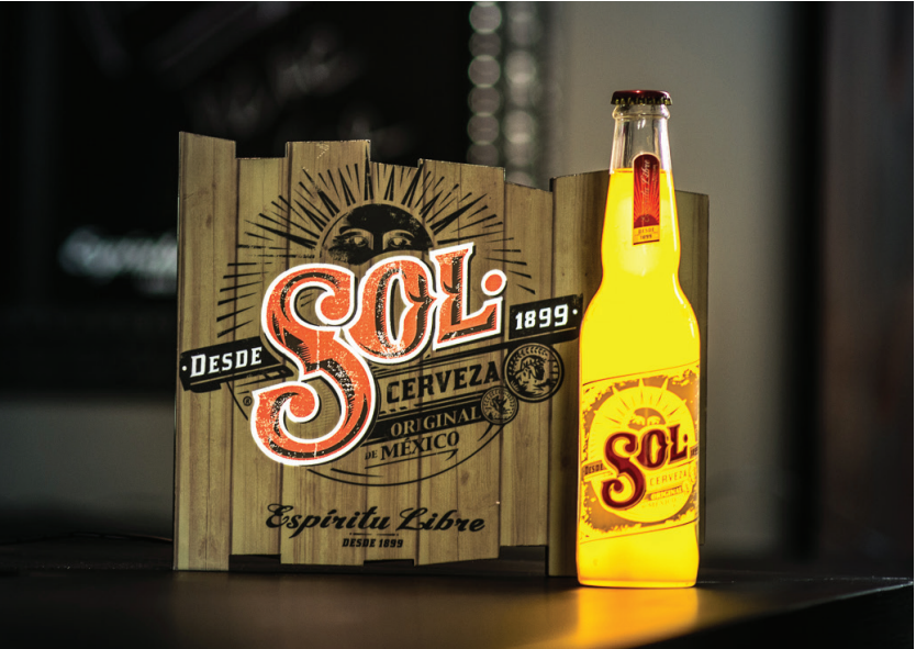
Bottle glorifier - Sol