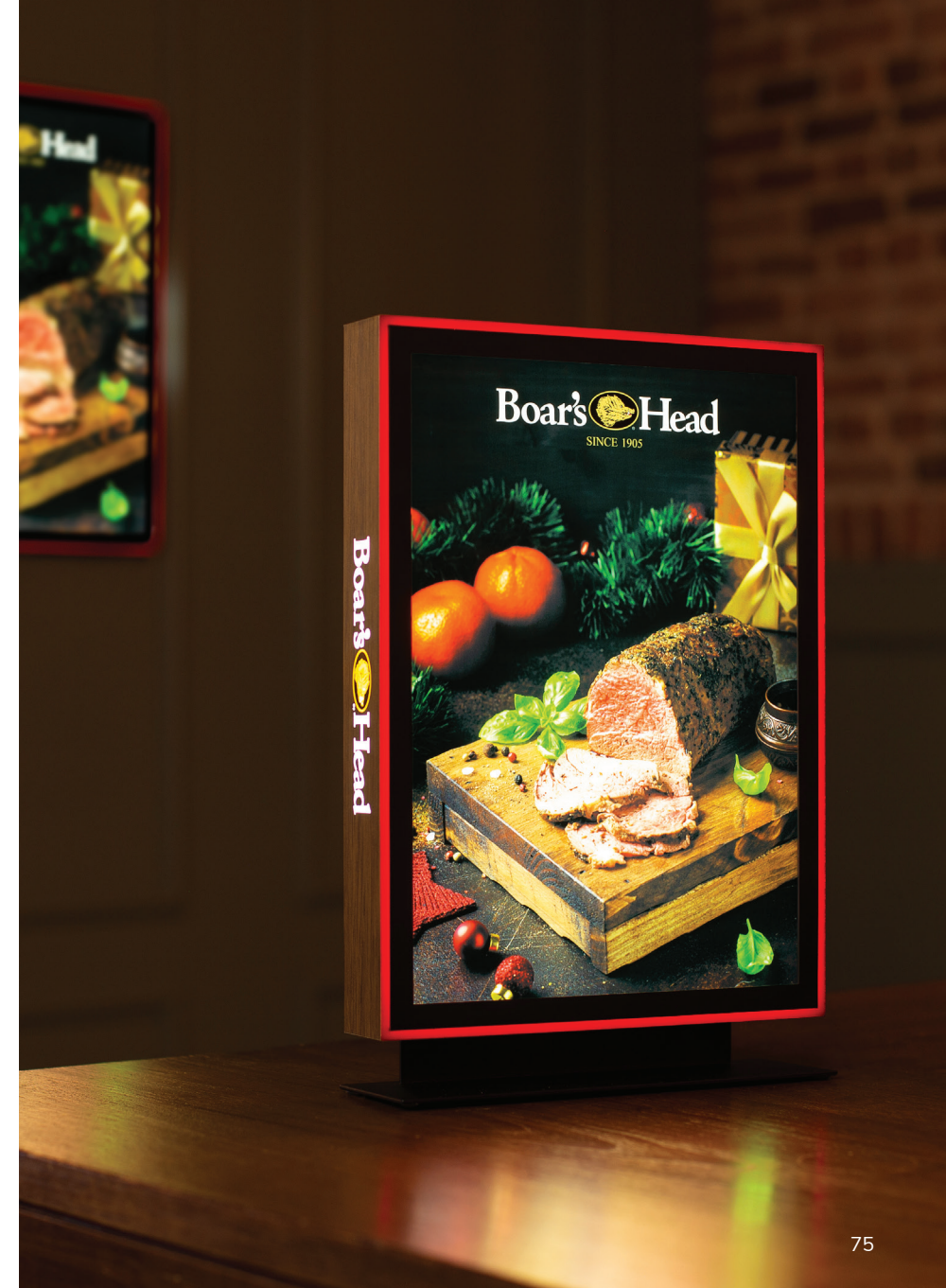
Display - Boar's Head