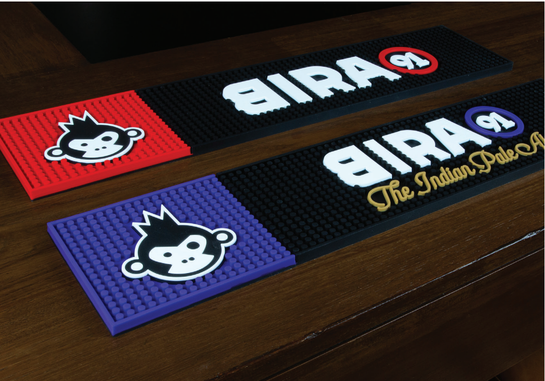
Barrunner - Bira91