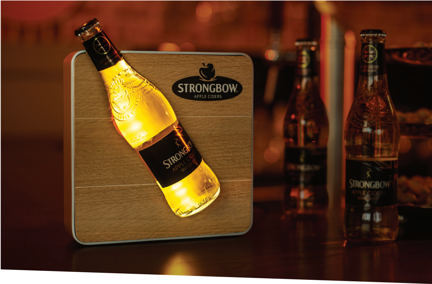
LEDSign - Strongbow