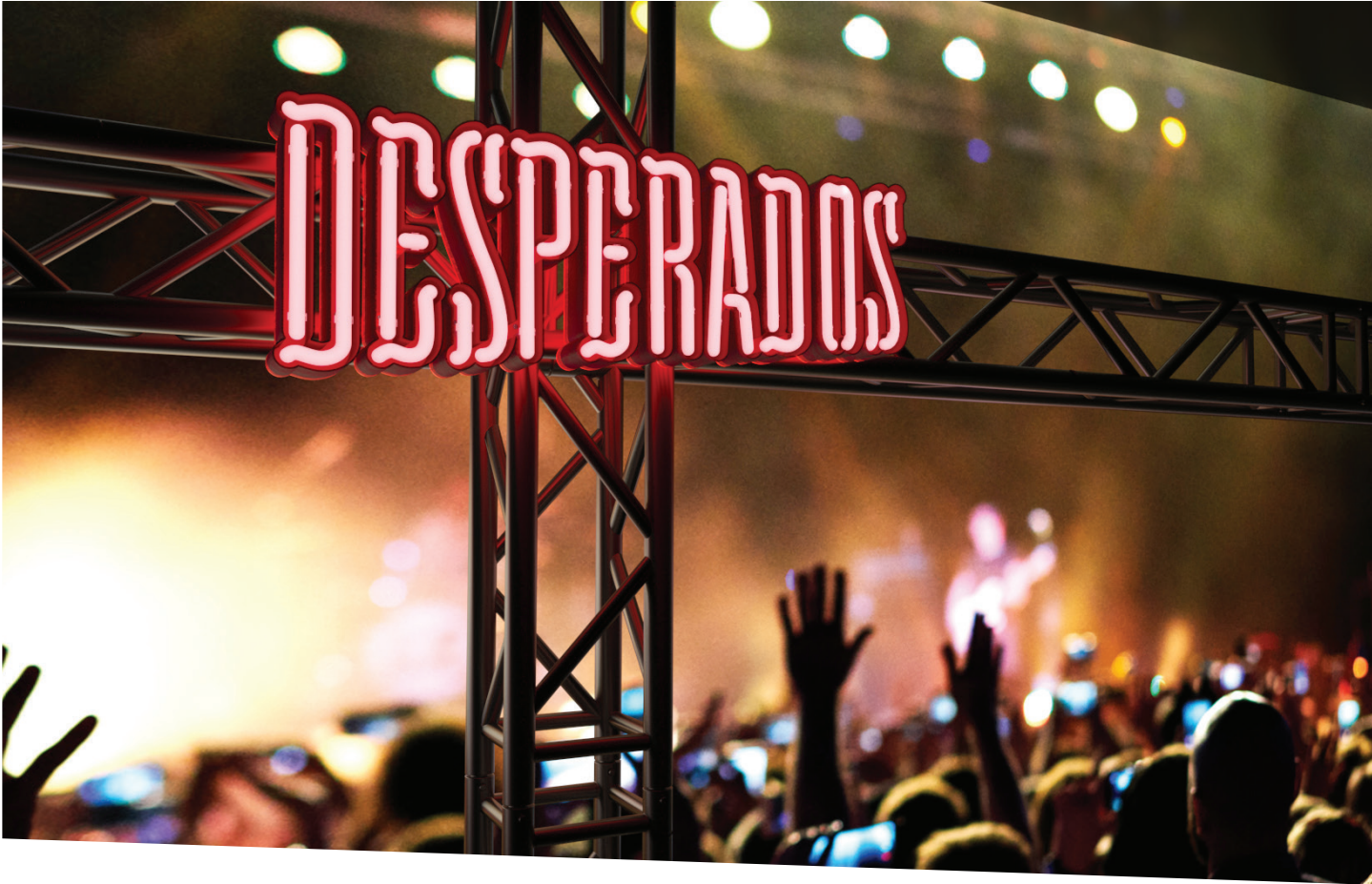
Outdoor LEDNeon - Desperados (3D render)