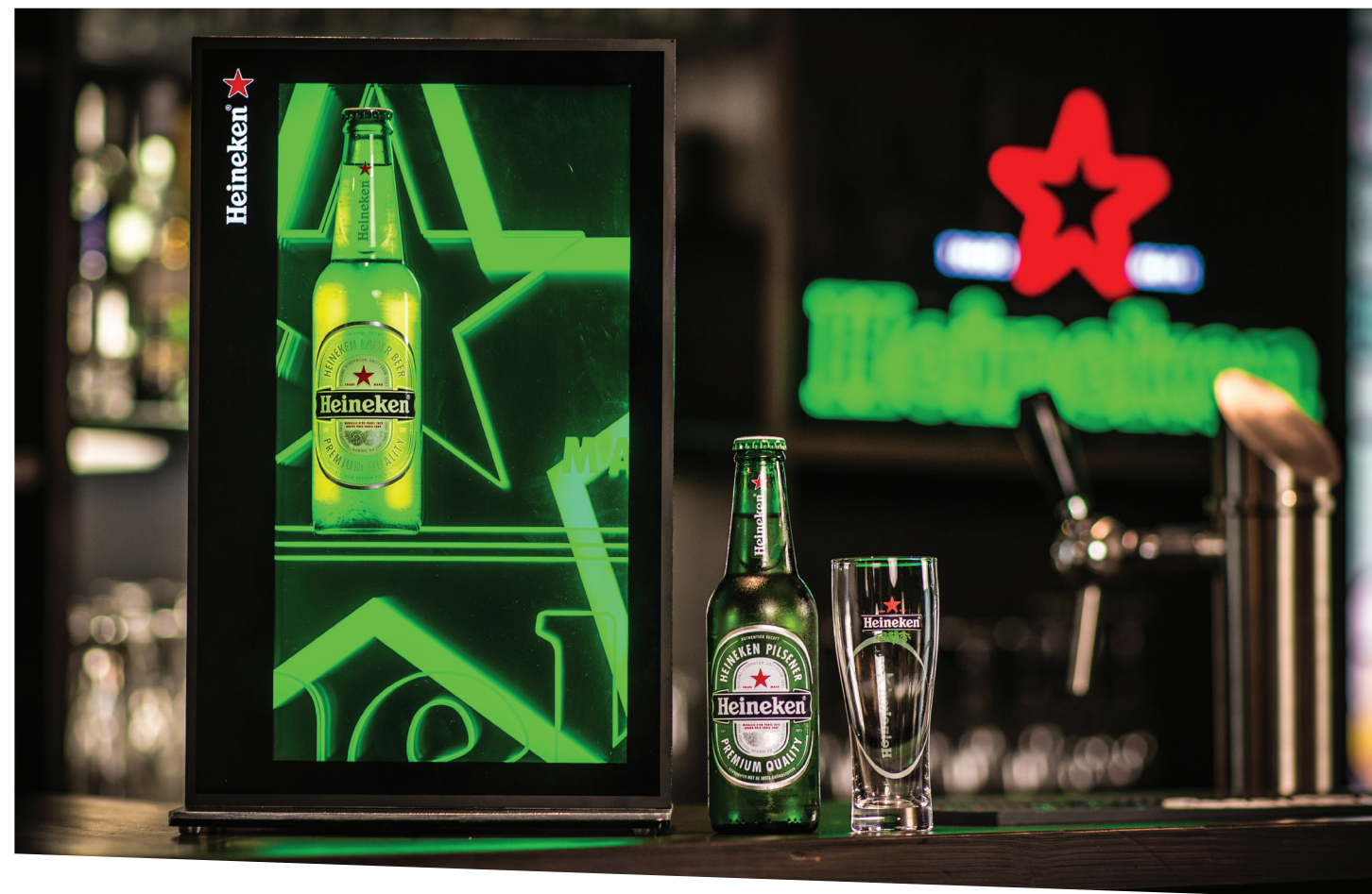
Bottle glorifier - Heineken