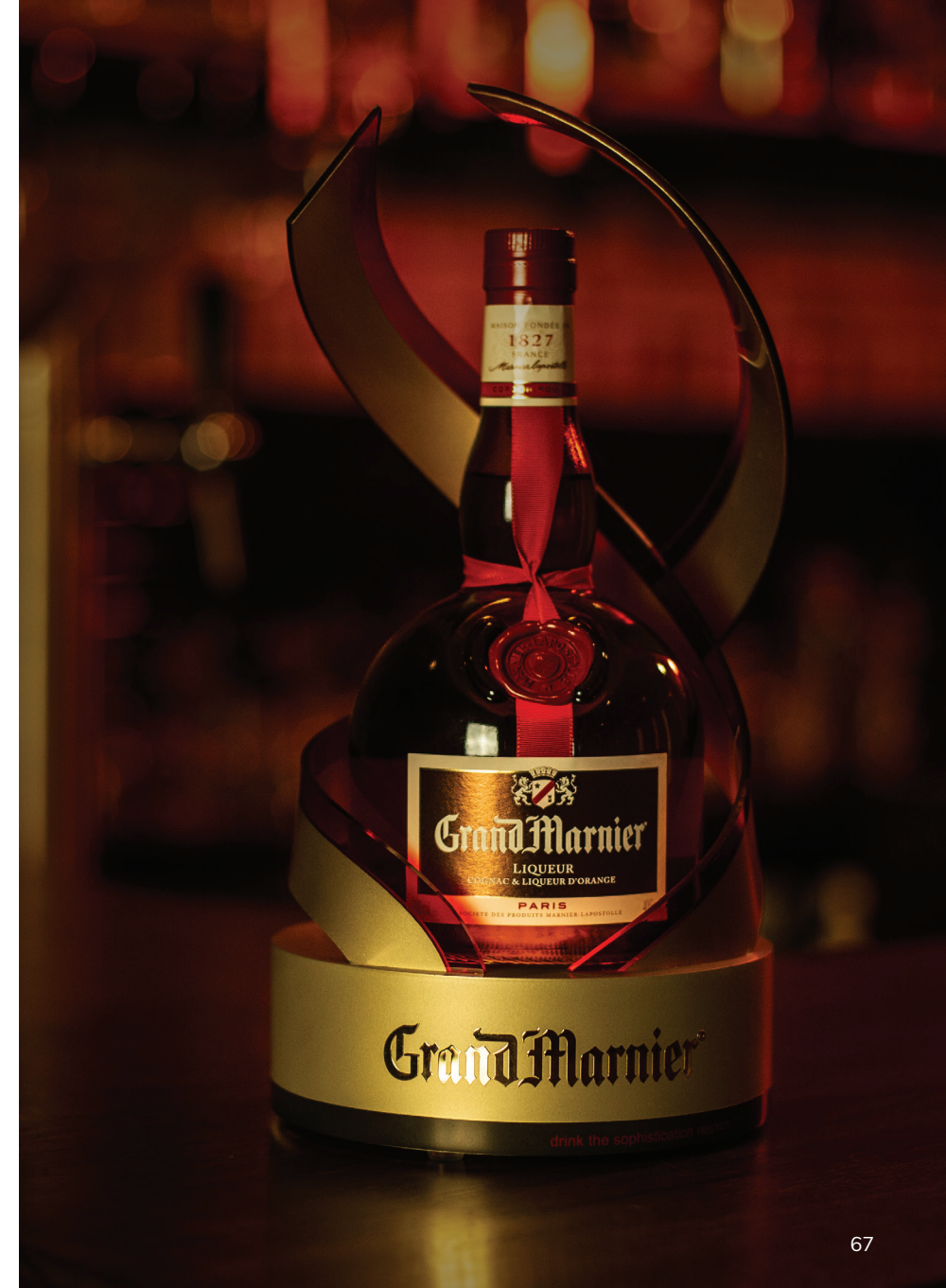
Bottle glorifier - Grand Marnier