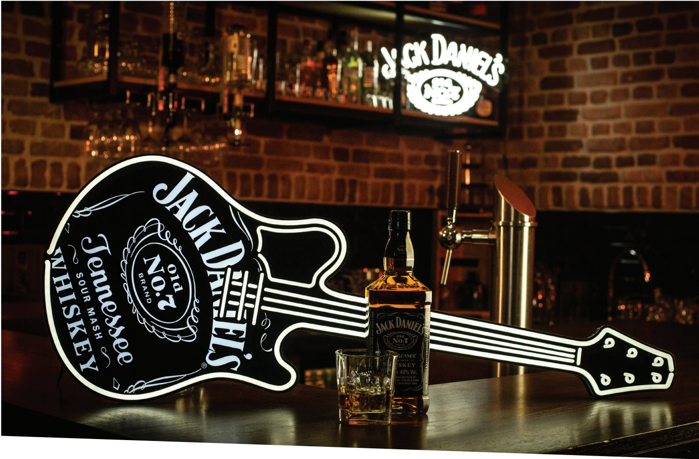
LEDNeon - Jack Daniels