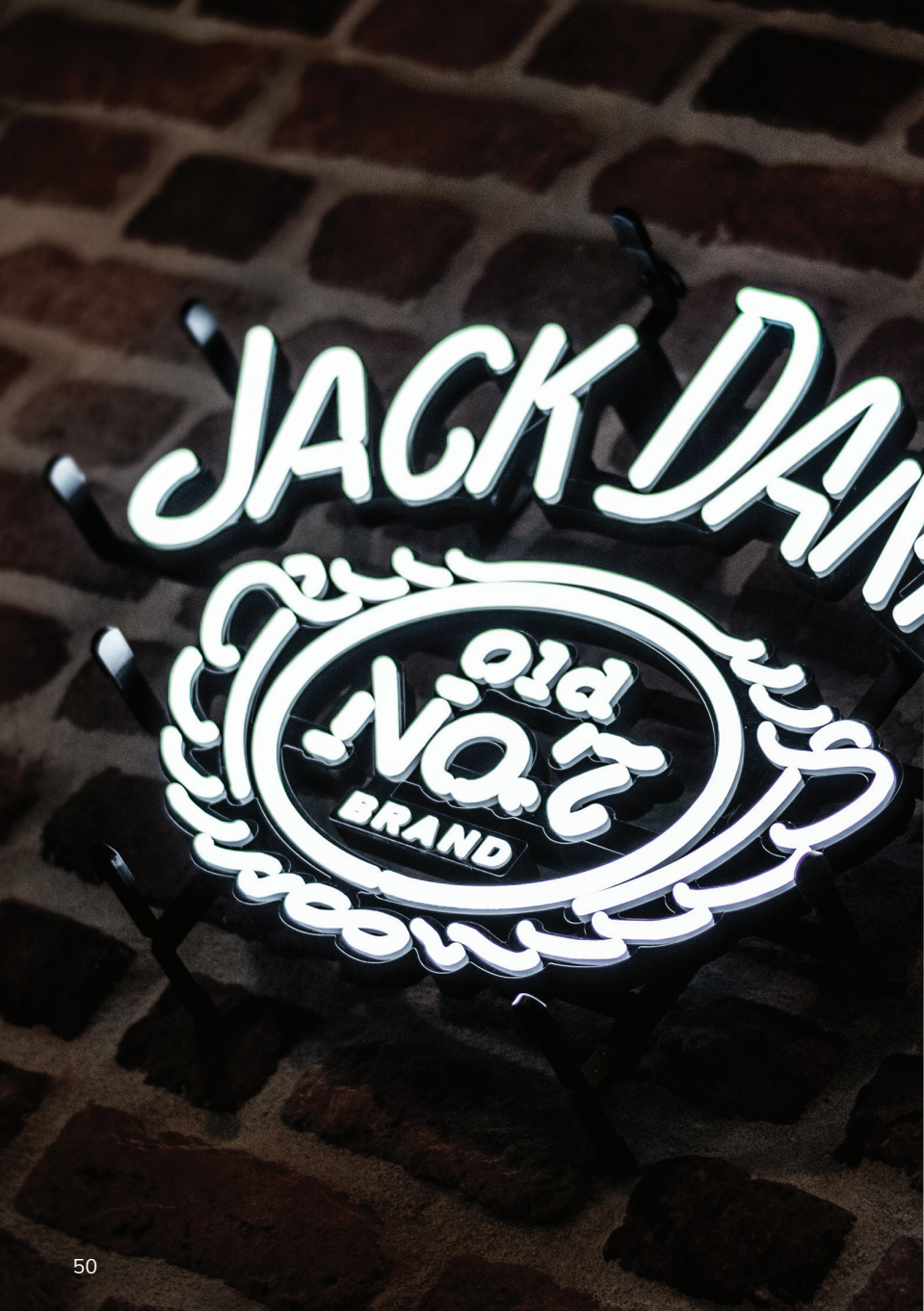
LEDNeon - Jack Daniels