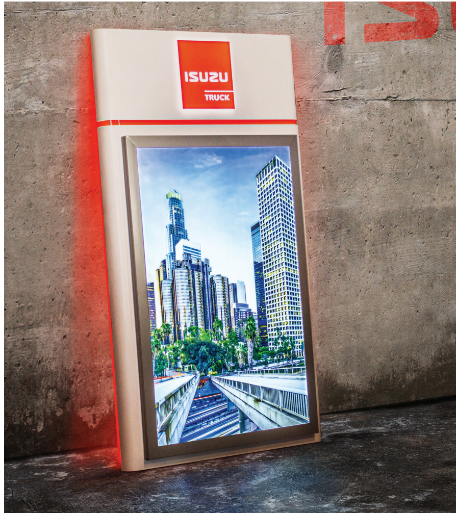
Wall LEDSign - Isuzu