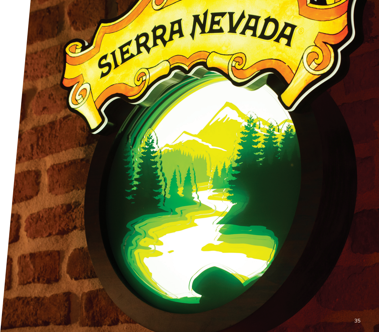
LEDSign - Sierra Nevada