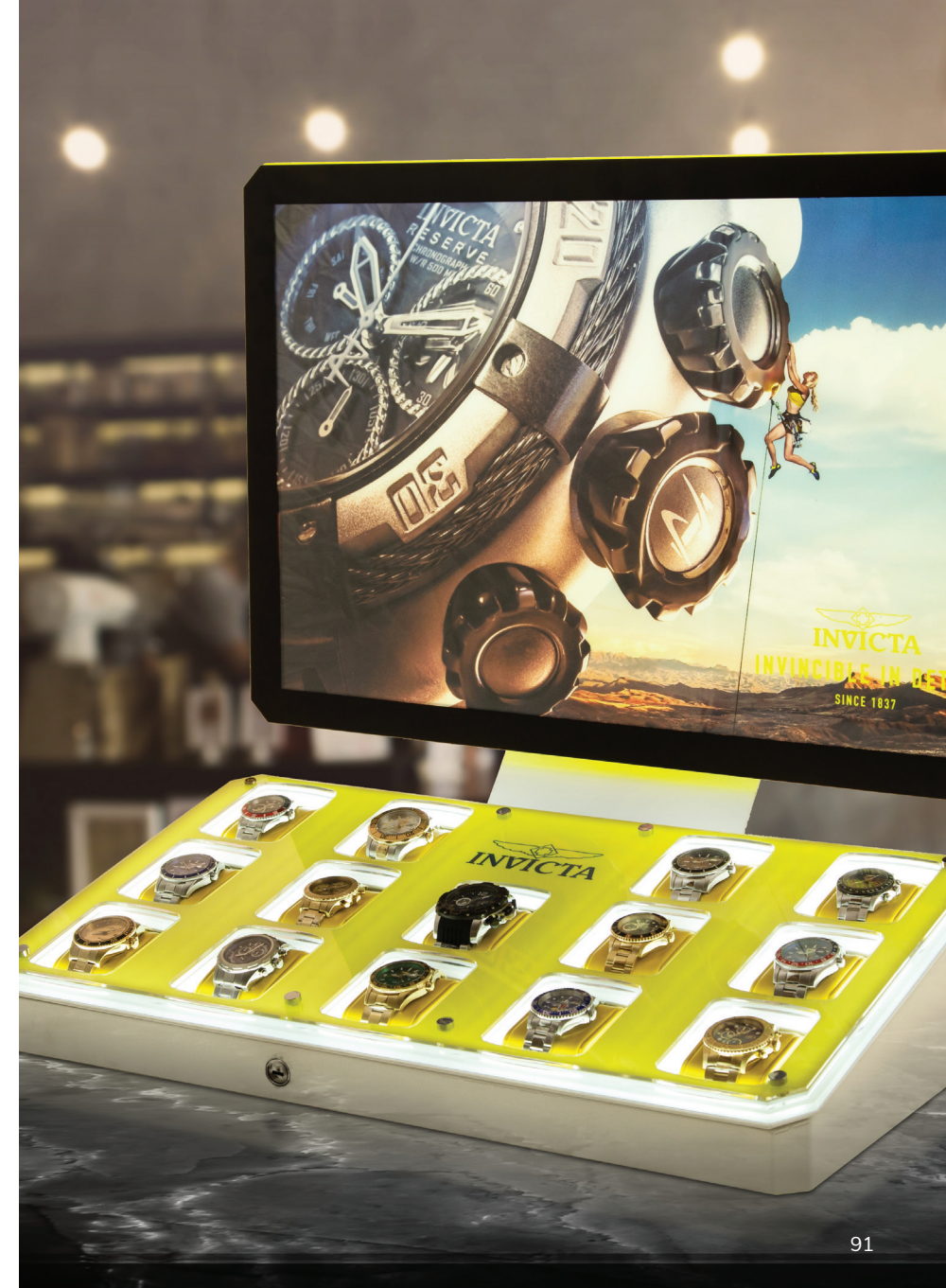
Watch display - Invicta (3D render)