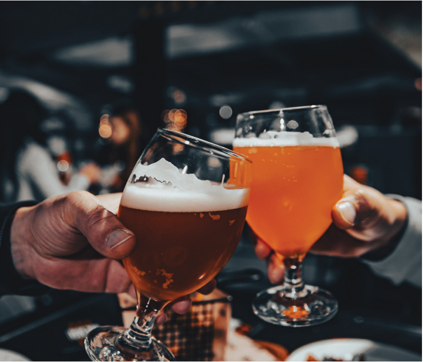
LEDNeon - Brewdog