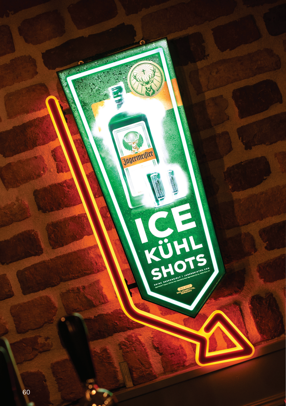
LEDSign - Jägermeister