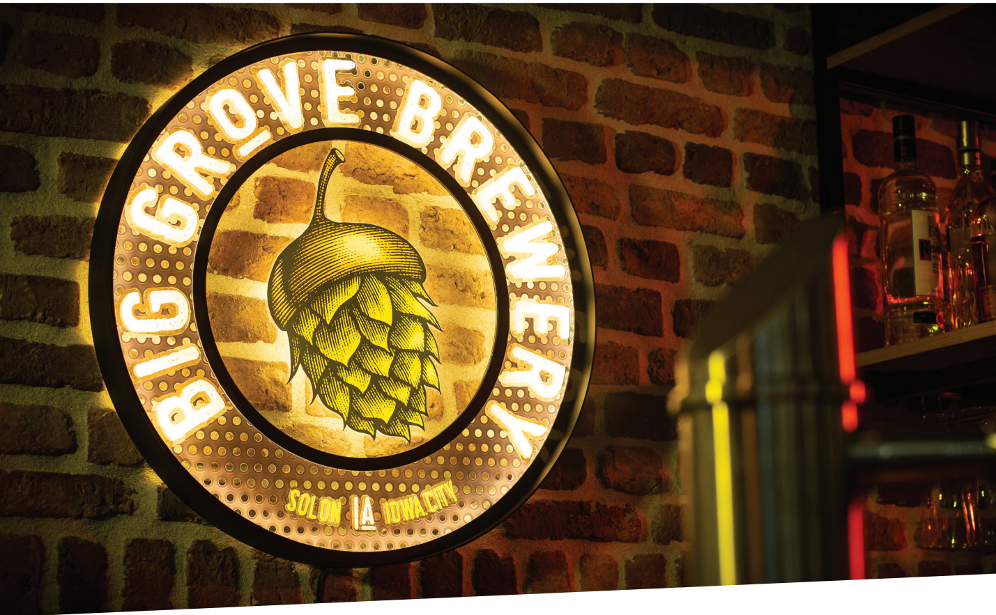
LEDNeon - Big Grove Brewery