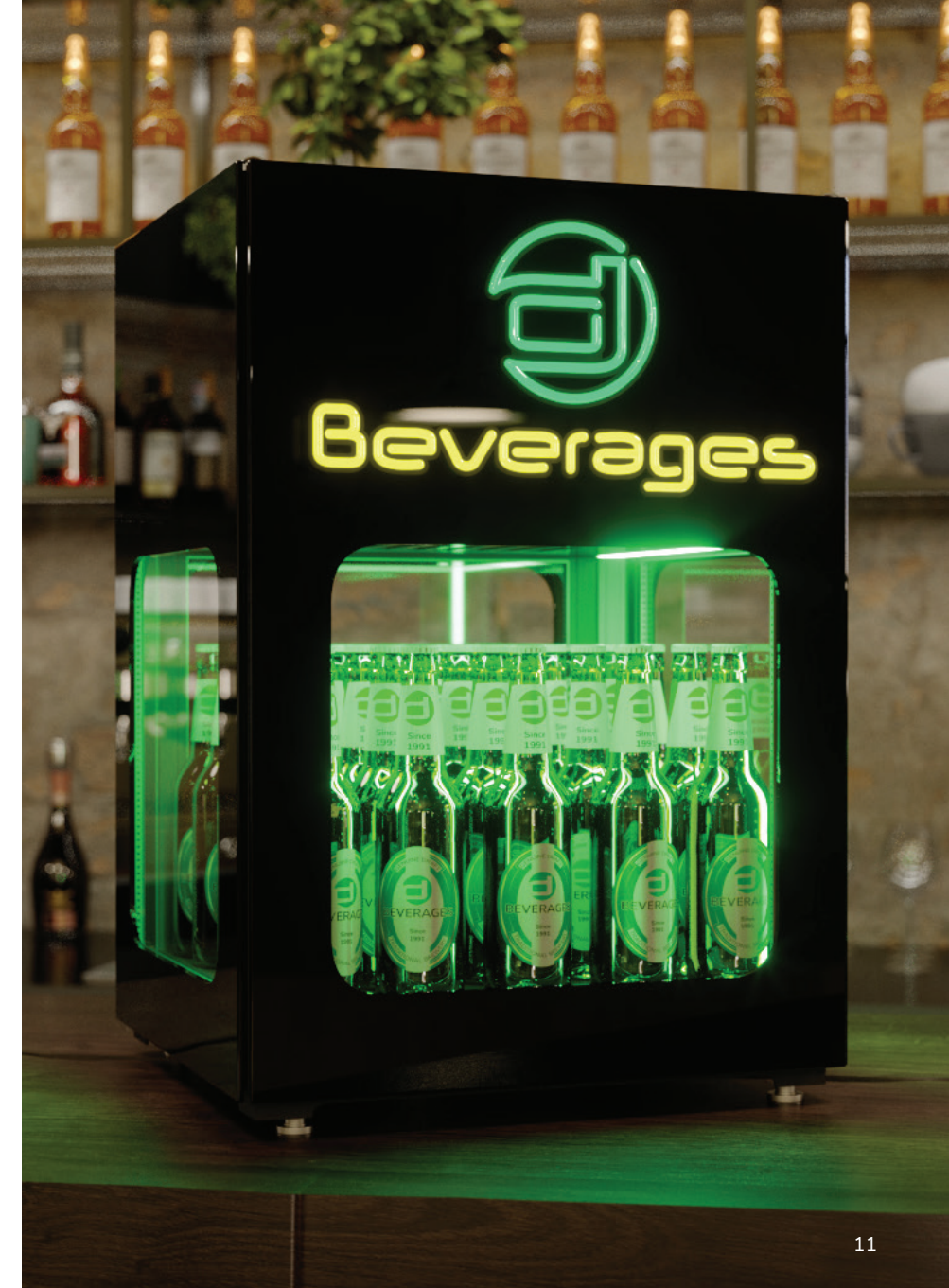
B.360 fridge - Dekkers Beverages