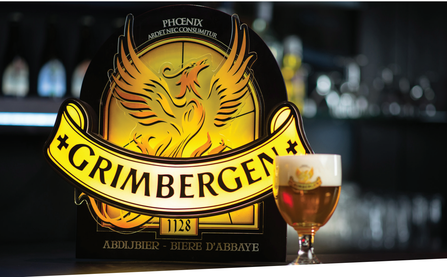
LEDSign - Grimbergen