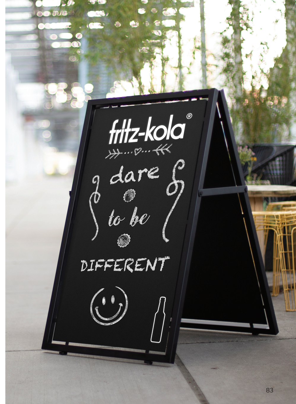
Pavement stand - Fritz-Kola