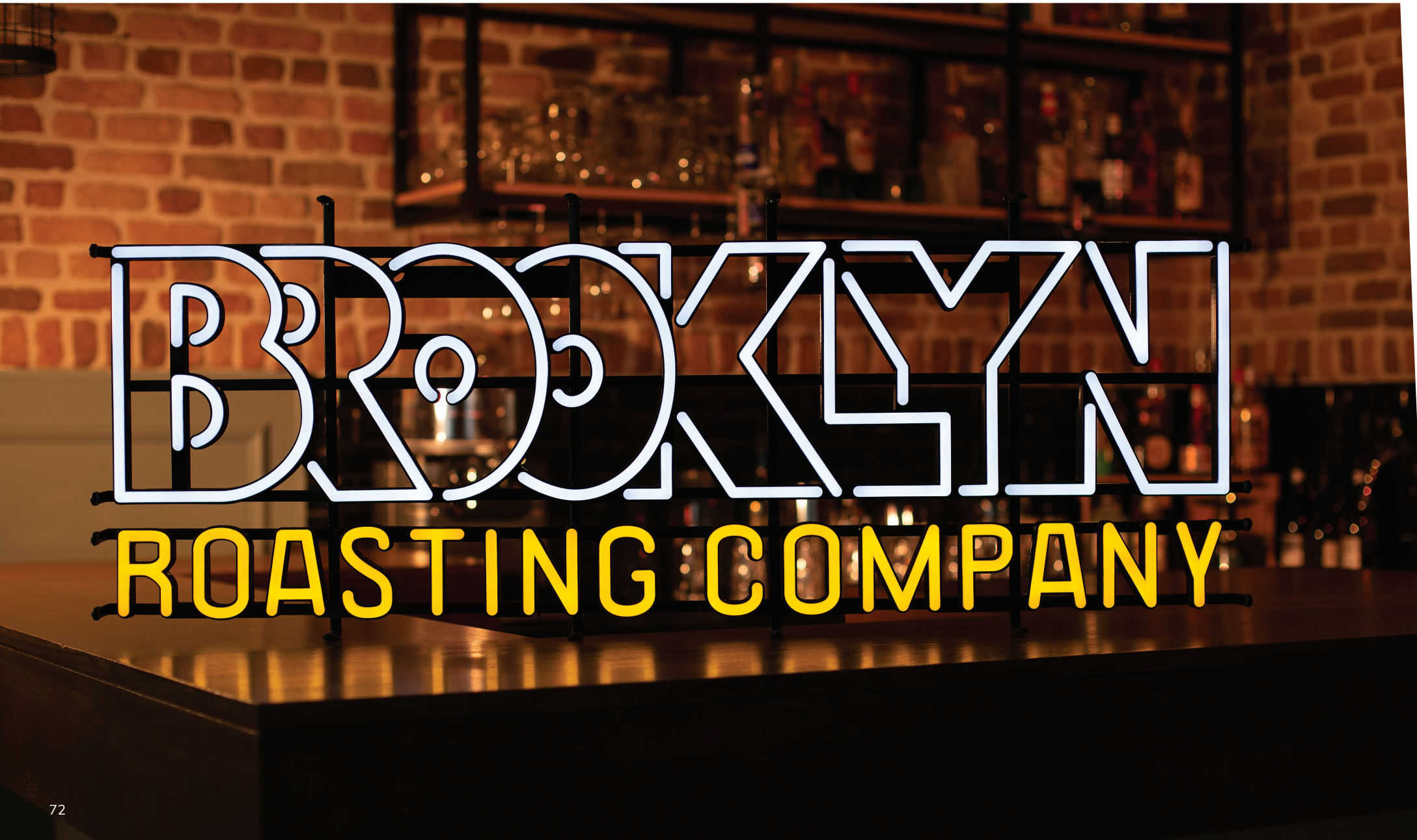
LEDNeon - Brooklyn Roasting Company