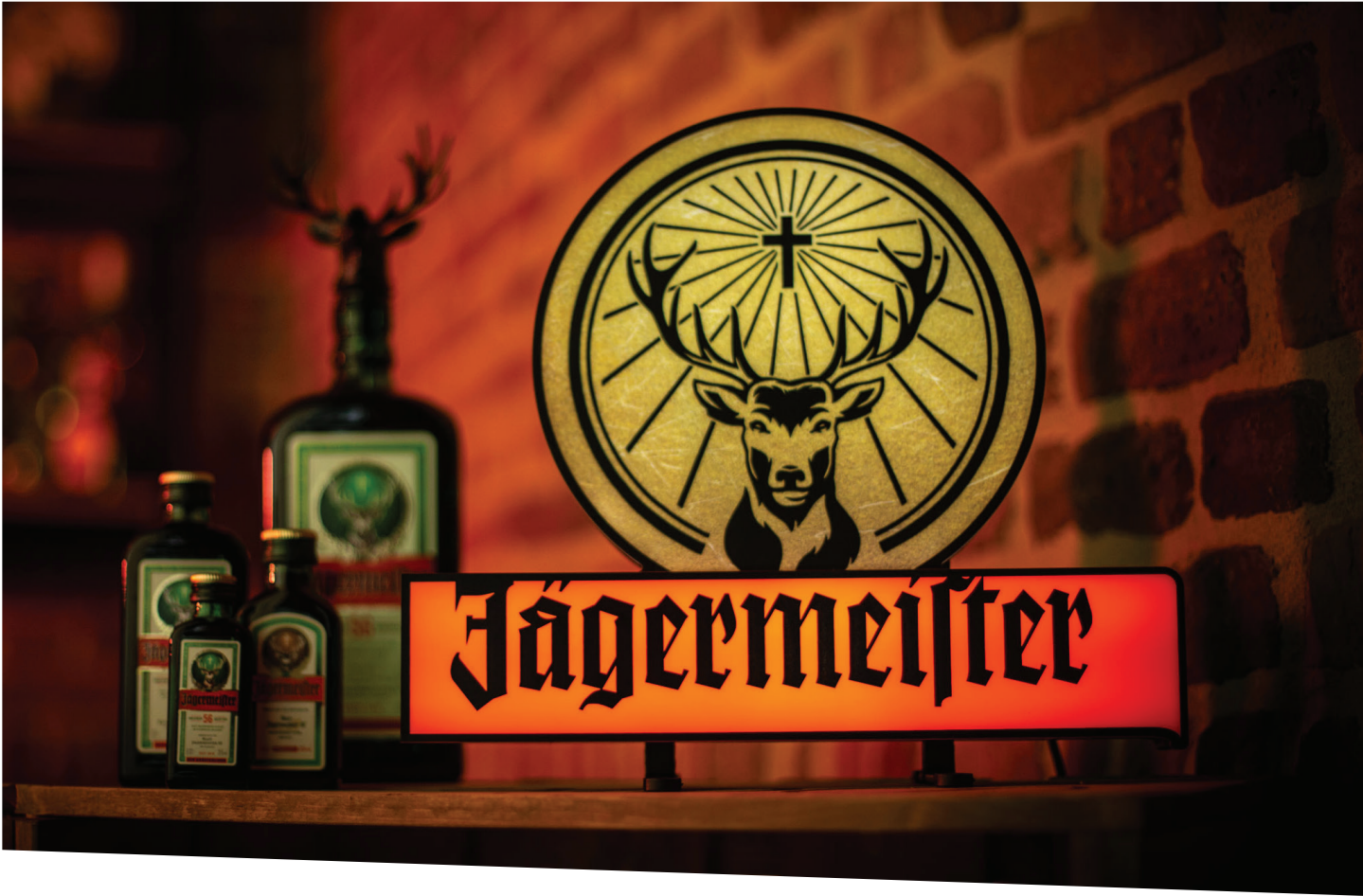
LEDSign - Jägermeister