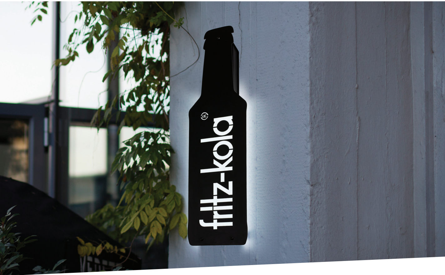
Outdoor LEDsign - Fritz-Kola