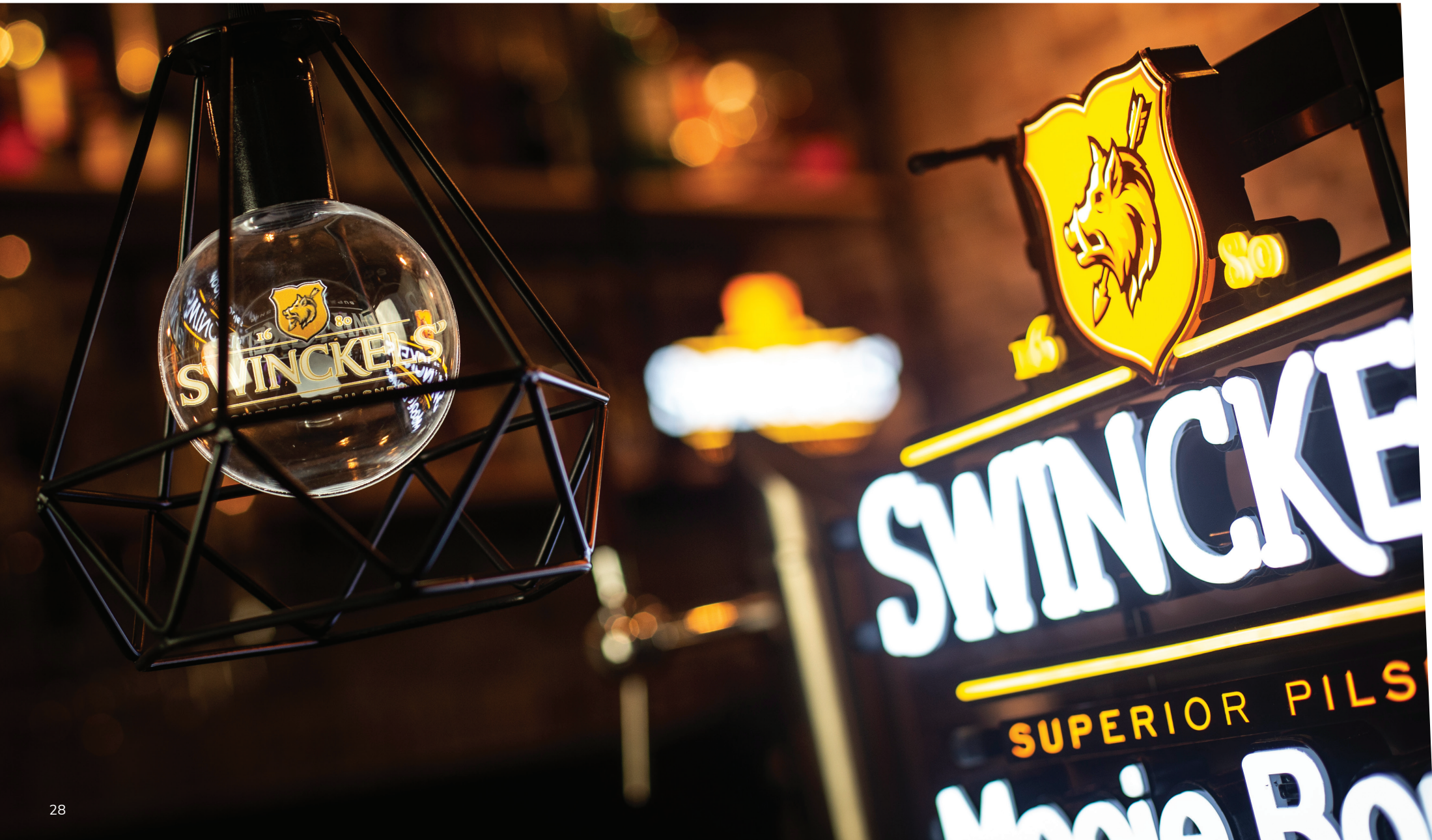
Light Bulb / LEDNeon - Swinckels