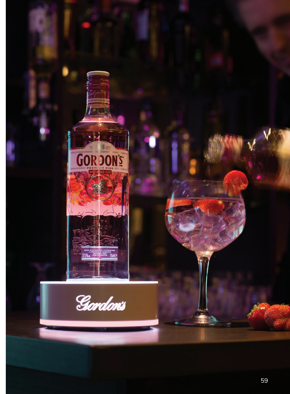
Bottle glorifier - Gordon's