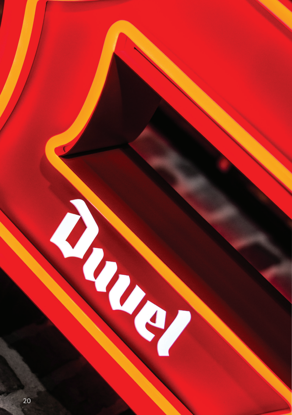
LEDNeon - Duvel