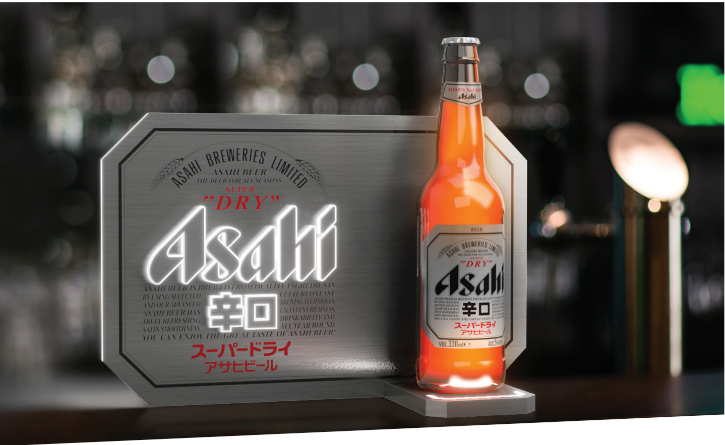
Bottle glorifier - Asahi