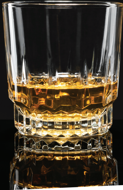
LEDSign - Jack Daniels