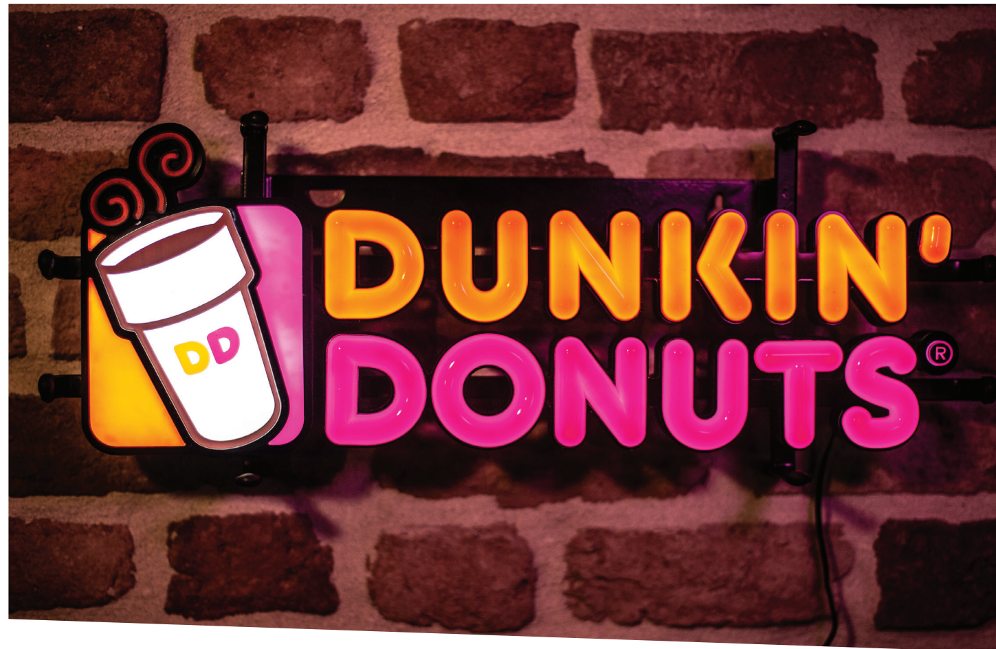
LEDNeon - Dunkin' Donuts