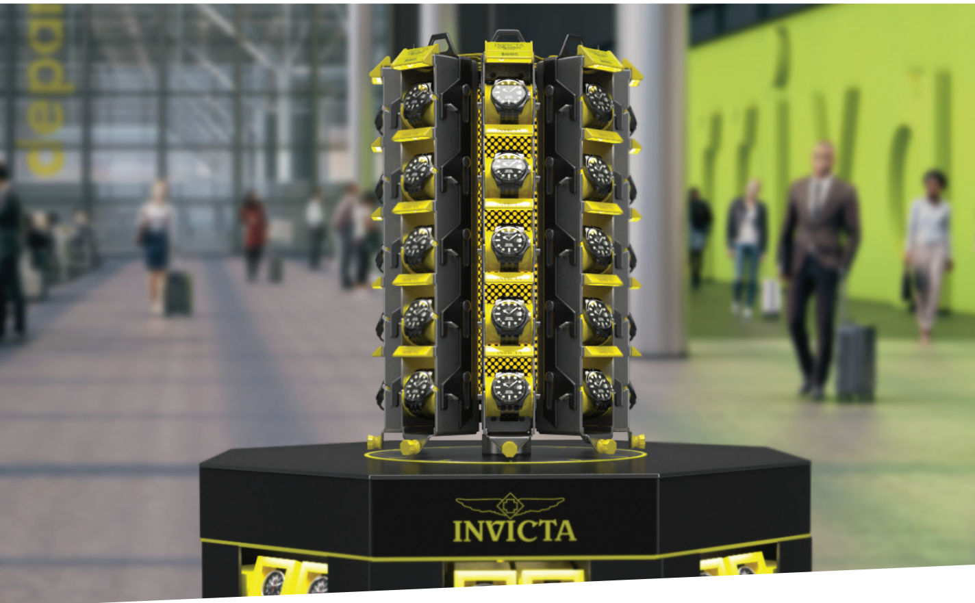
Watch display - Invicta (3D render)