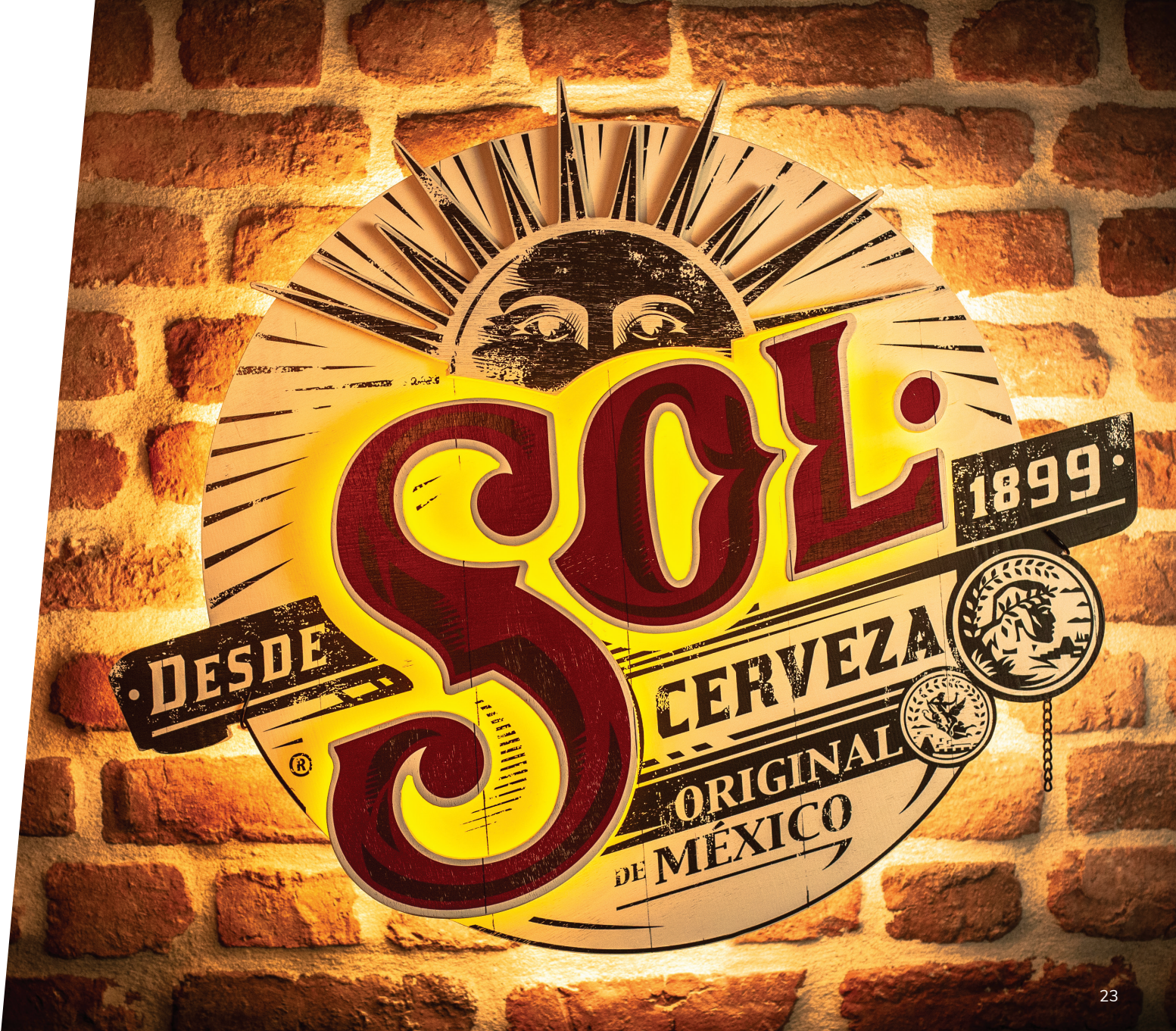
LEDsign - Sol