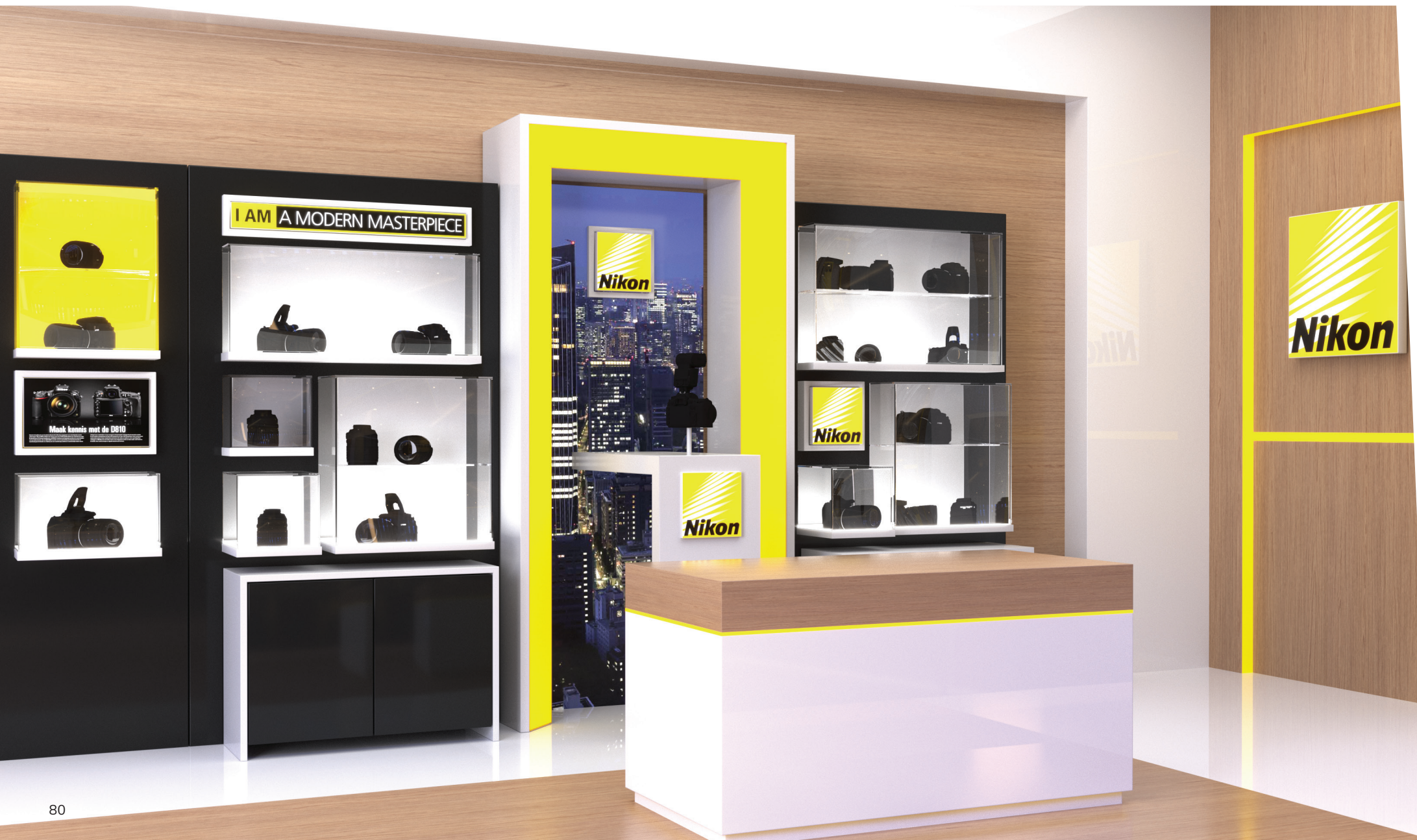
Shop in shop - Nikon (3D render)