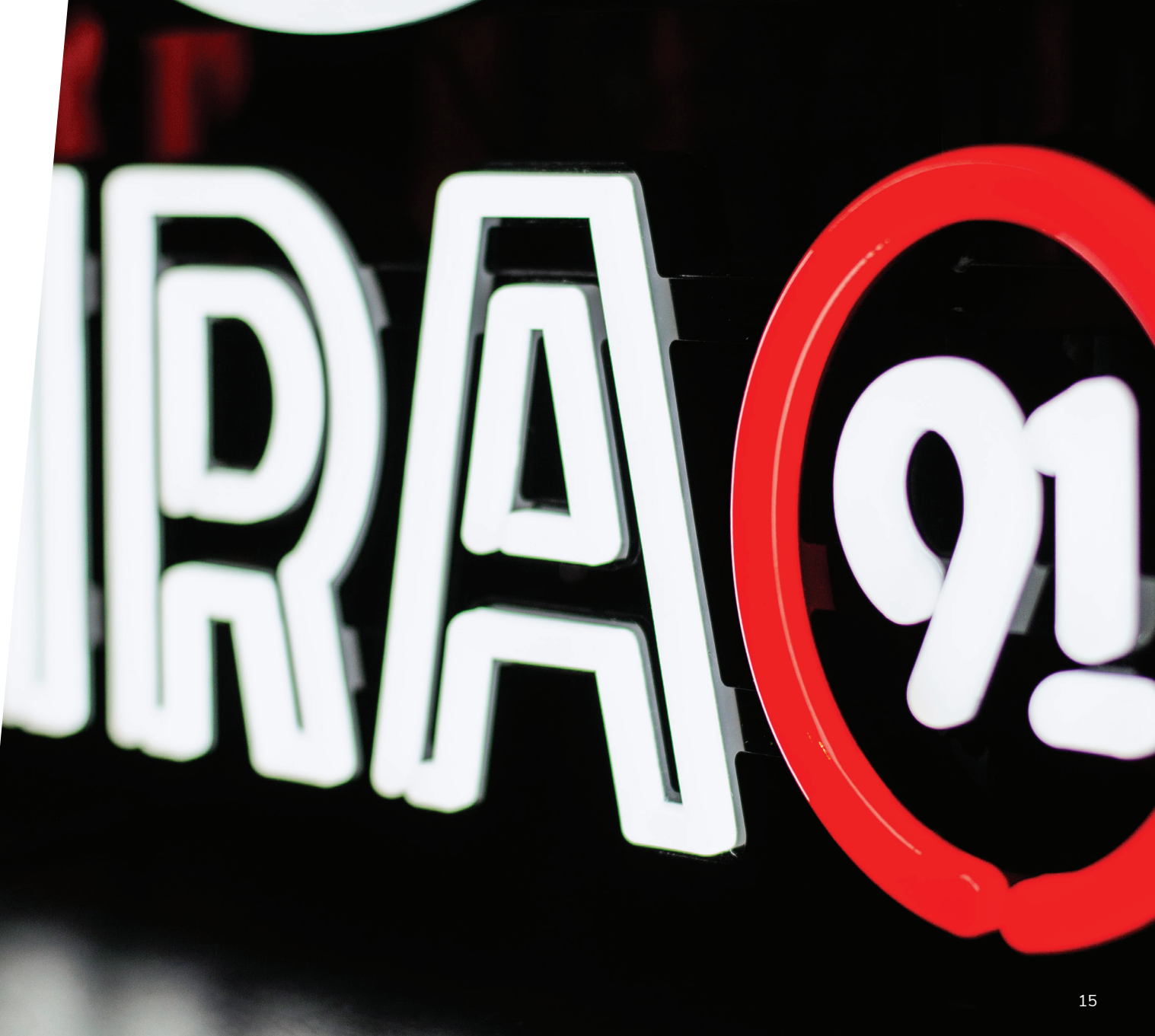
LEDNeon - Bira91