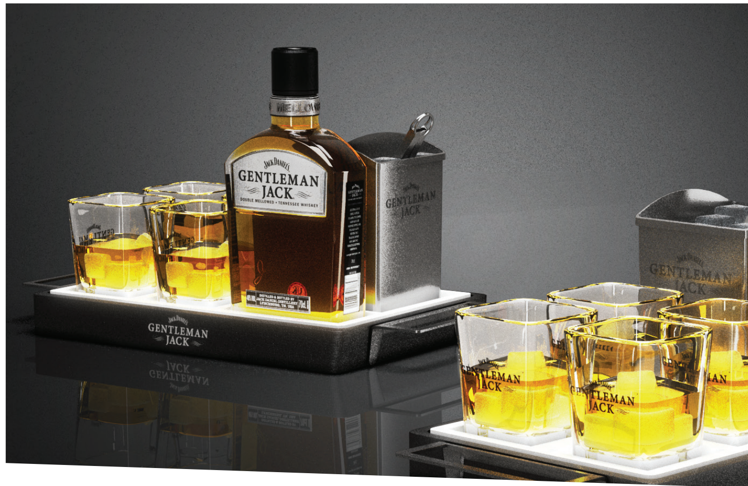
Serving tray - Gentleman Jack (3D render)