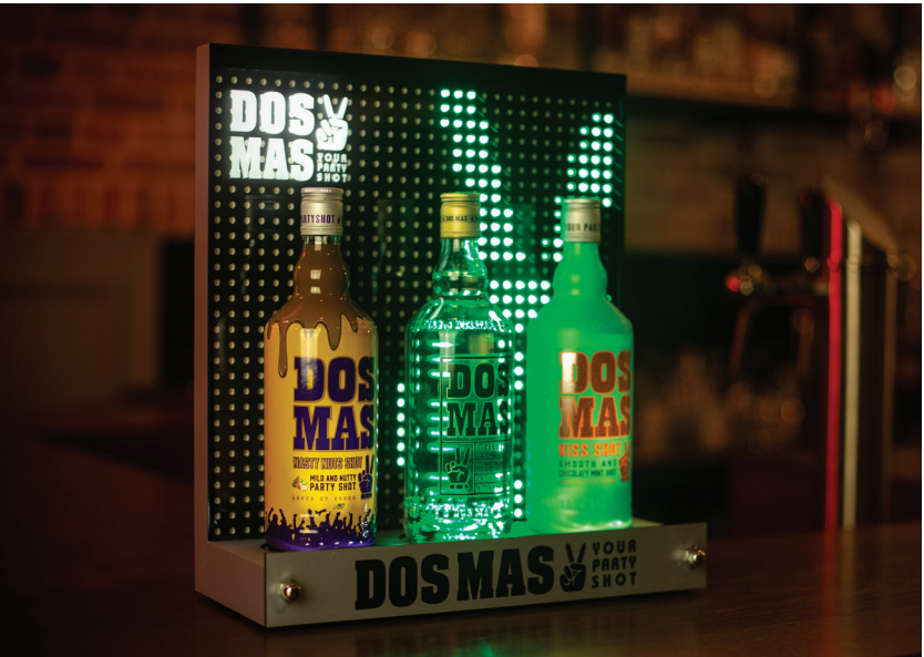
Animated bottle glorifier - Dos Mas