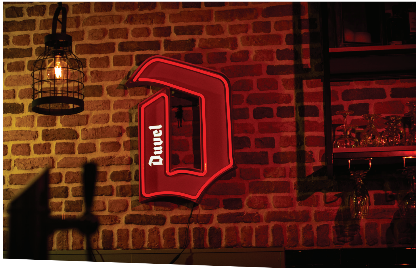
LEDNeon - Duvel