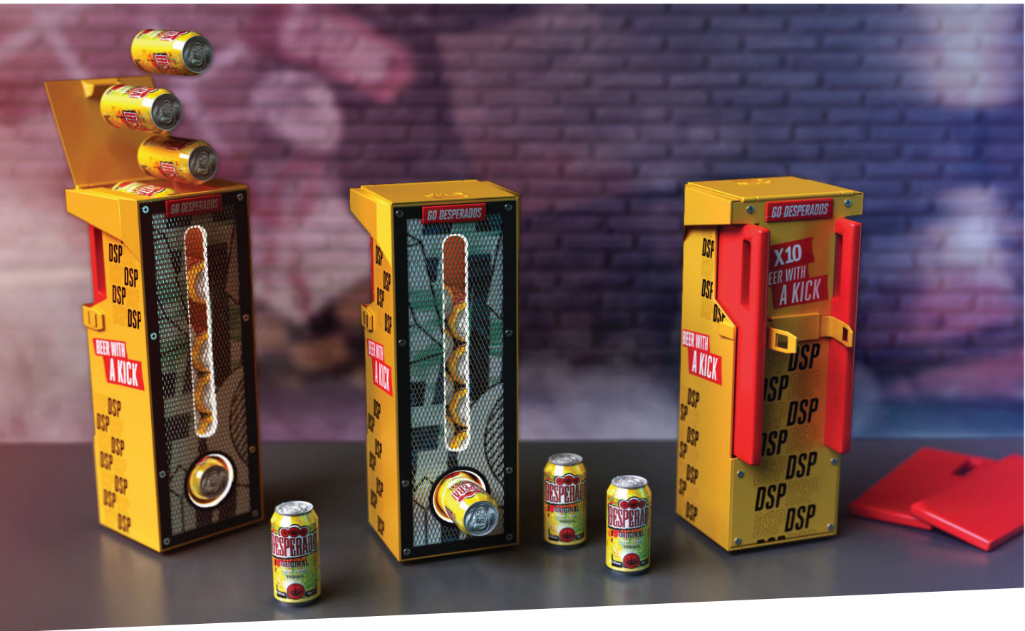
Can Tower - Desperados (3D render)