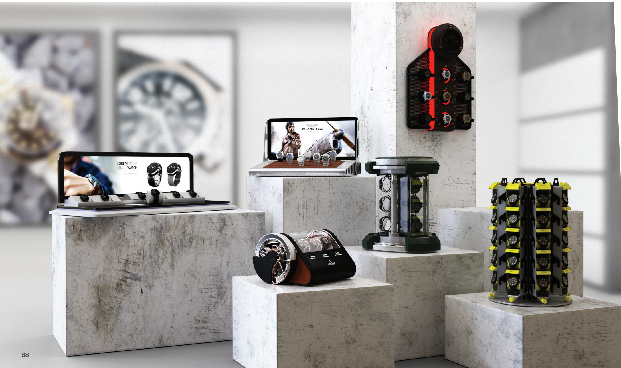
Watch displays - Multiple brands (3D render)