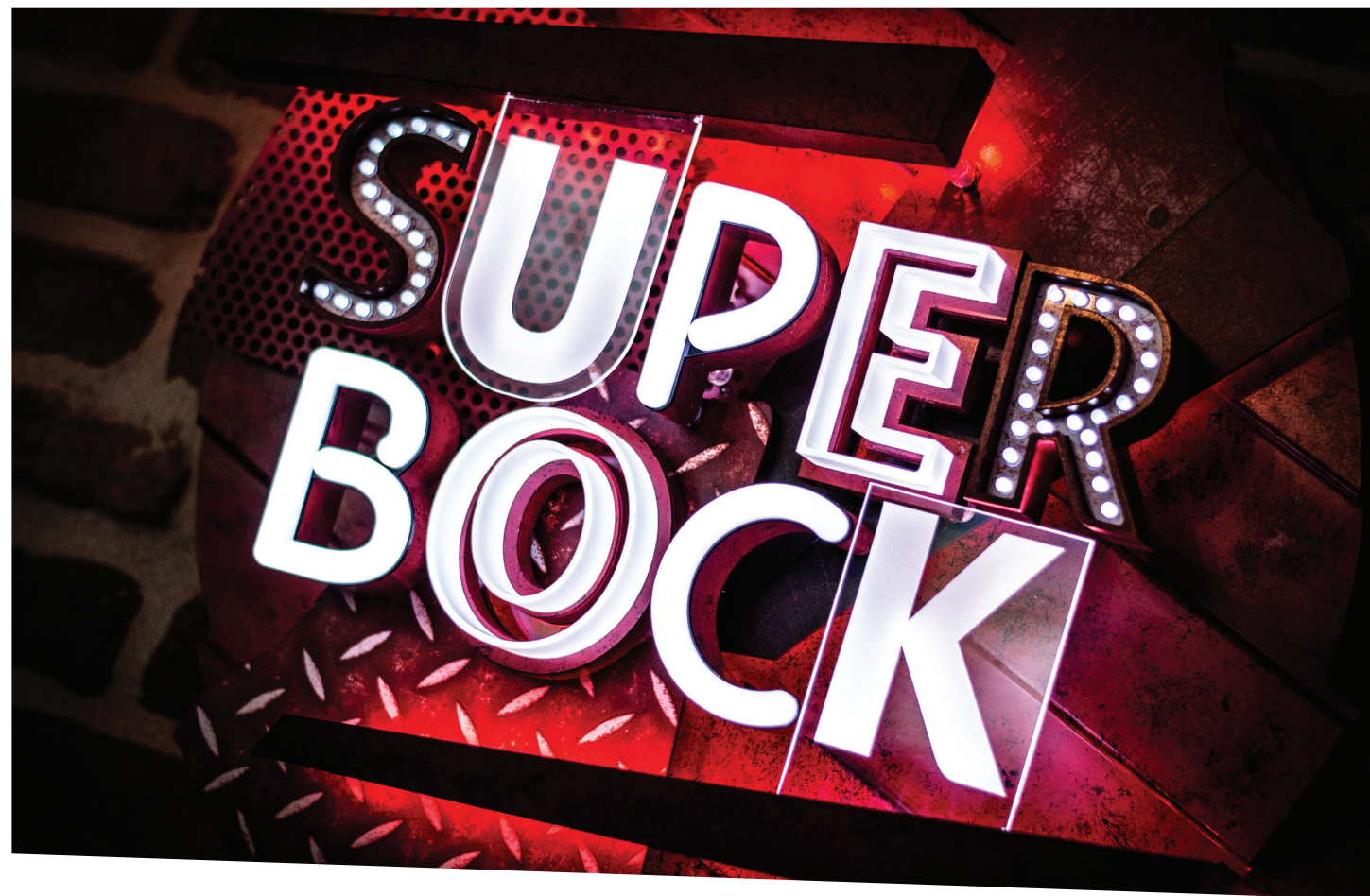
LEDSign - Superbock