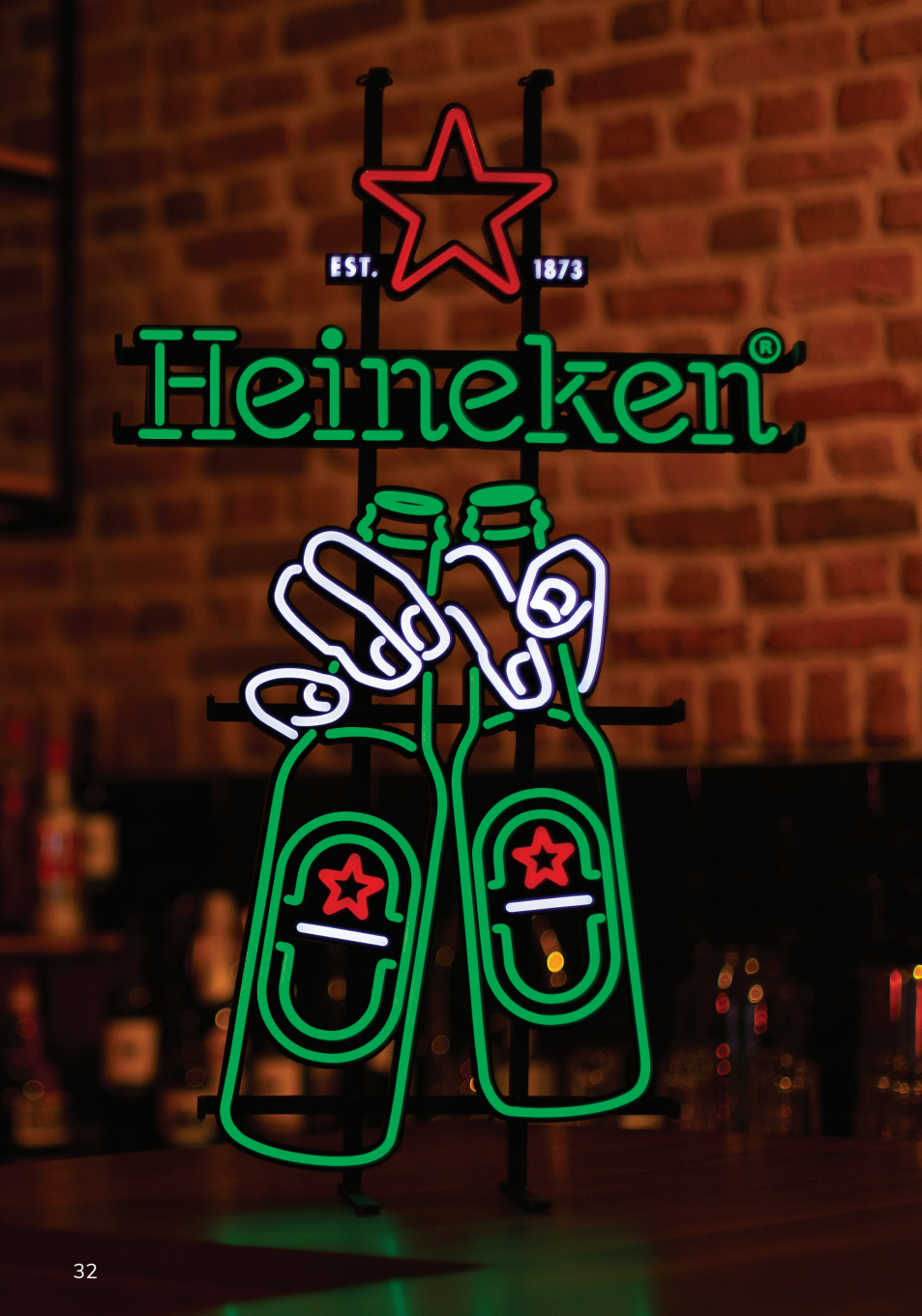
LEDNeon - Heineken