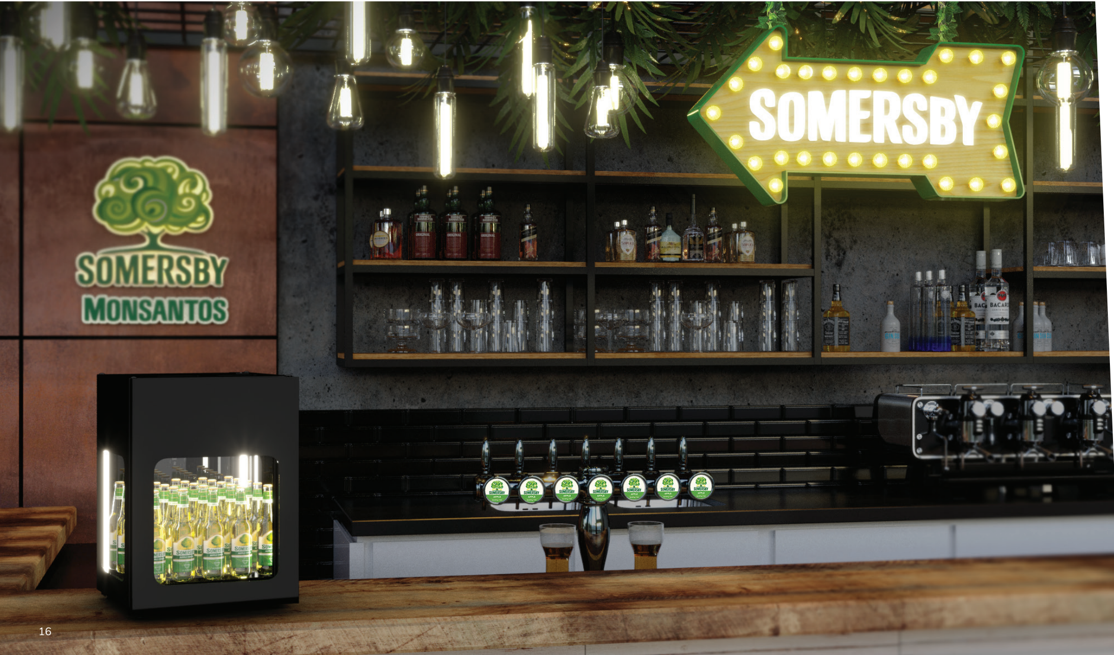
LEDSigns / B.360 fridge - Somersby (3D render)