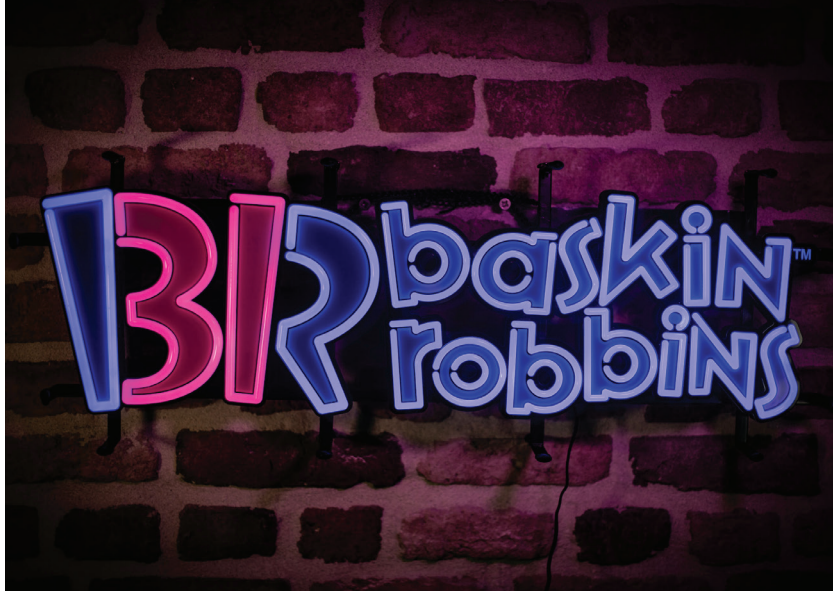
LEDNeon - Baskin Robbins