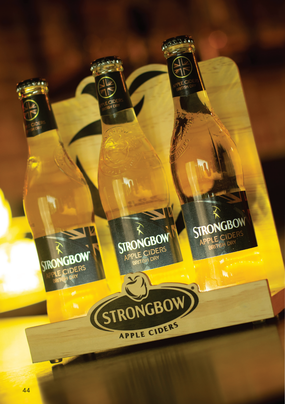
Bottle glorifier - Strongbow