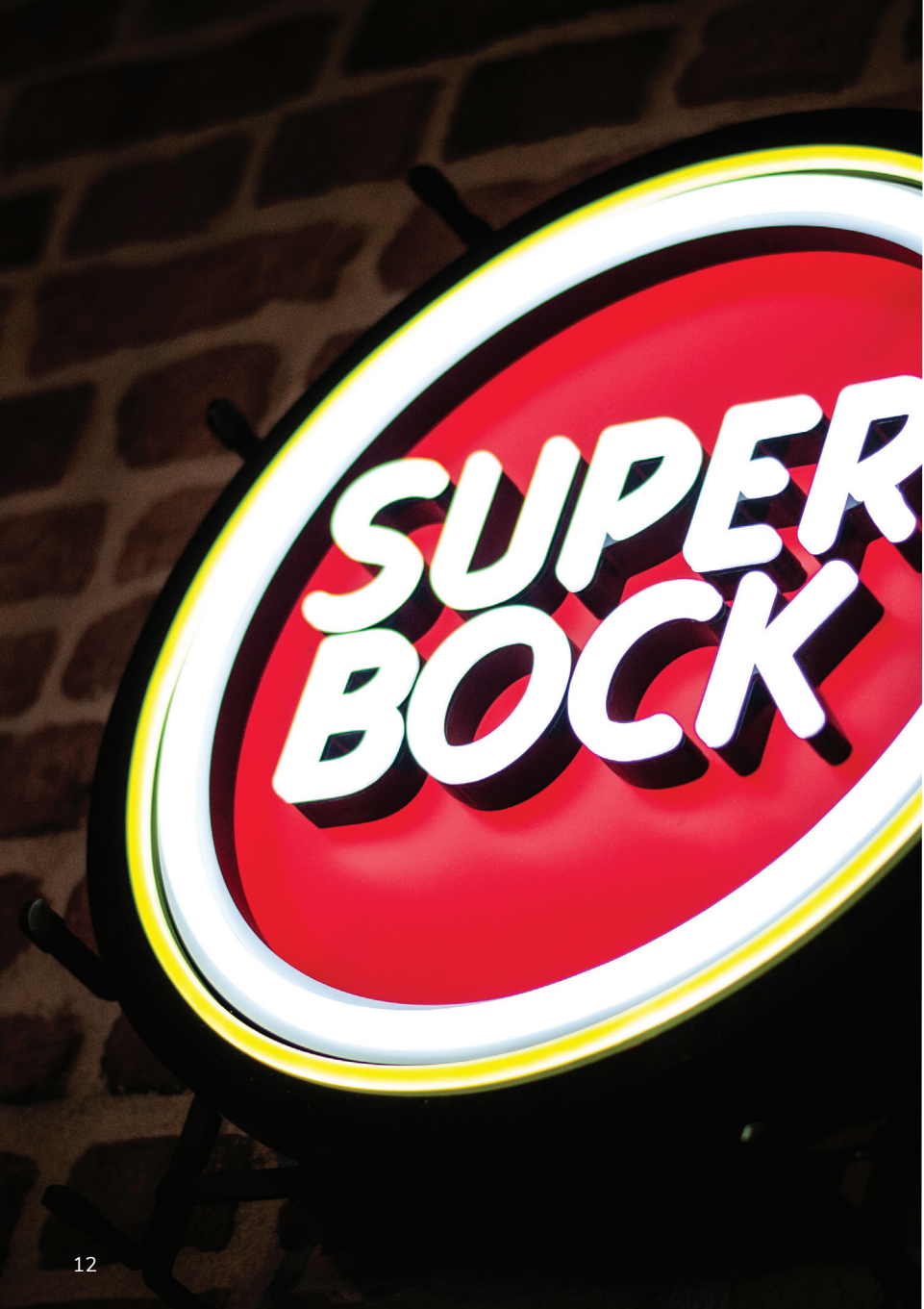
LEDNeon - Superbock