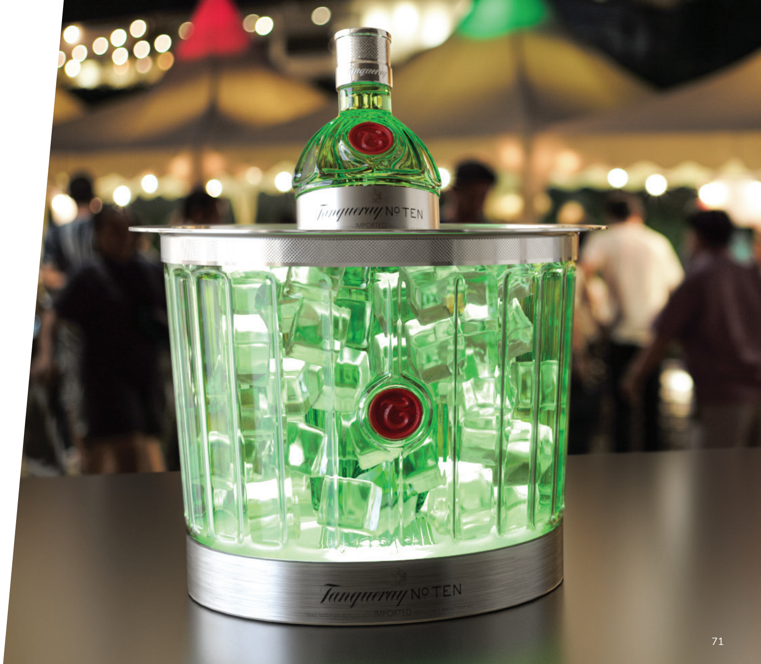
Ice bucket - Tanqueray