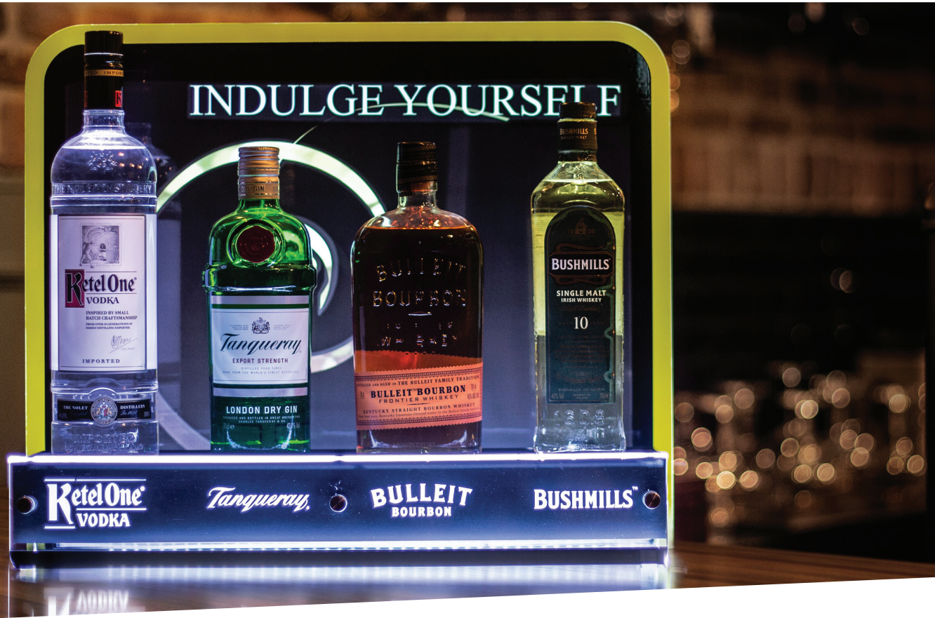
Bottle glorifier - Ketel One / Tanqueray / Bulleit / Bushmills