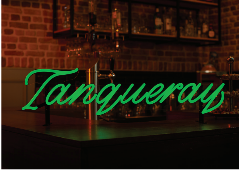
LEDNeon - Tanqueray