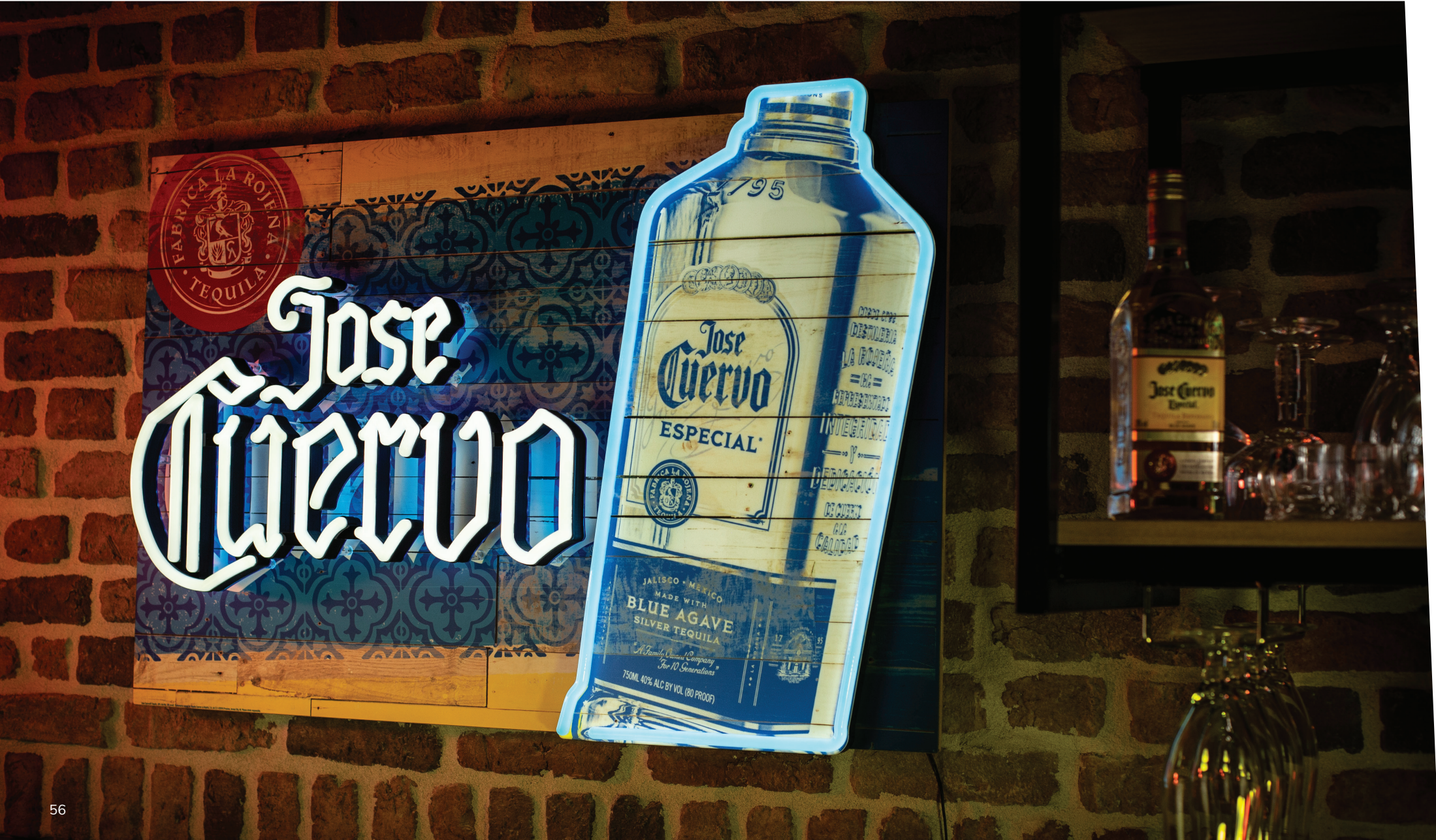
LEDSign - Jose Cuervo