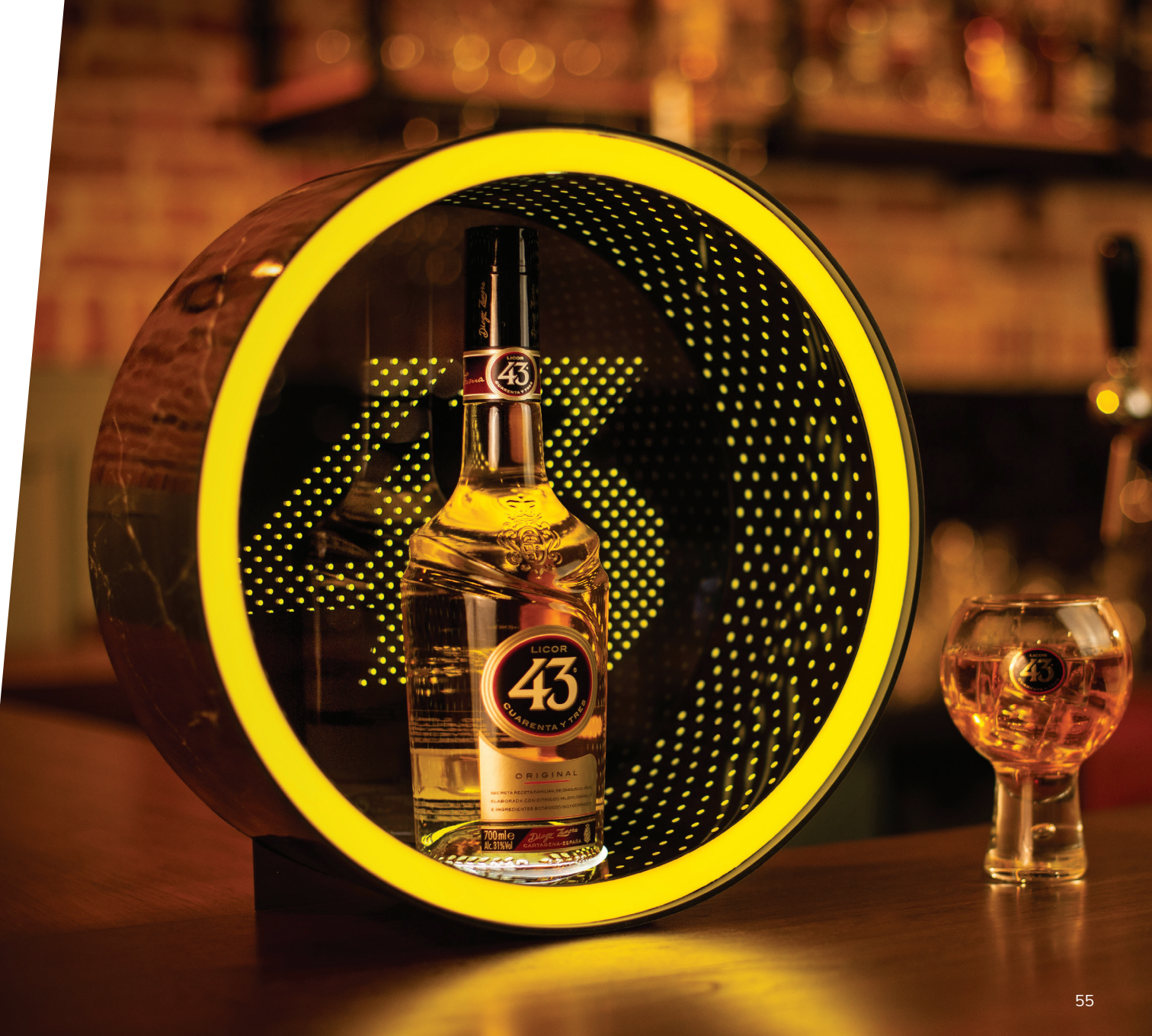
Bottle glorifier - Licor 43