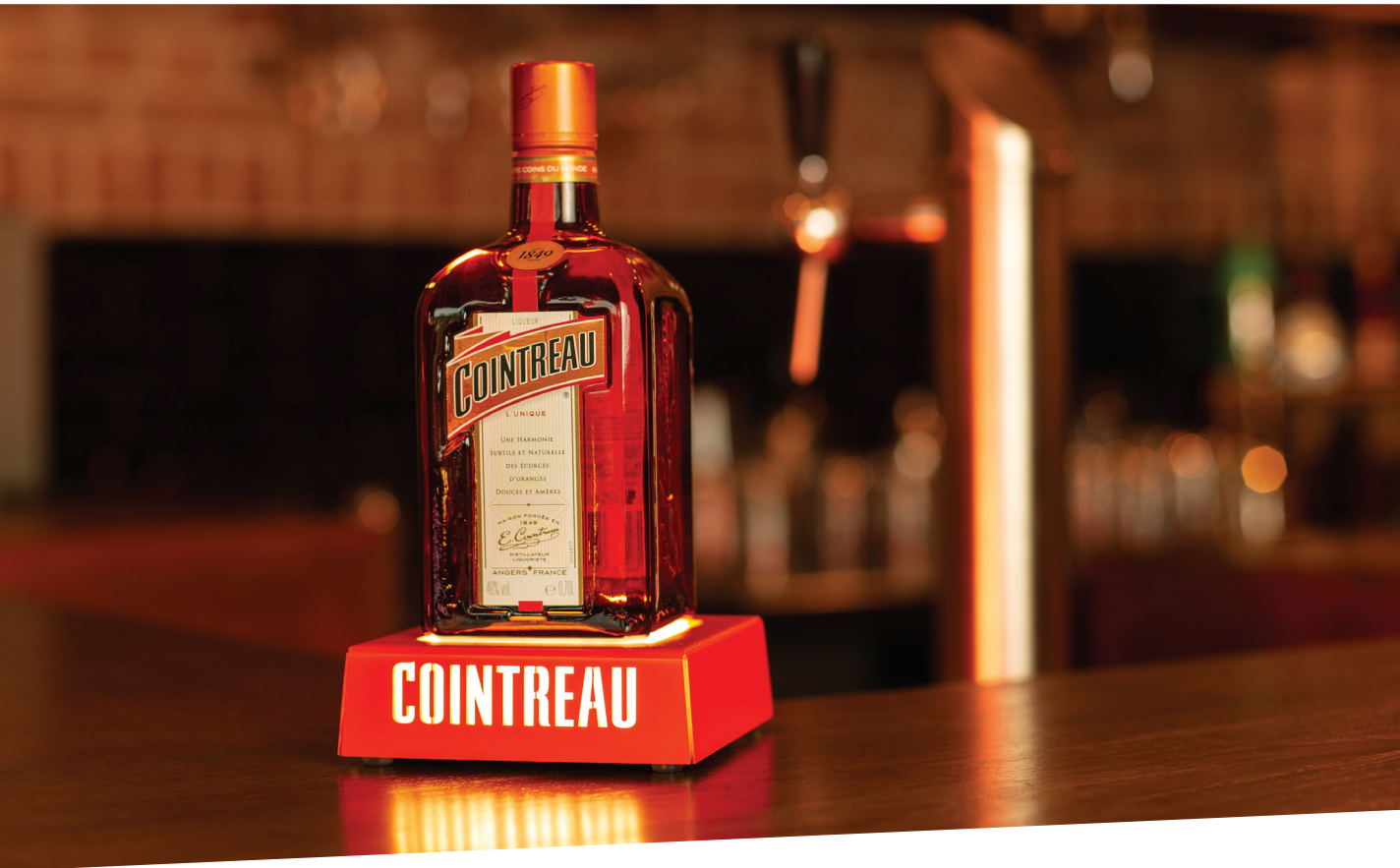
Bottle glorifier - Cointreau