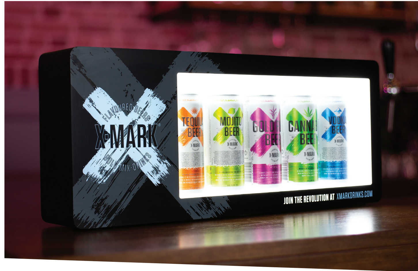
Bottle glorifier - X-Mark