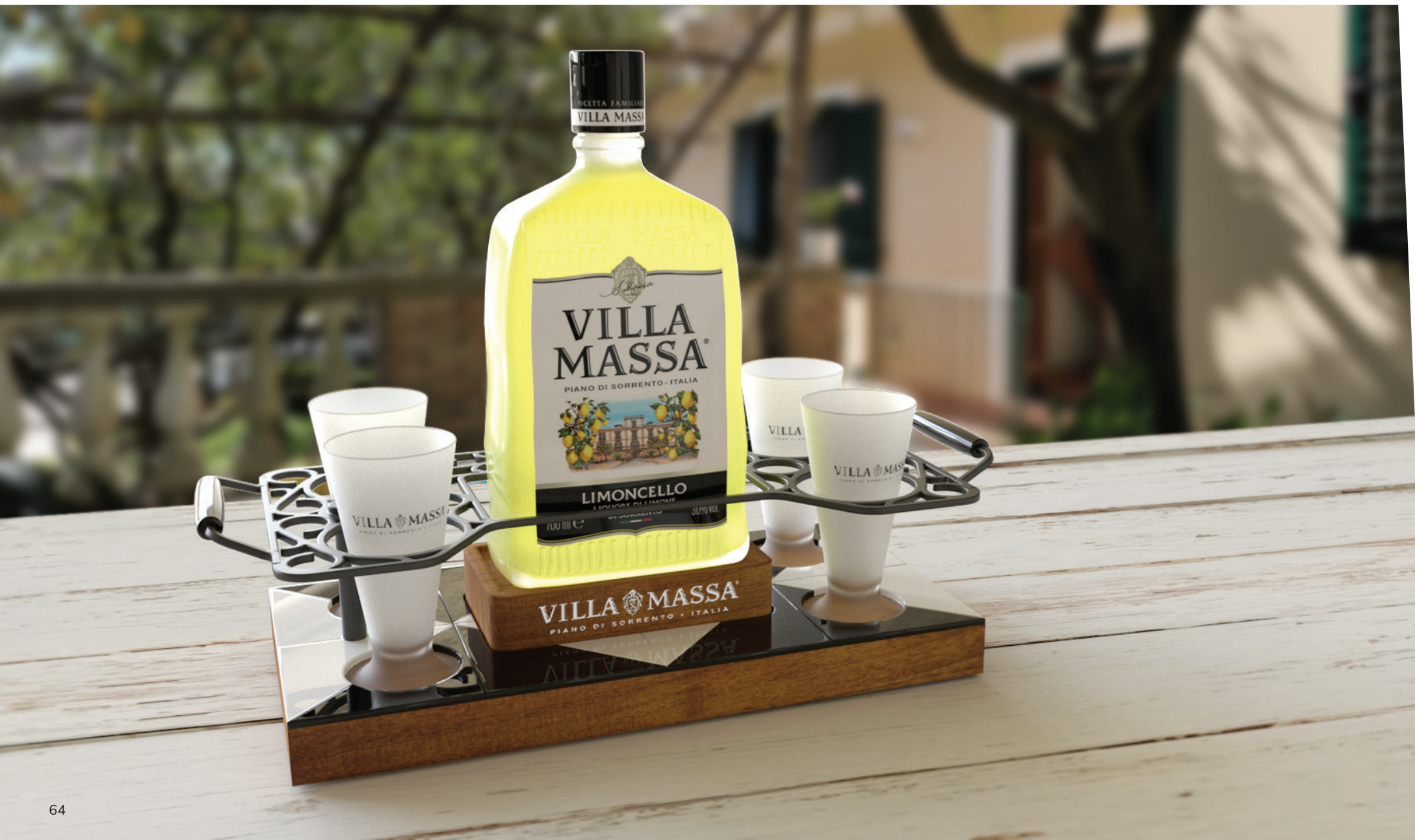
Serving tray - Villa Massa (3D render)