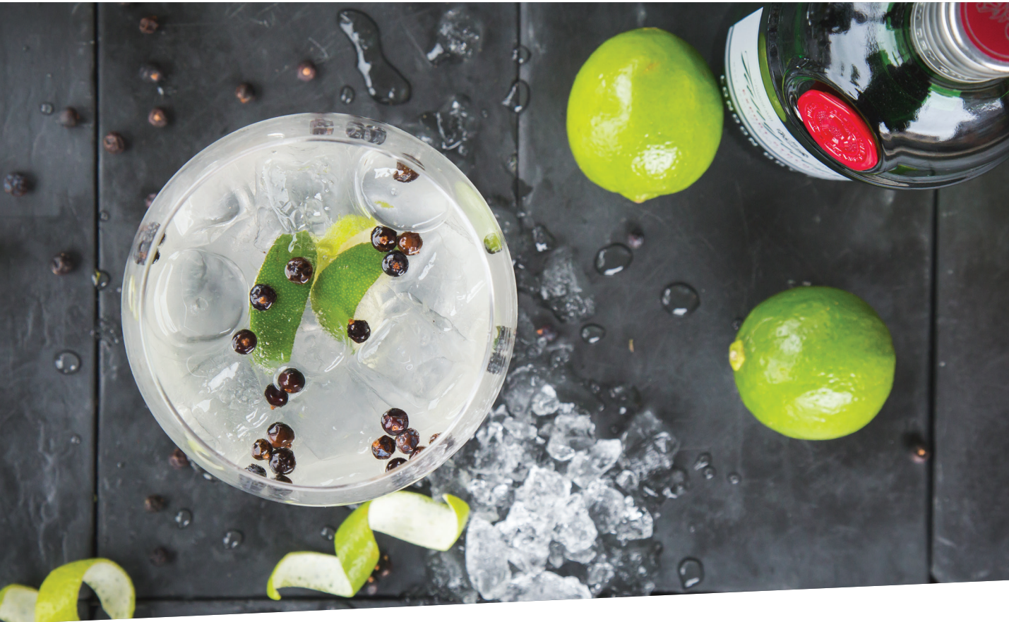
Bottle glorifier - Tanqueray