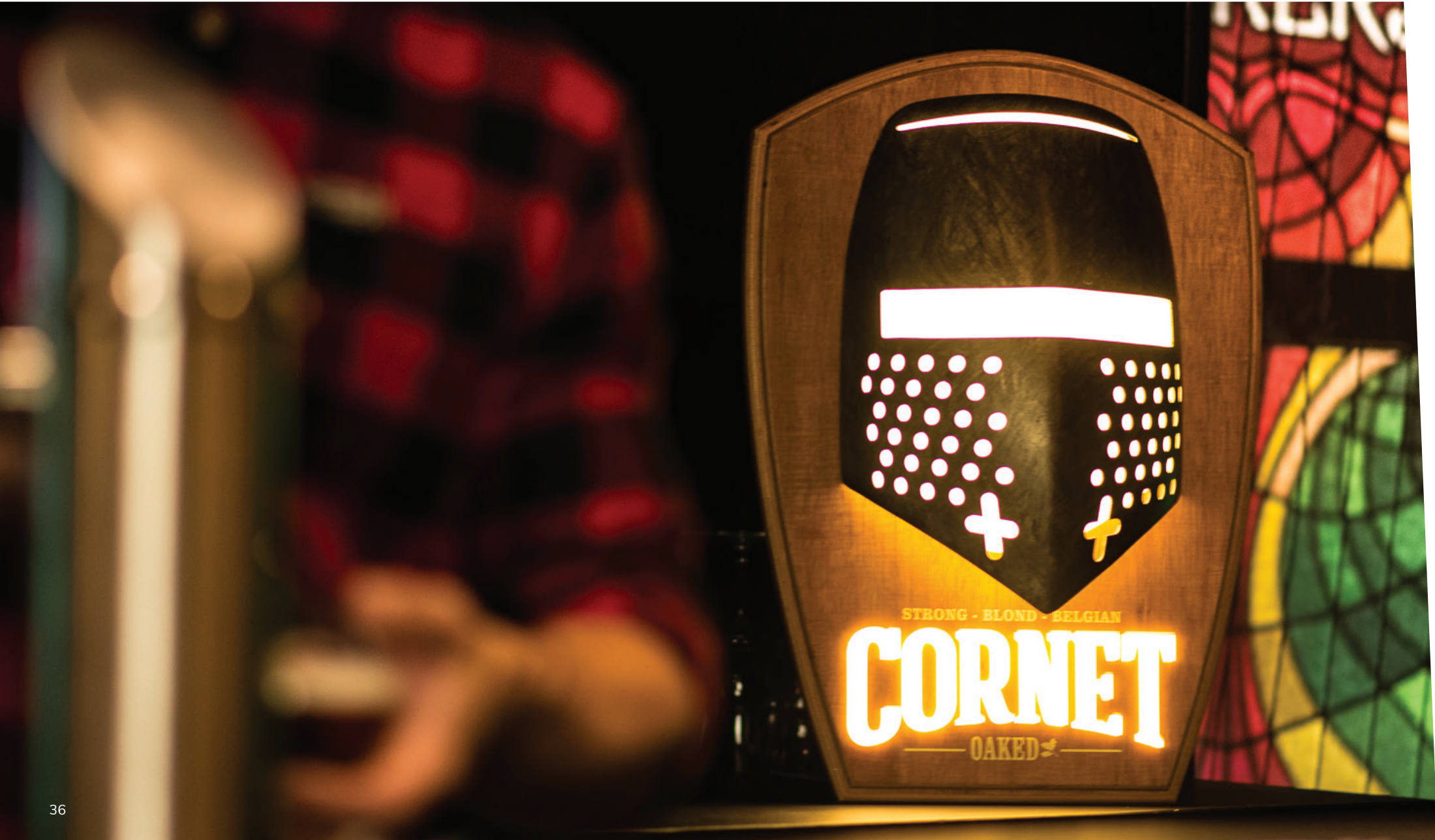
LEDSign - Cornet