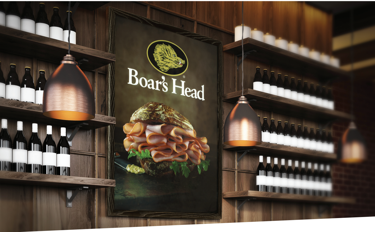
Wall LEDSign - Boar's Head