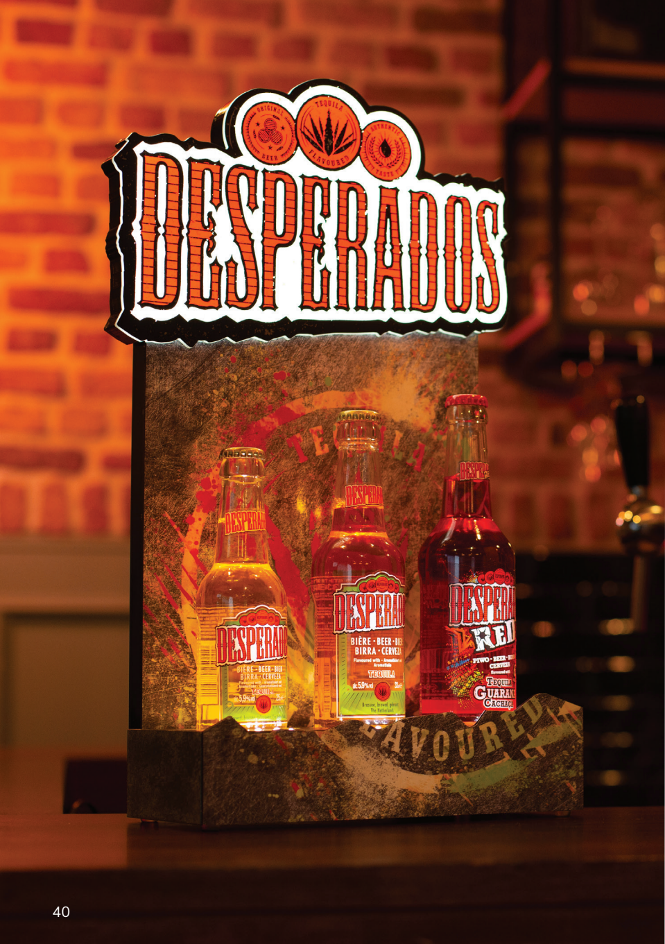
Bottle glorifier - Desperados