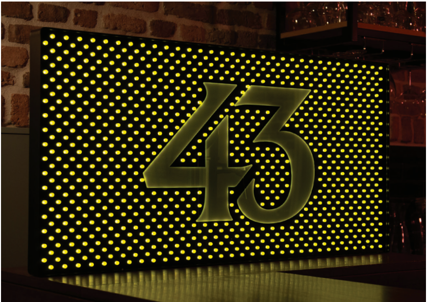
LEDSign - Licor 43