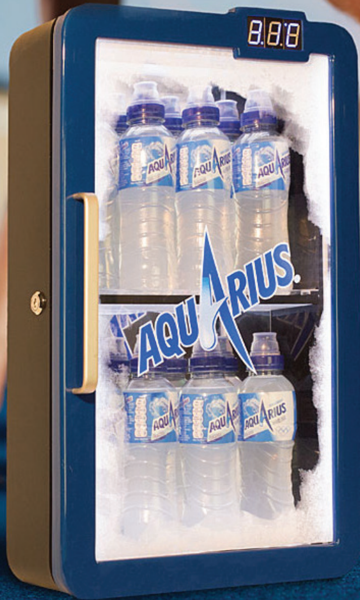
Fridge - Aquarius