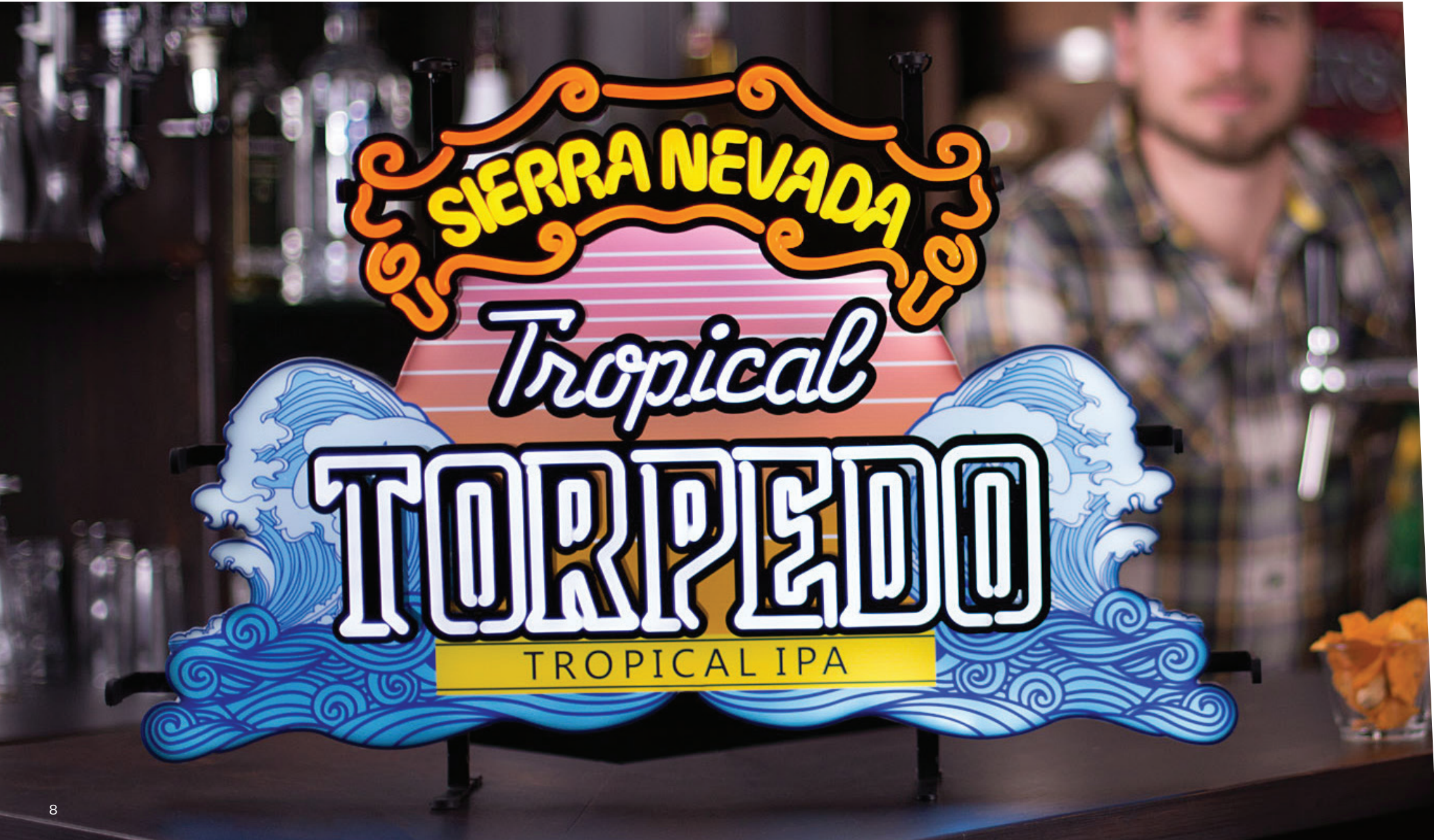
LEDSign - Sierra Nevada