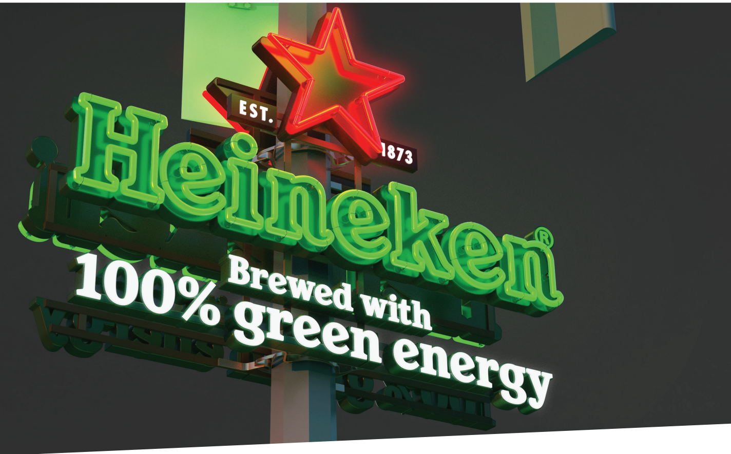
Outdoor LEDNeon - Heineken (3D render)