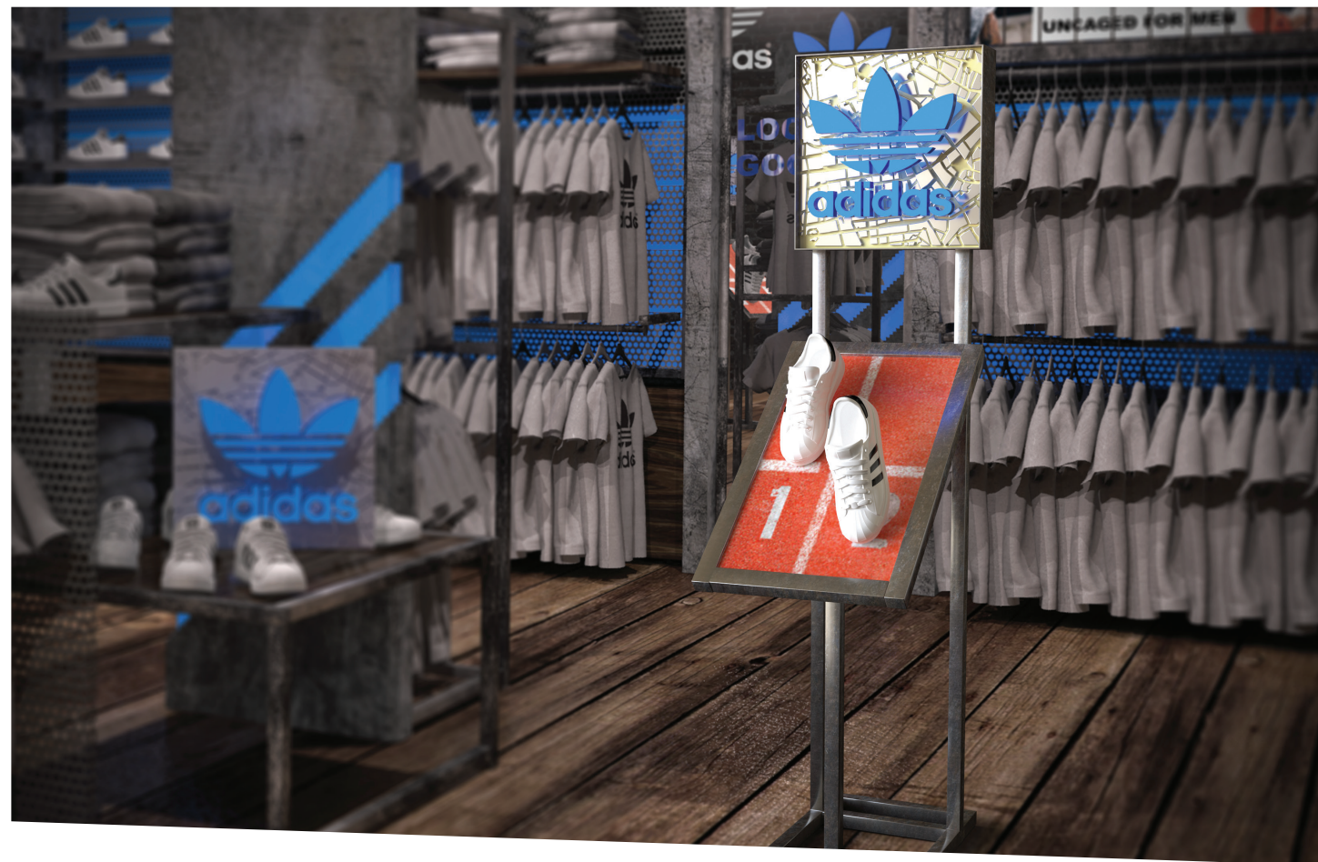
Shop display - Adidas (3D render)