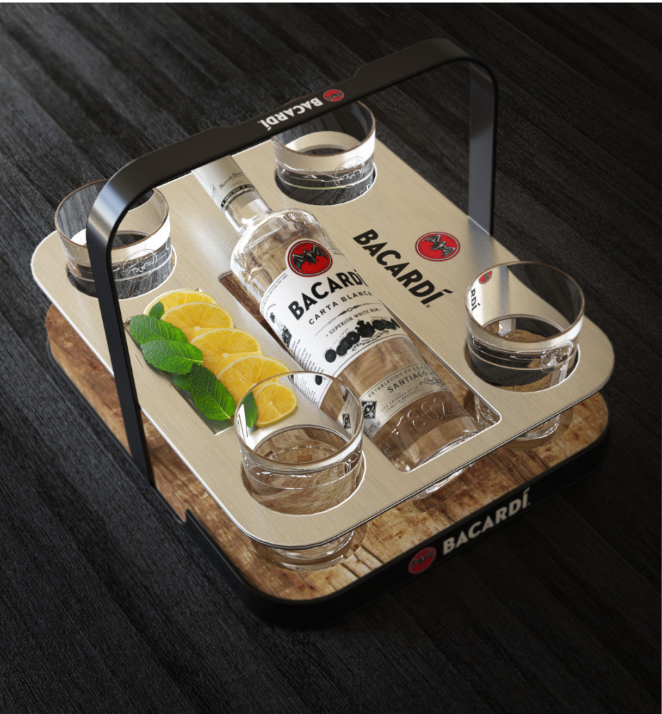
Serving tray - Bacardi