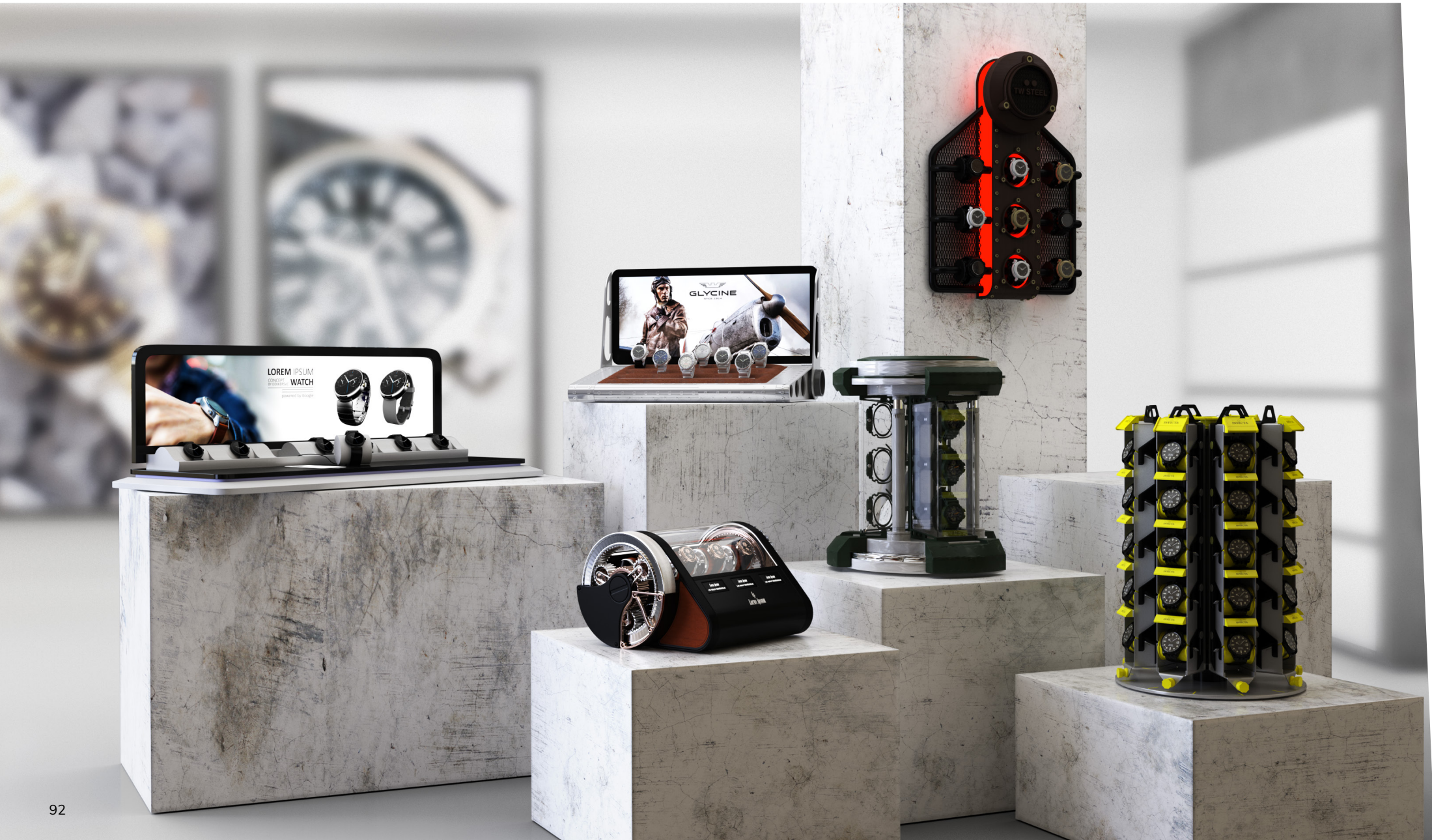
Watch displays - Multiple brands (3D render)