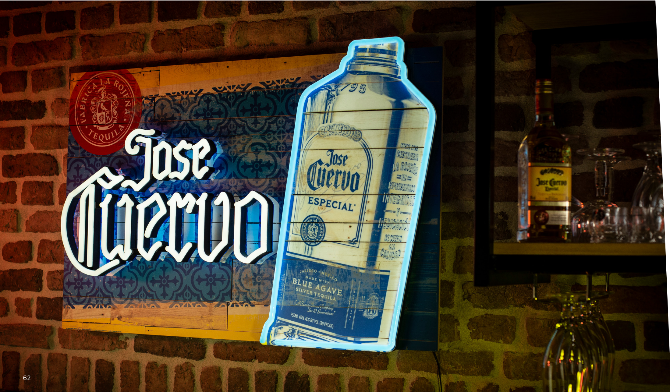
LEDSign - Jose Cuervo