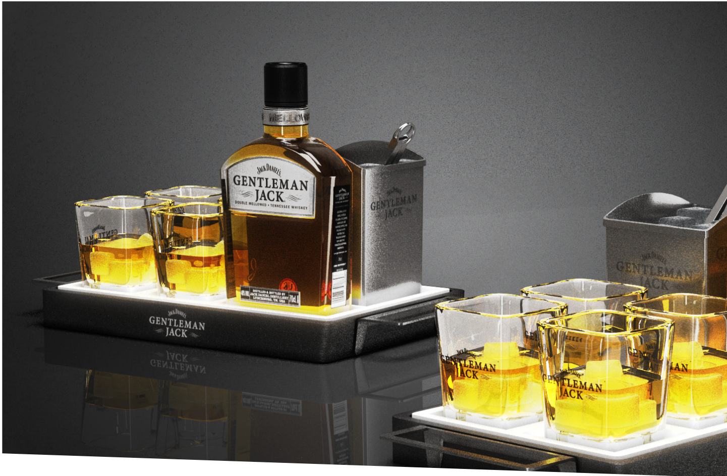
Serving tray - Gentleman Jack (3D render)