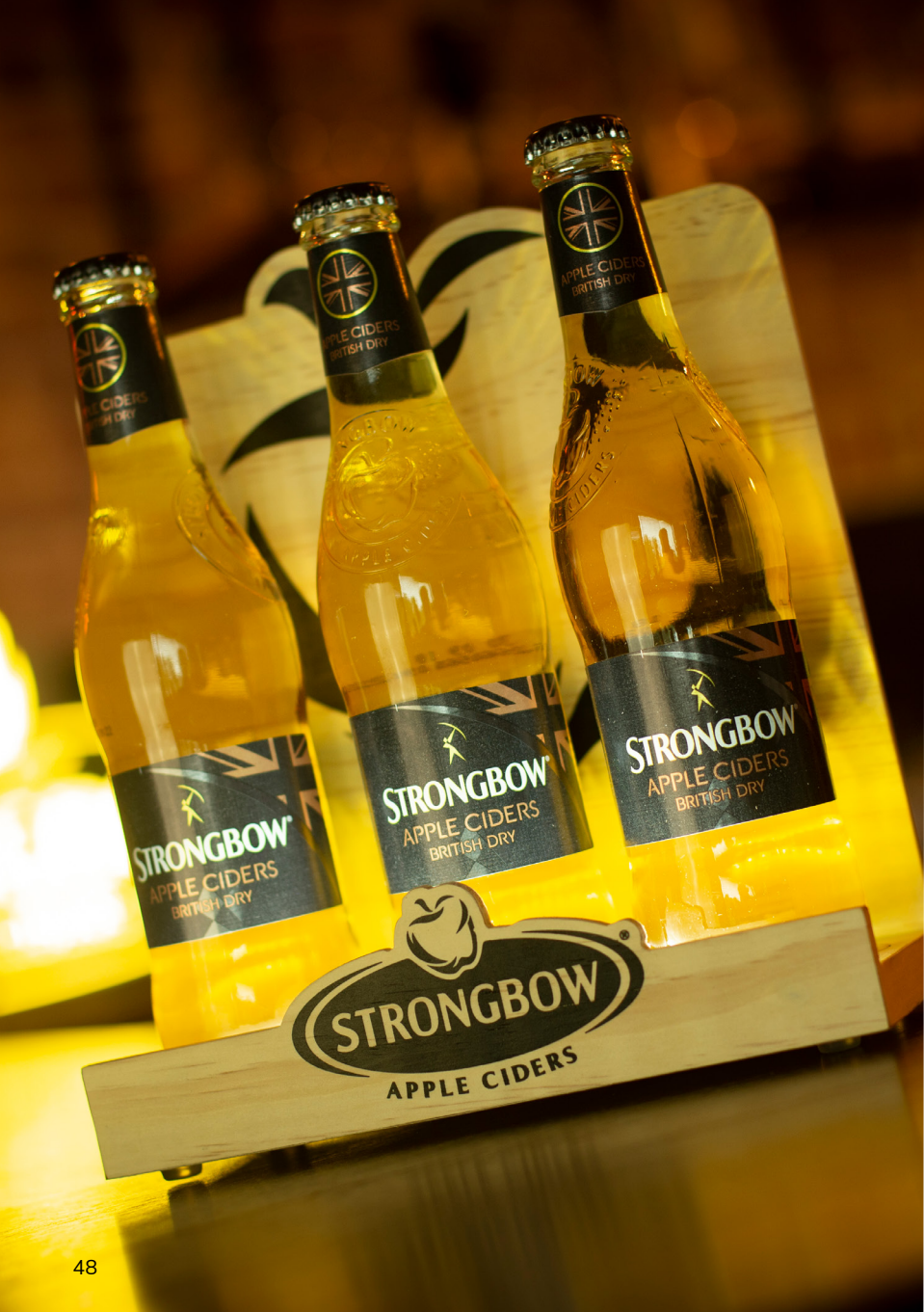
Bottle glorifier - Strongbow