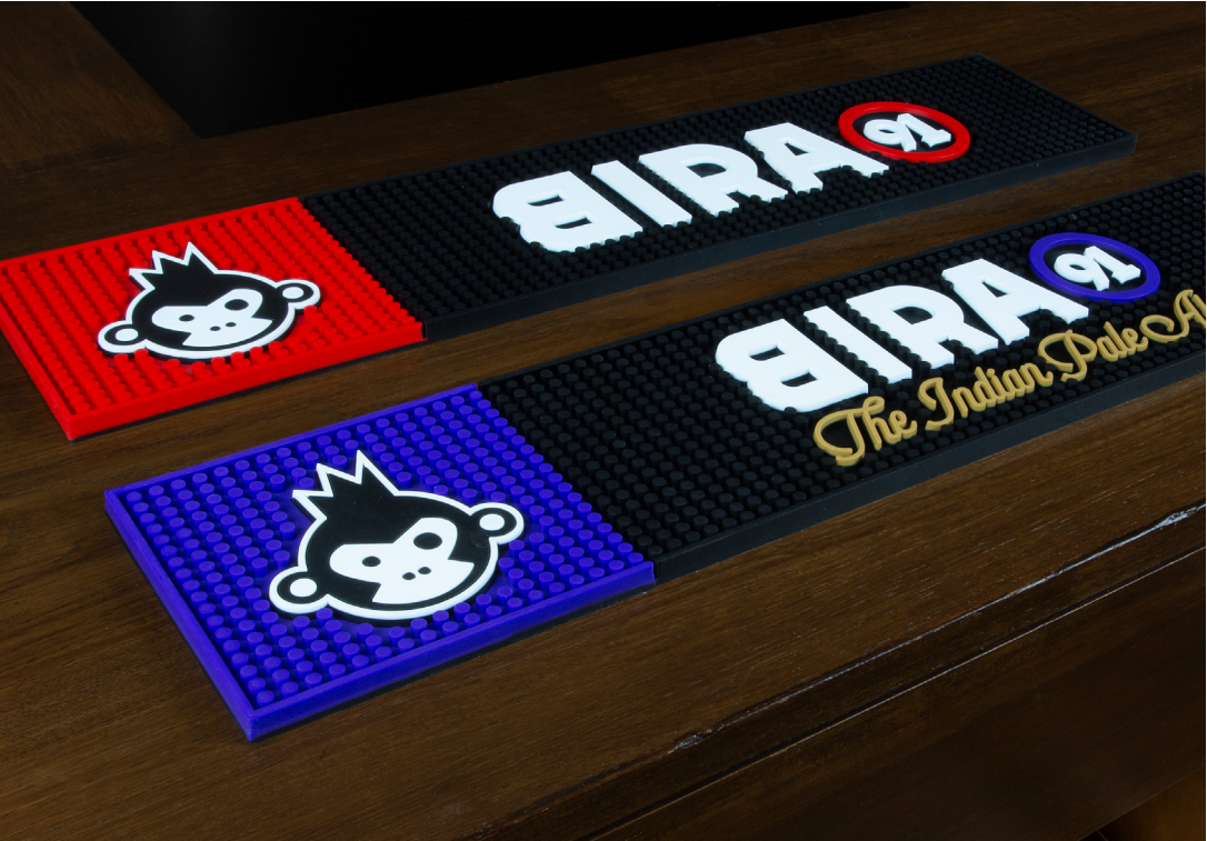
Barrunner - Bira91