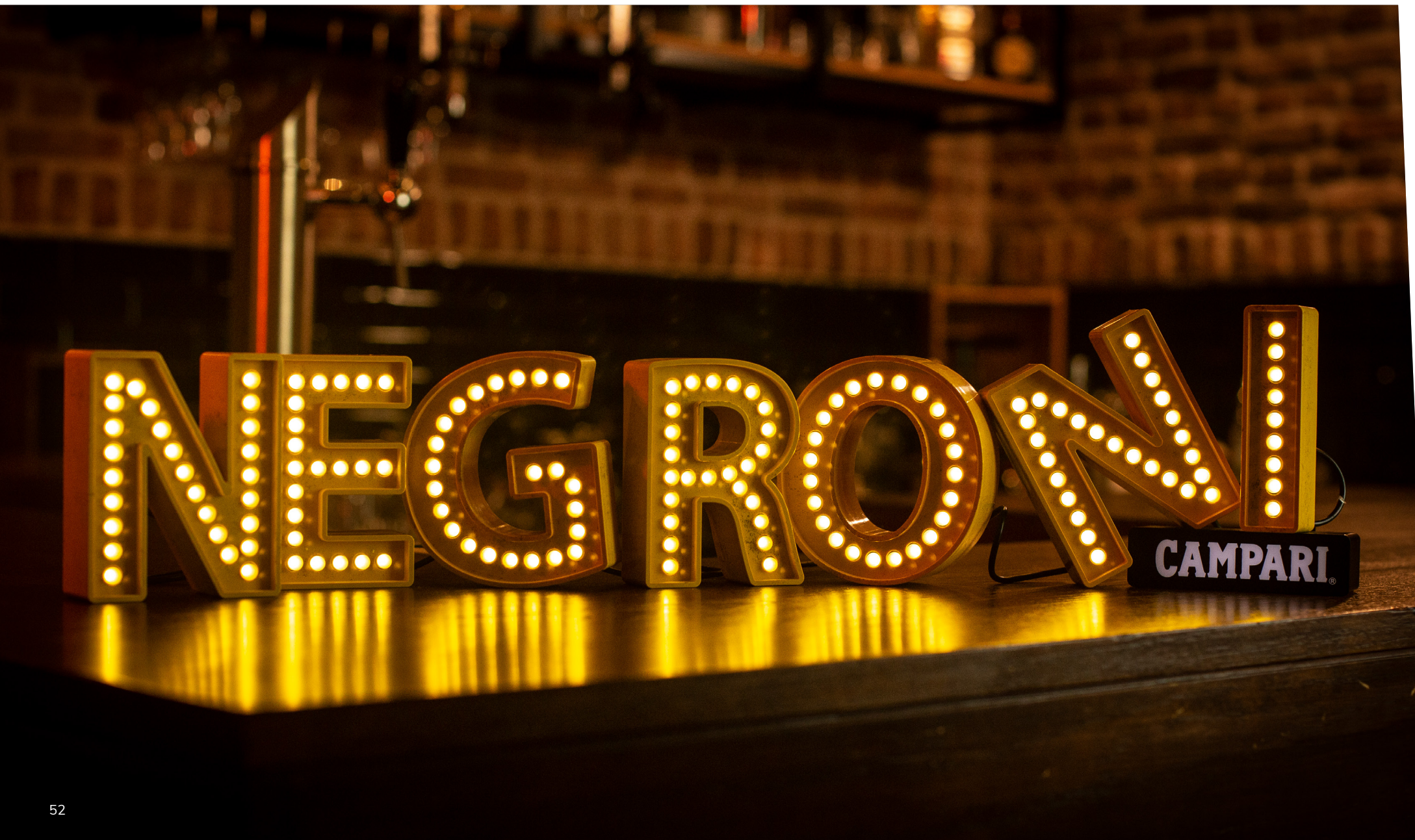
LEDSign - Negroni