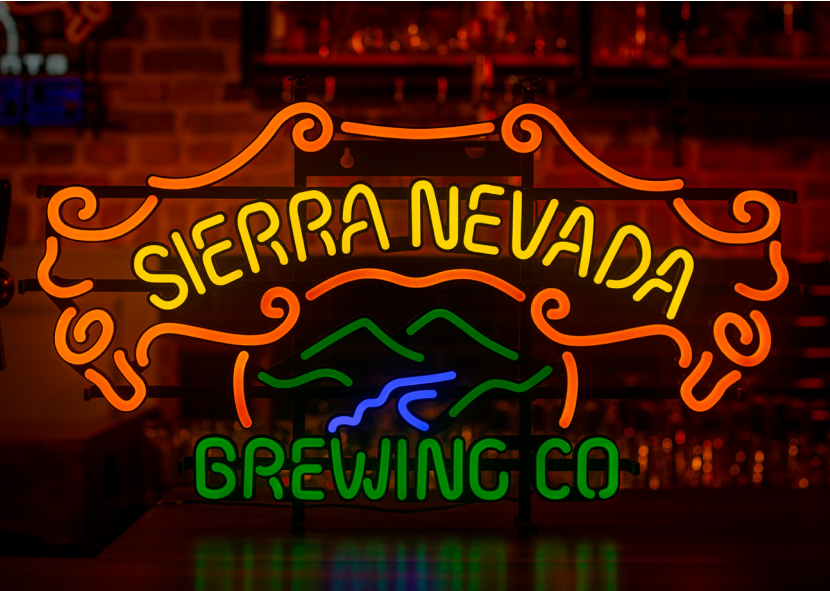
LEDNeon - Sierra Nevada