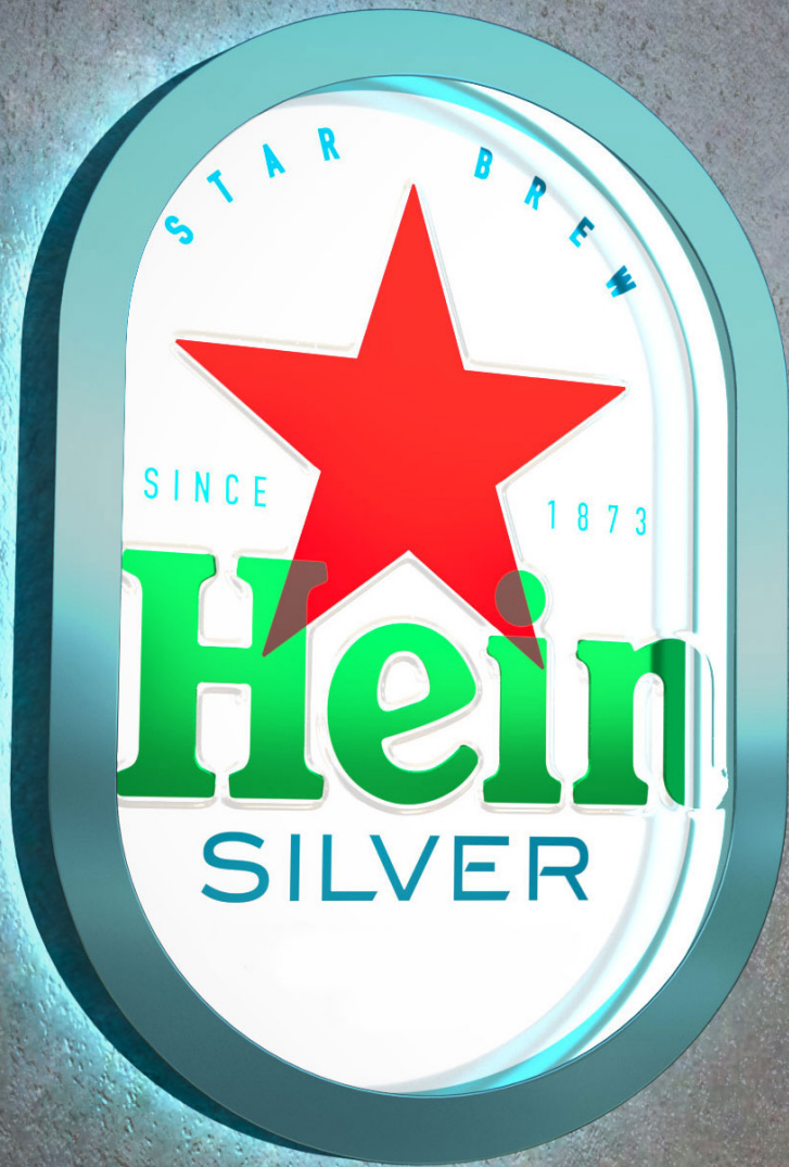
LEDSign - Heineken Silver