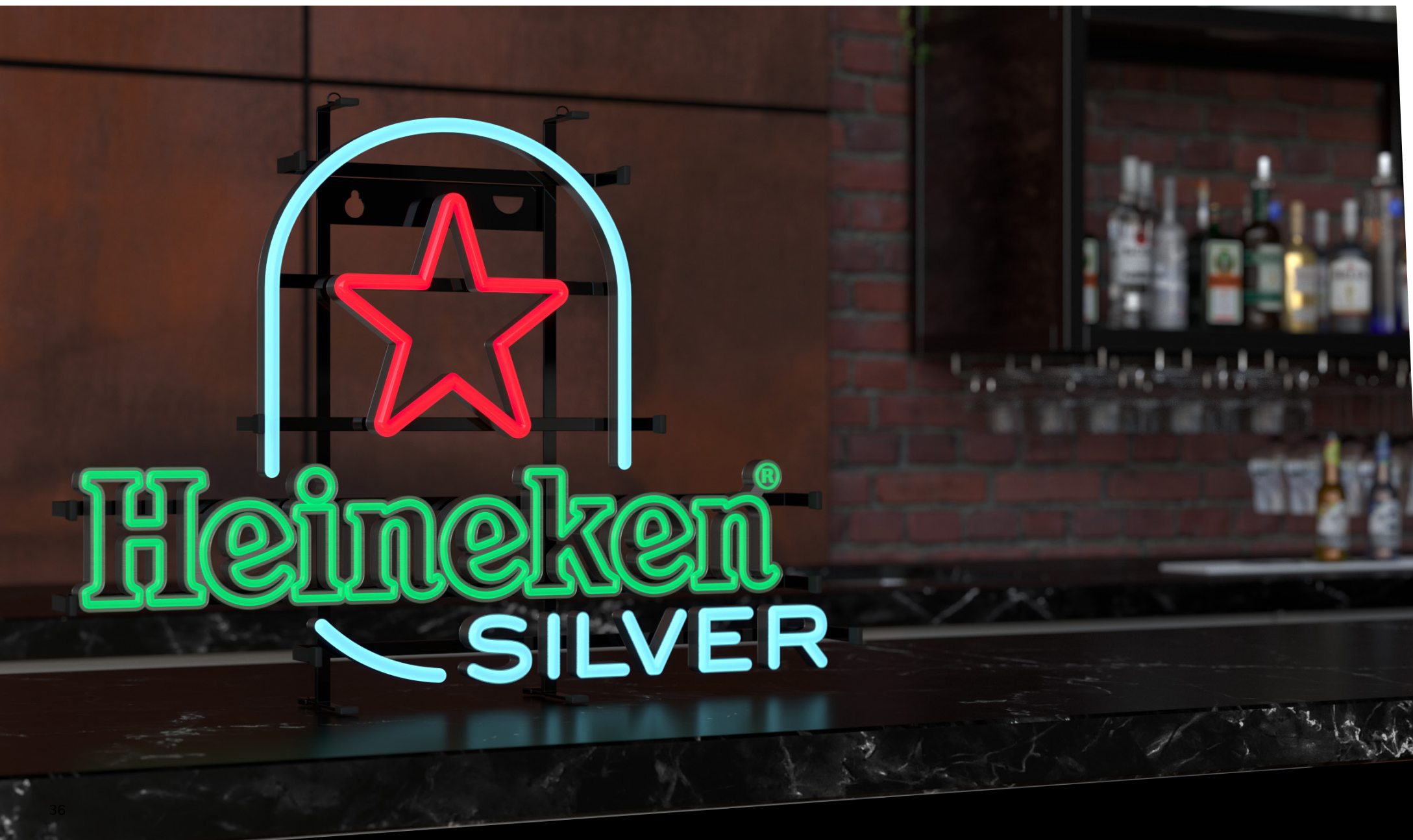
LEDNeon - Heineken Silver