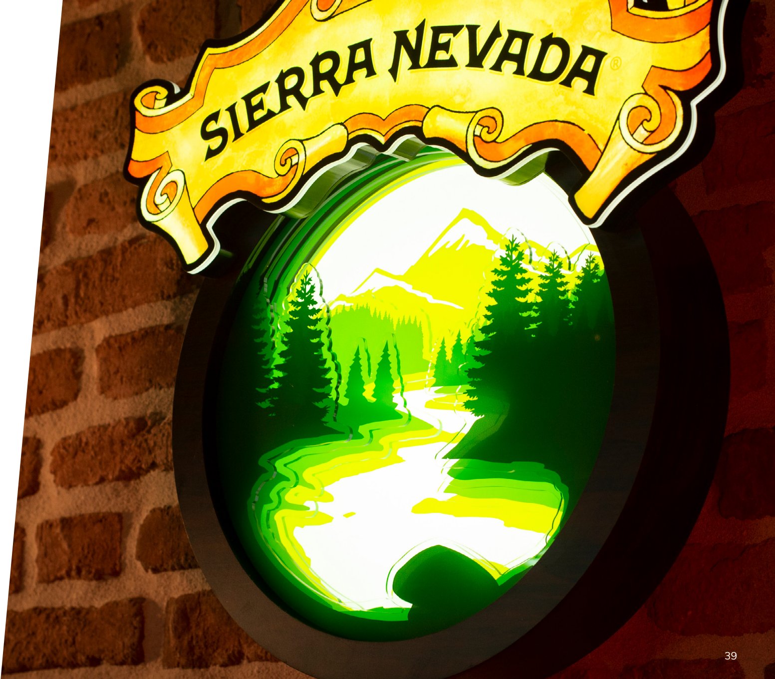
LEDSign - Sierra Nevada