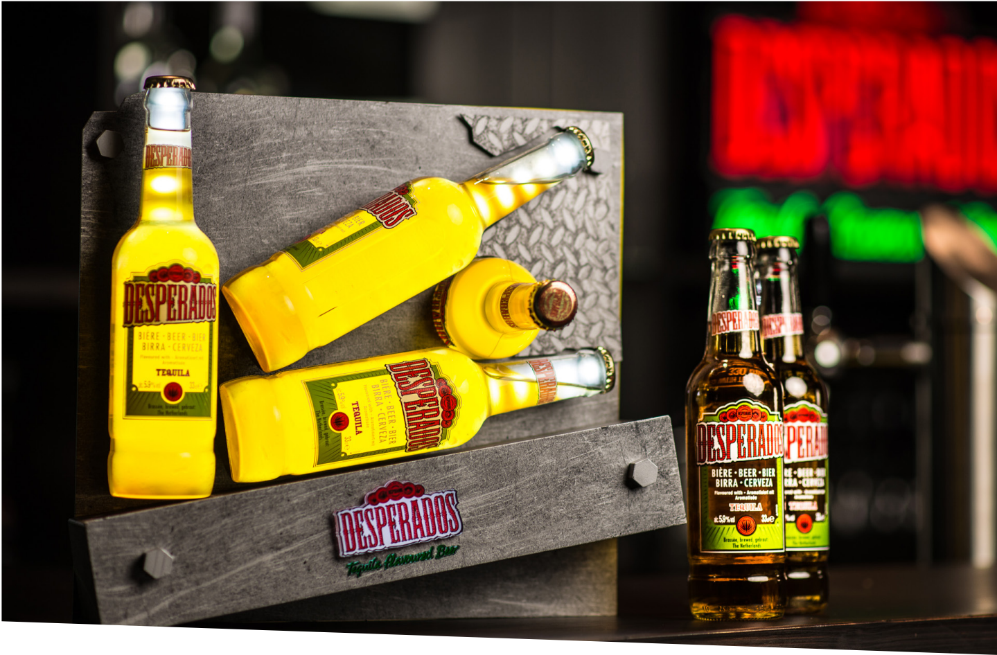
Bottle glorifier - Desperados