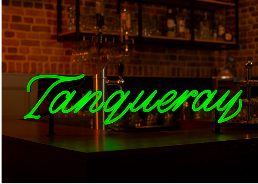
LEDNeon - Tanqueray