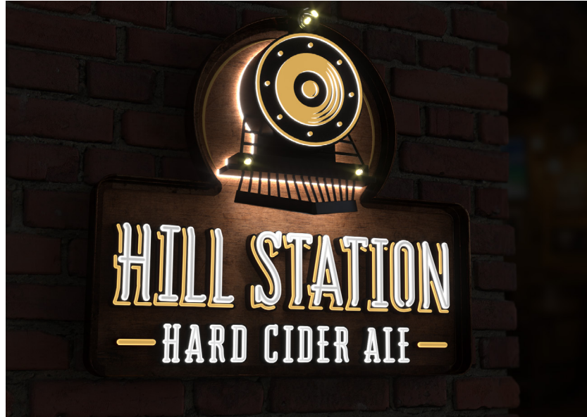
LED Sign - Hill Station