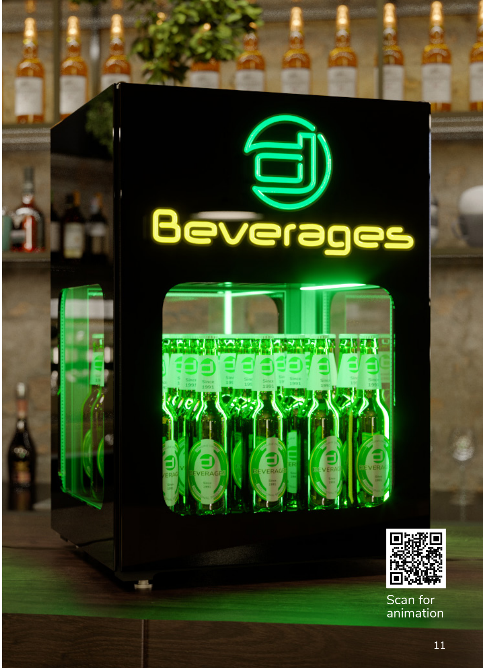
B.360 fridge - Dekkers Beverages