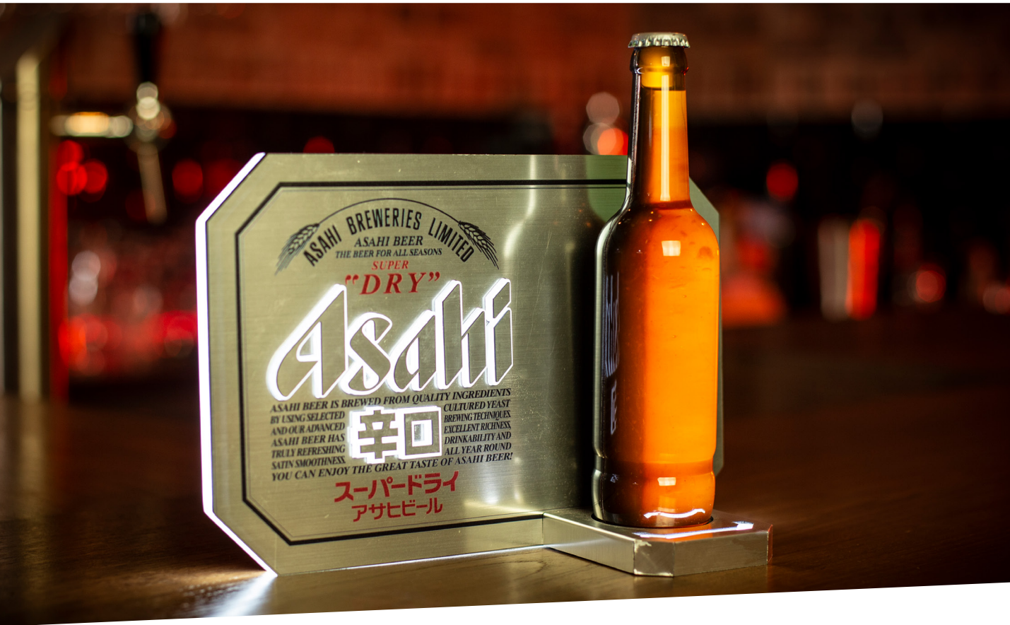
Bottle glorifier - Asahi