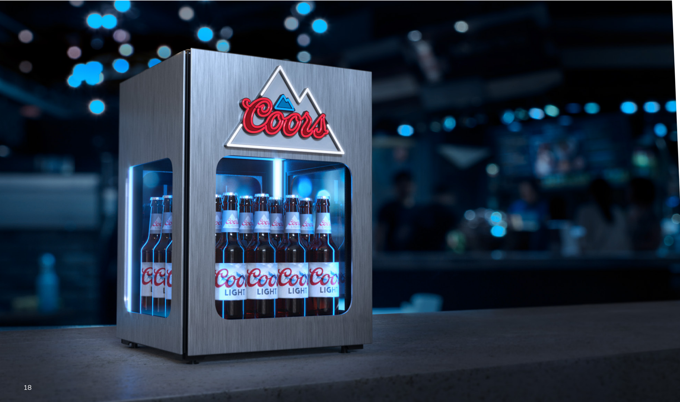
B.360 fridge - Coors (3D render)