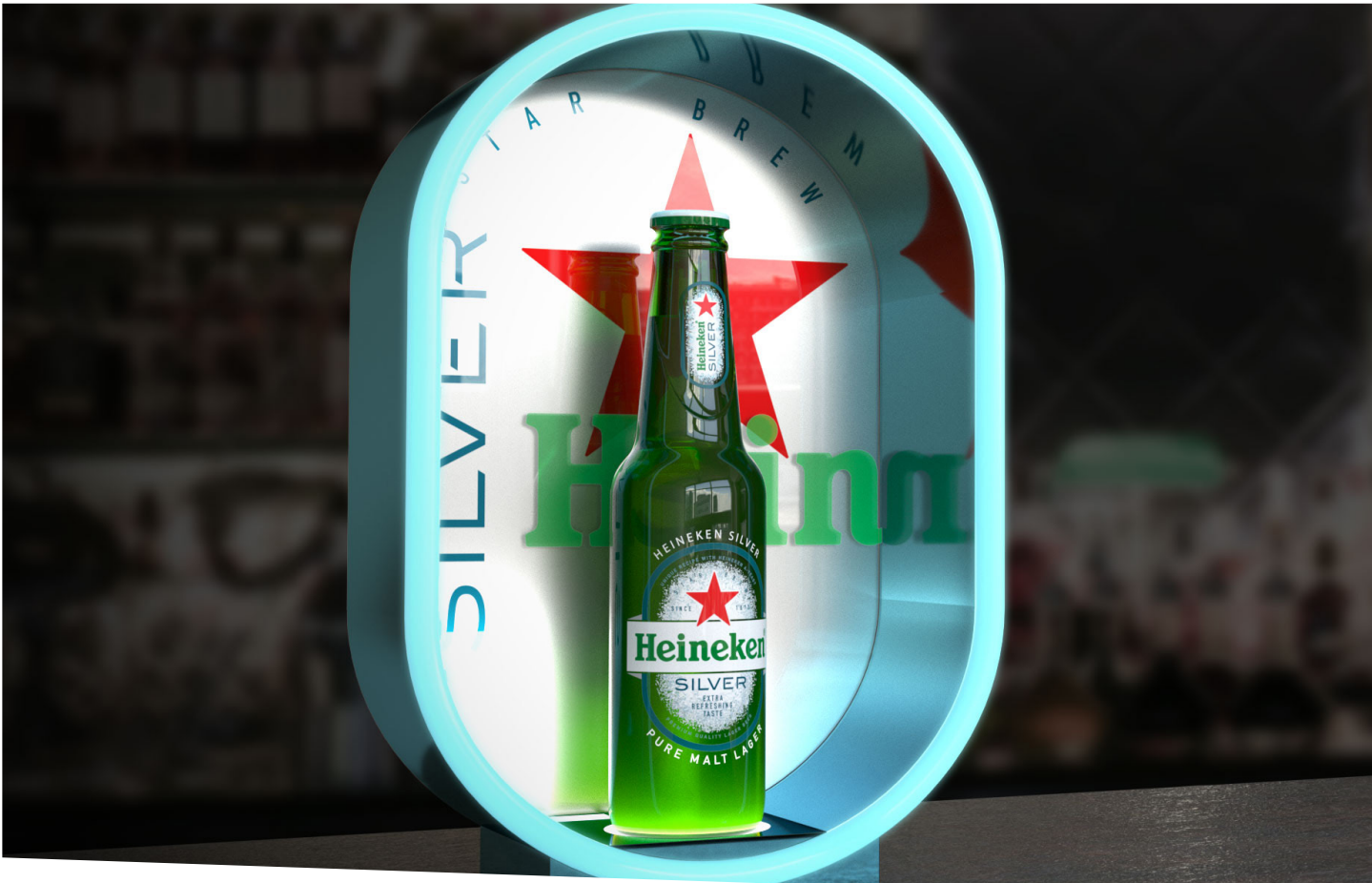
Bottle glorifier - Heineken Silver