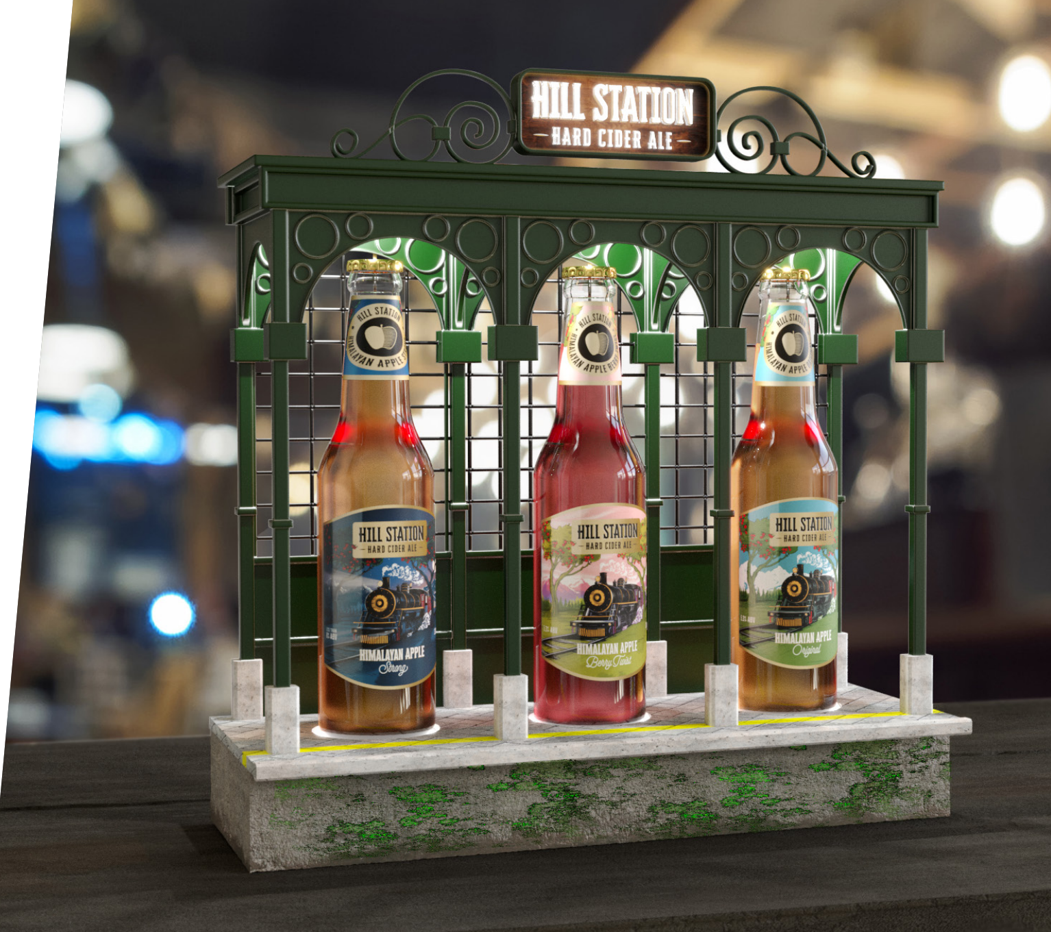
Bottle glorifier - Hill Station