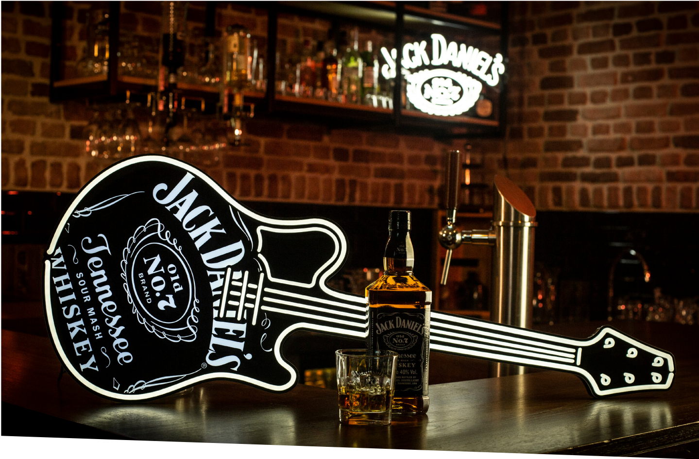
LEDNeon - Jack Daniels