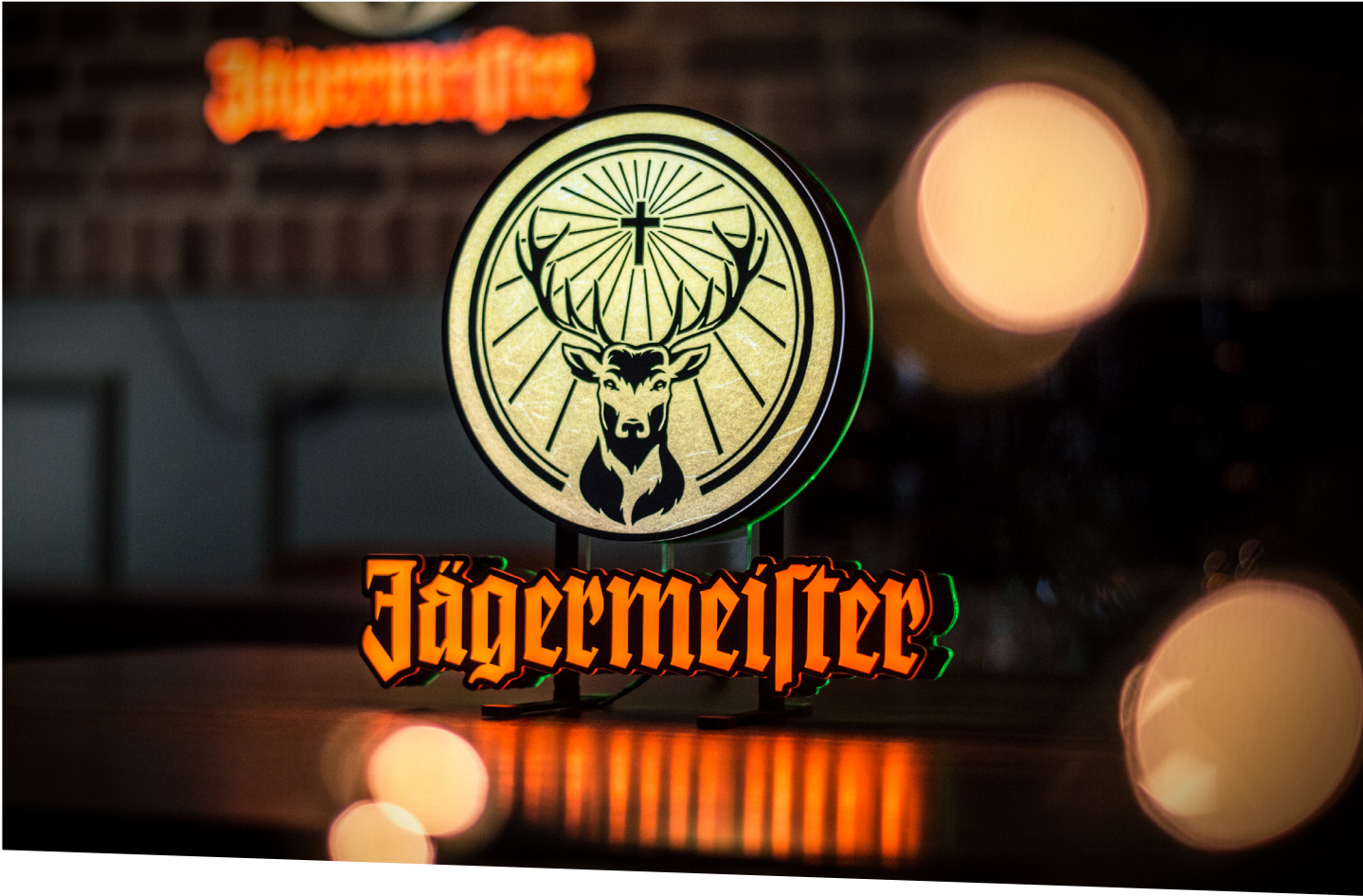
LEDSign - Jägermeister