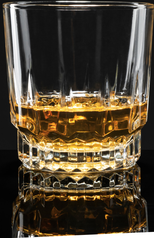
LEDsign - Jack Daniels