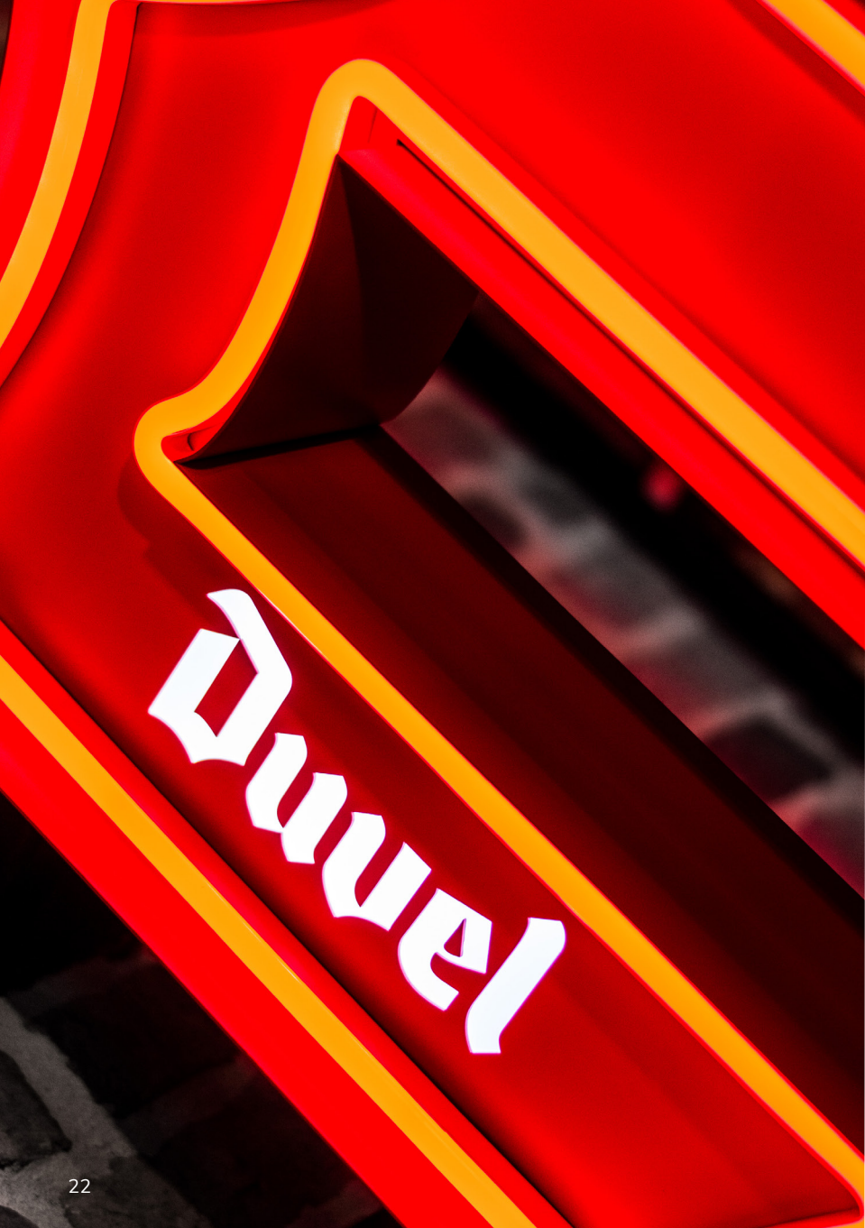
LEDNeon - Duvel