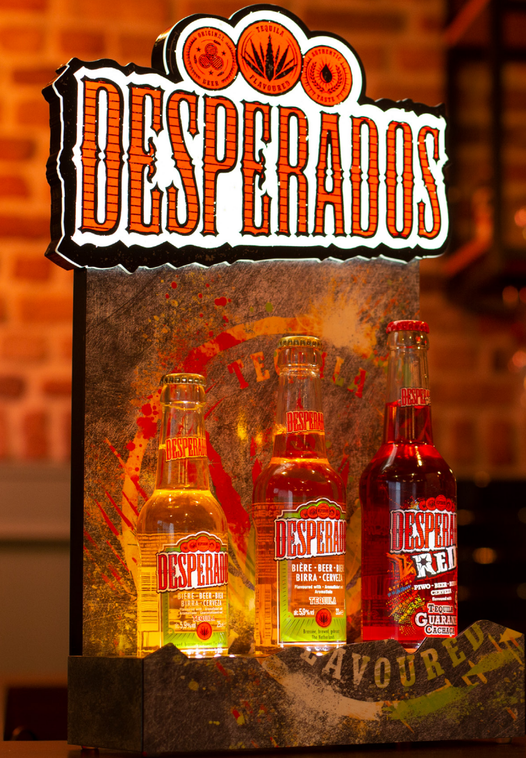
Bottle glorifier - Desperados