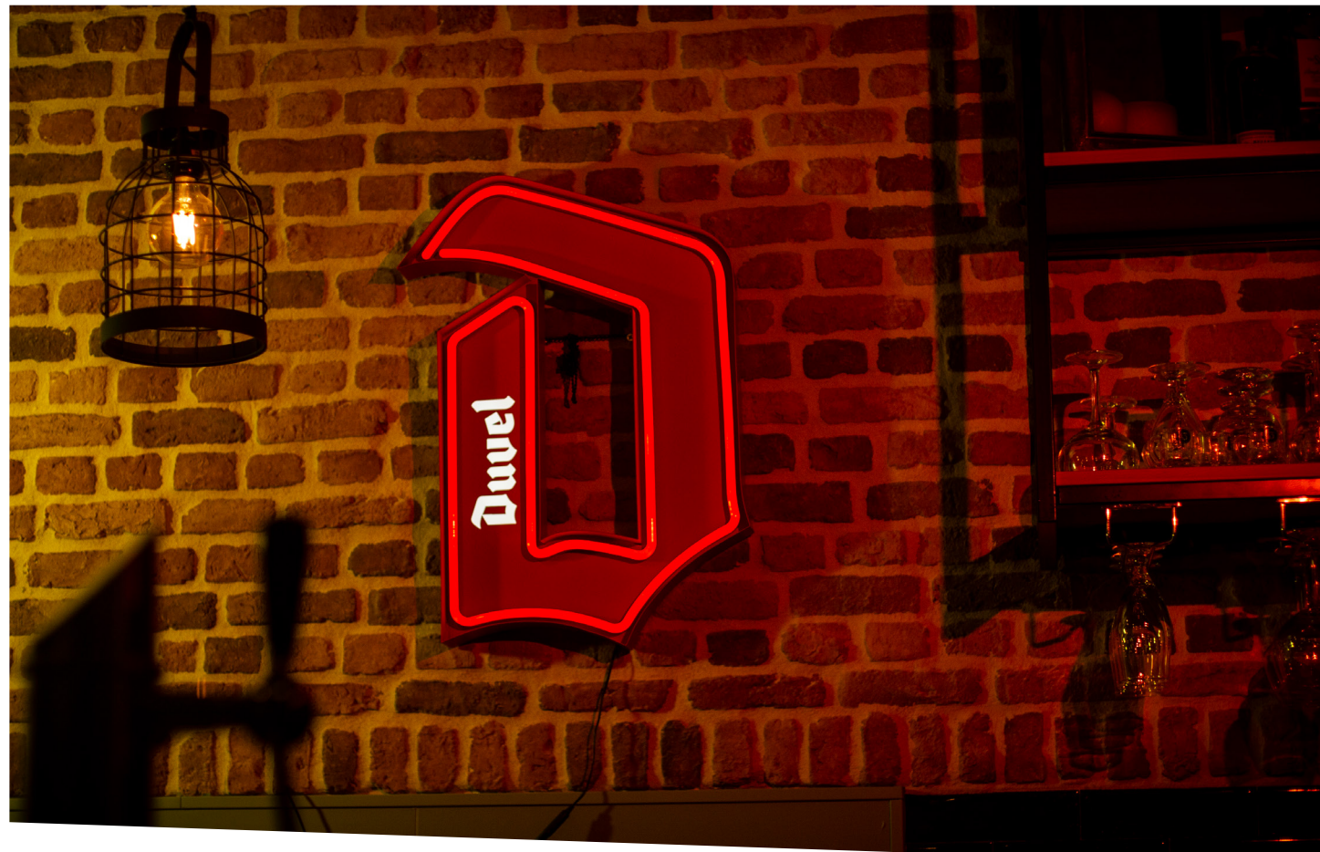
LEDNeon - Duvel