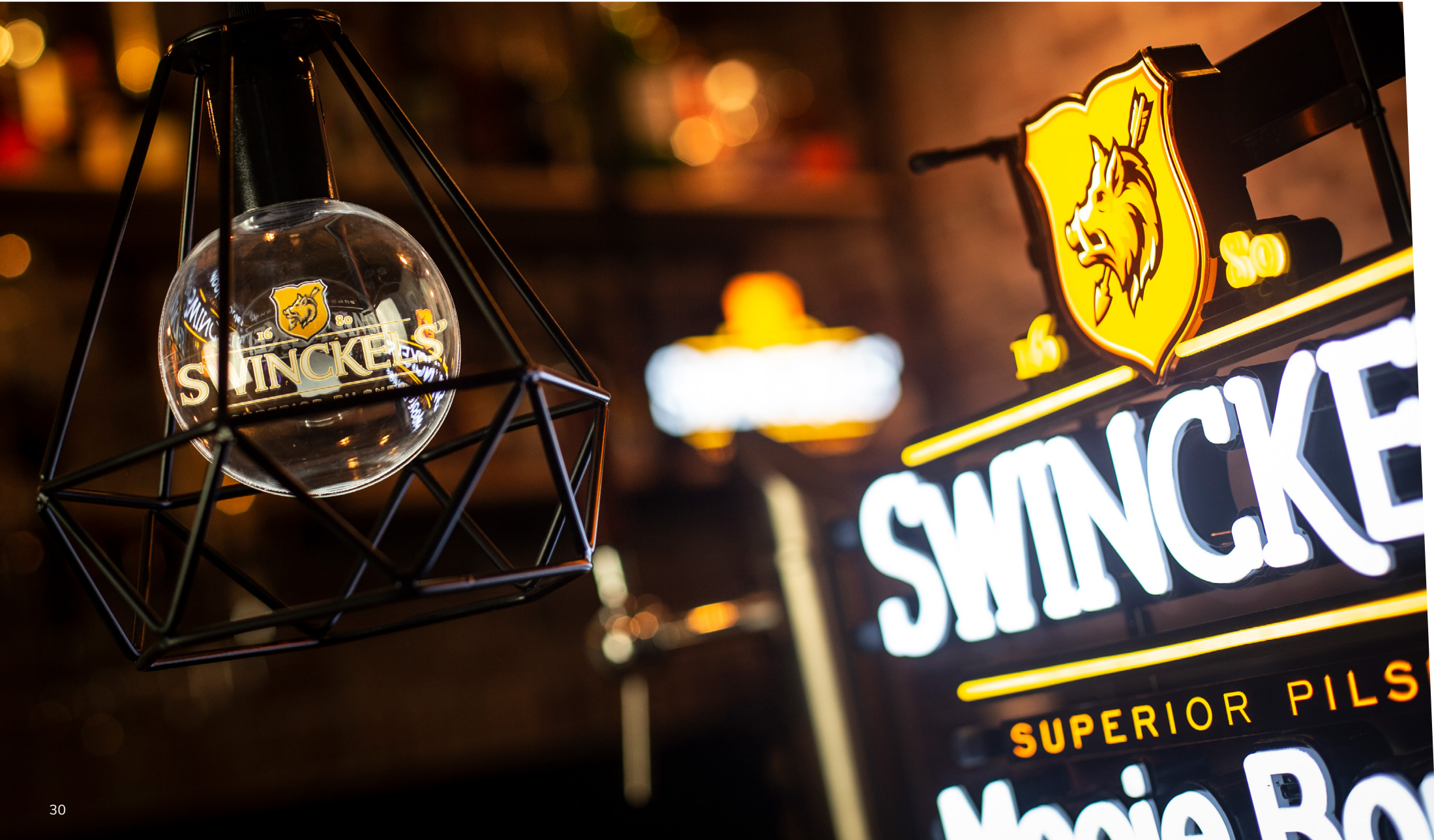
Light Bulb / LEDNeon - Swinckels