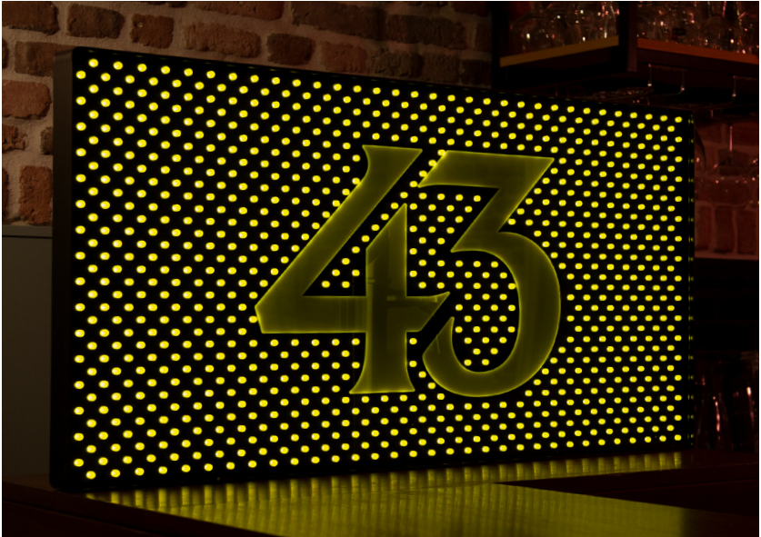
LEDSign - Licor 43