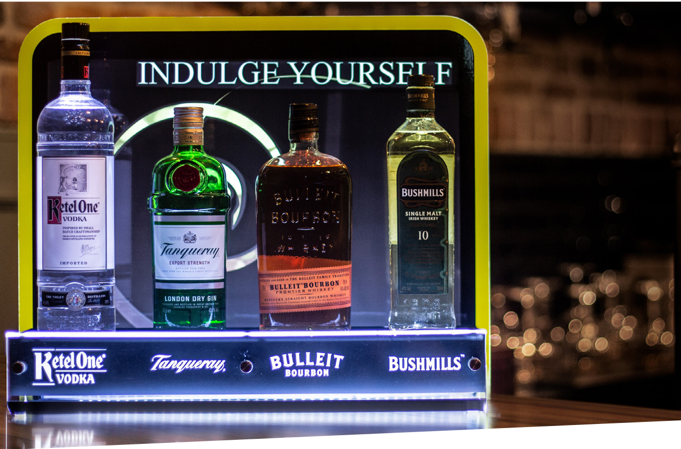
Bottle glorifier - Ketel One / Tanqueray / Bulleit / Bushmills