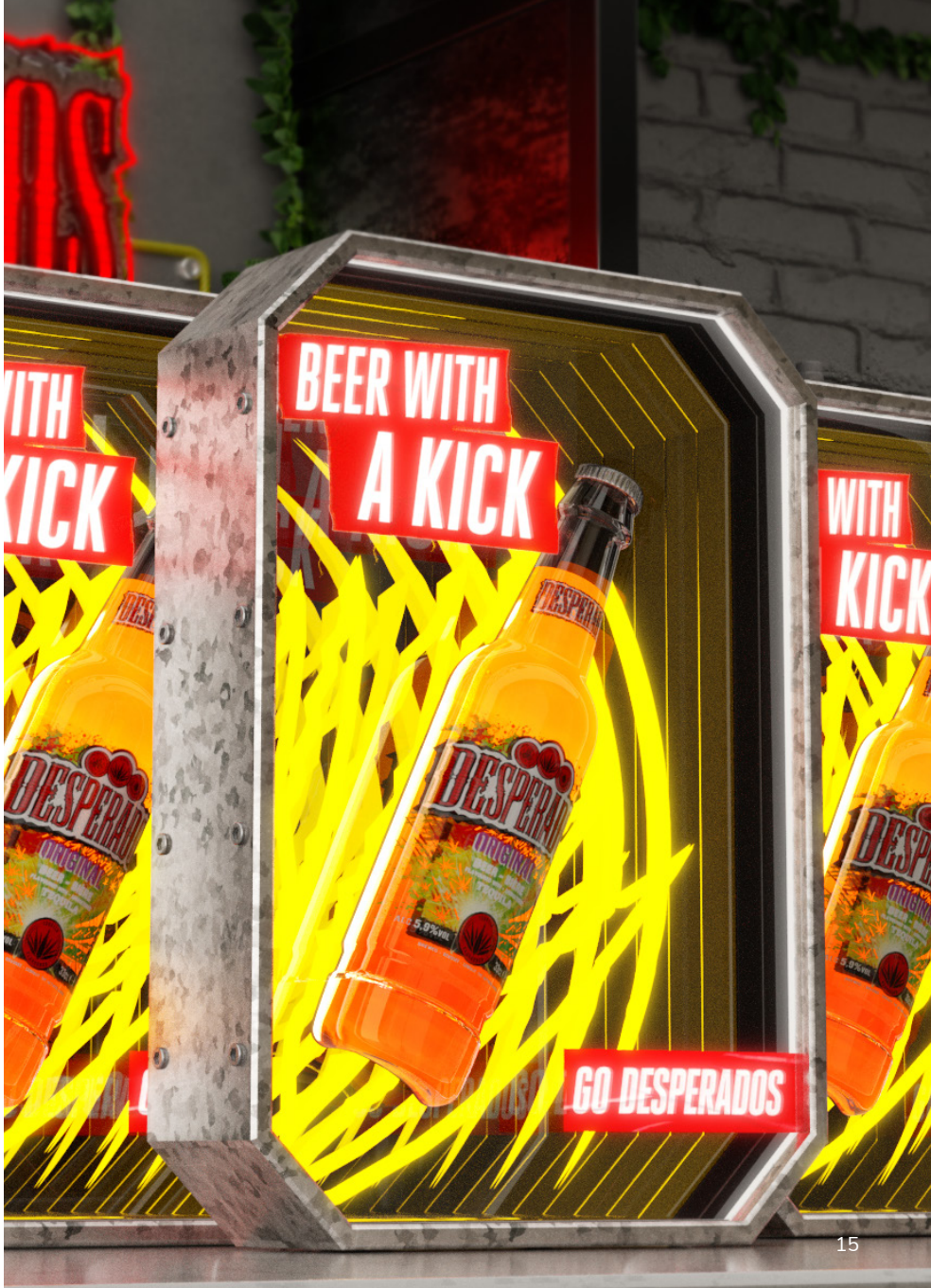
Bottle glorifier - Desperados