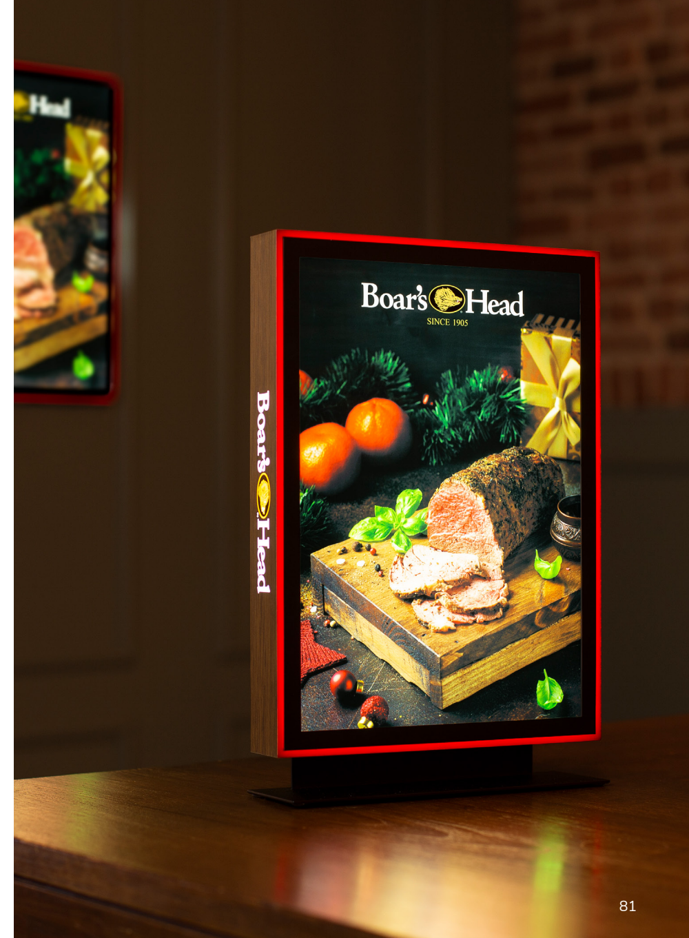
Display - Boar's Head