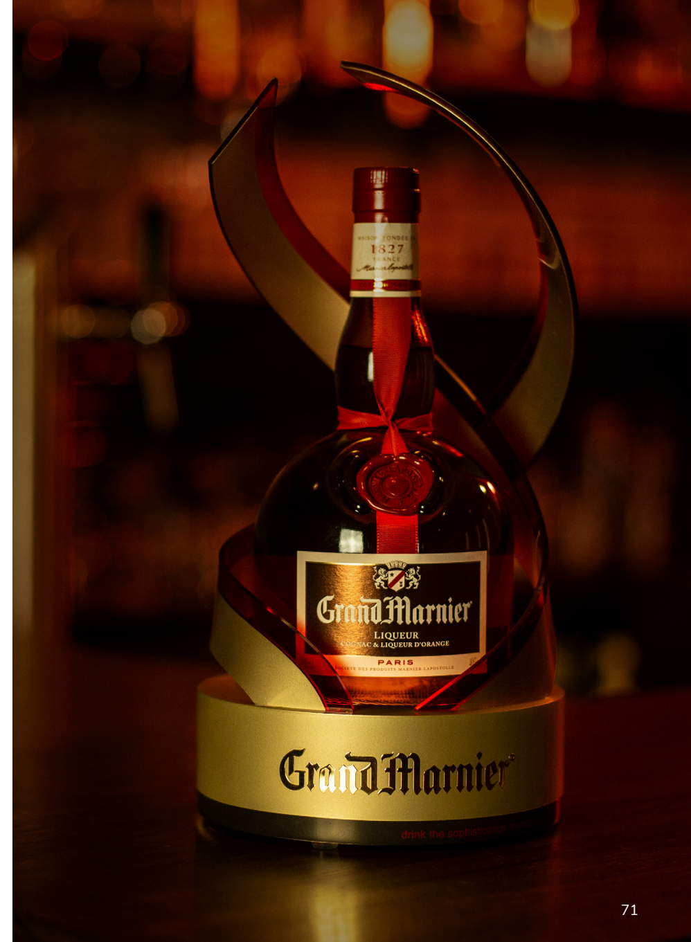
Bottle glorifier - Grand Marnier