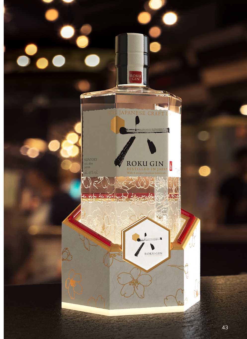
Bottle glorifier - Roku