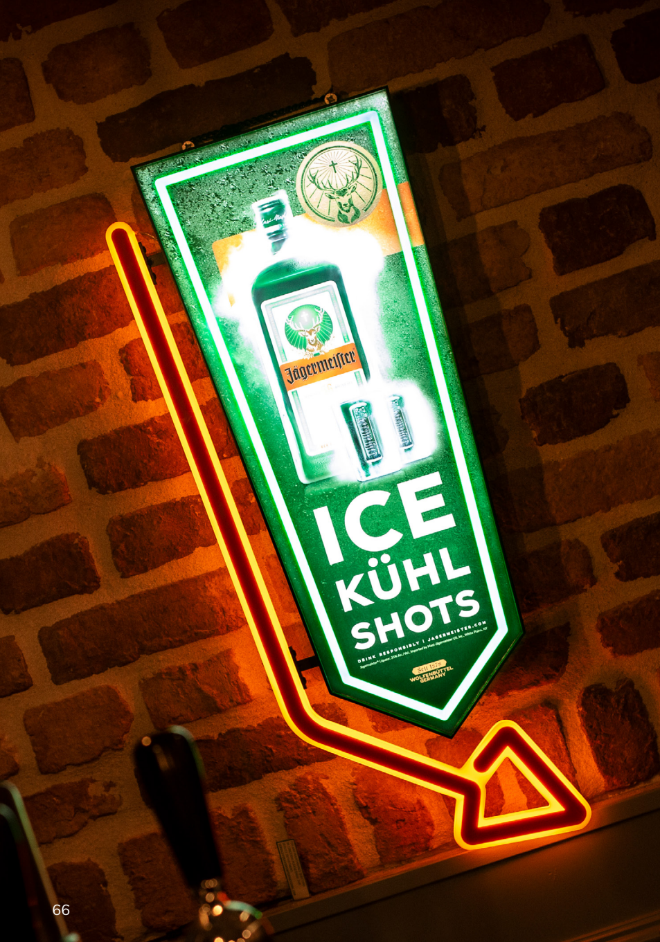
LEDSign - Jägermeister