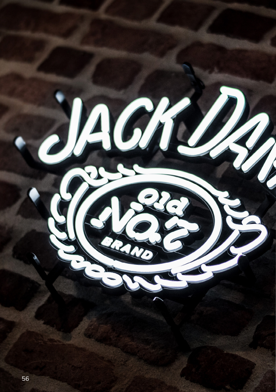
LEDNeon - Jack Daniels