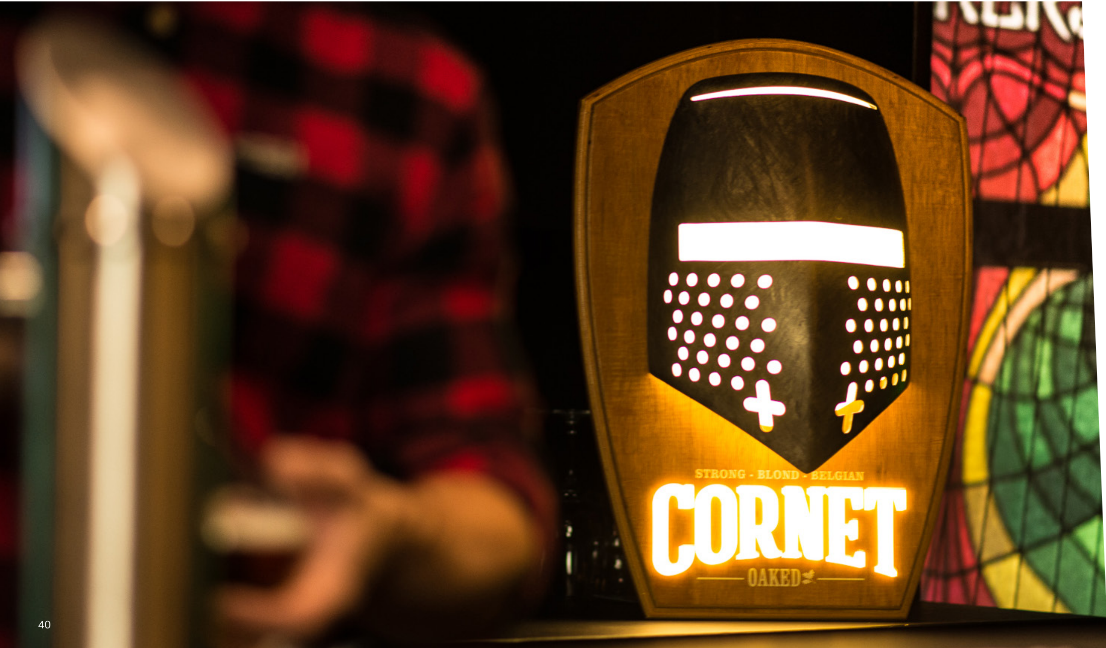
LEDSign - Cornet