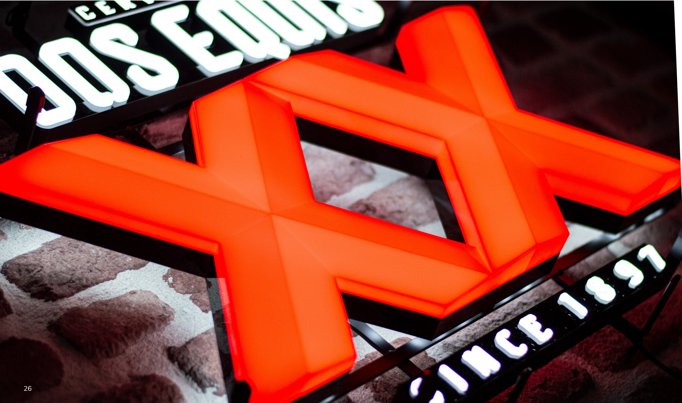
LEDSign - Dos Equis