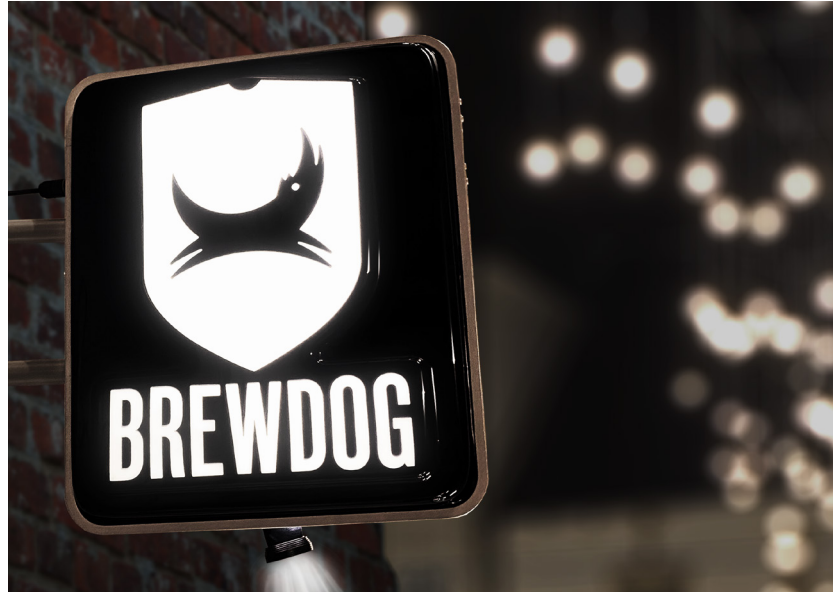
Outdoor sign - Brewdog