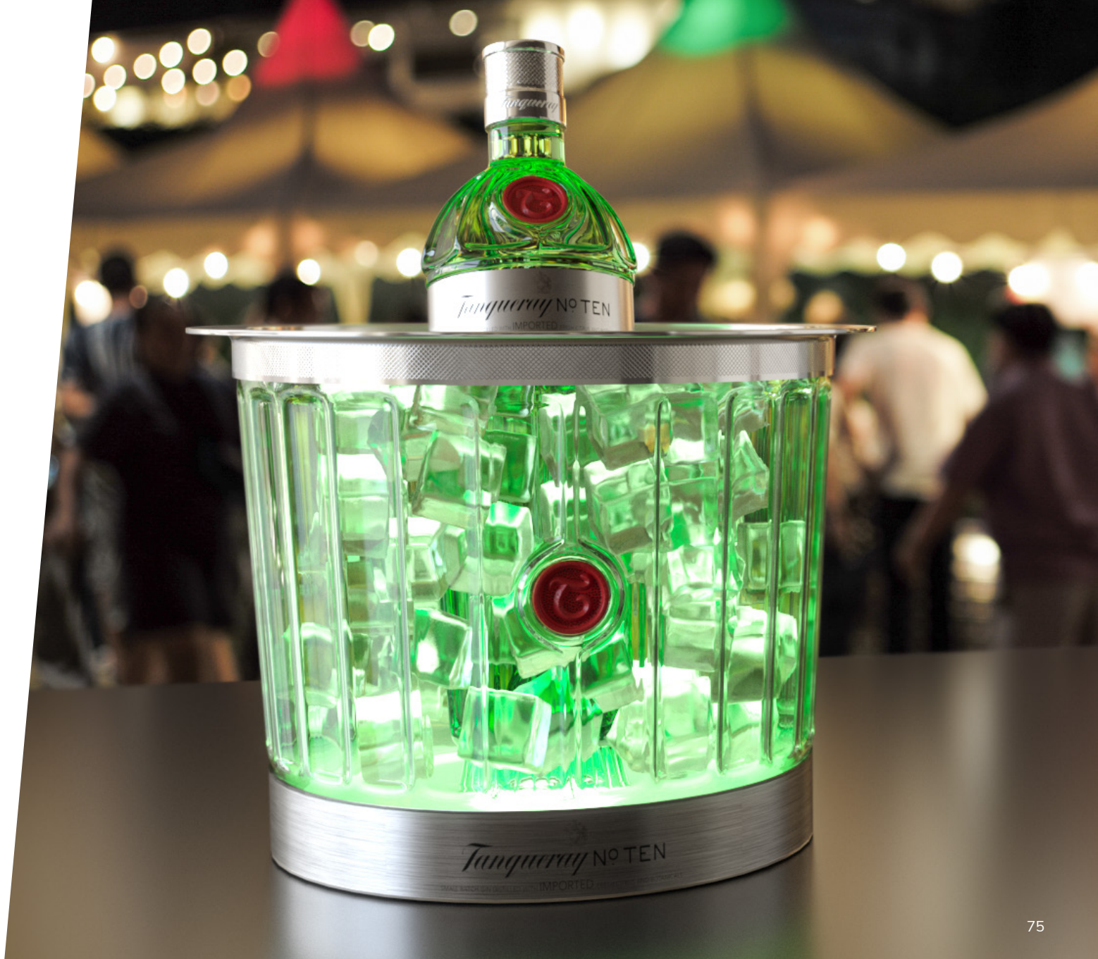
Ice bucket - Tanqueray