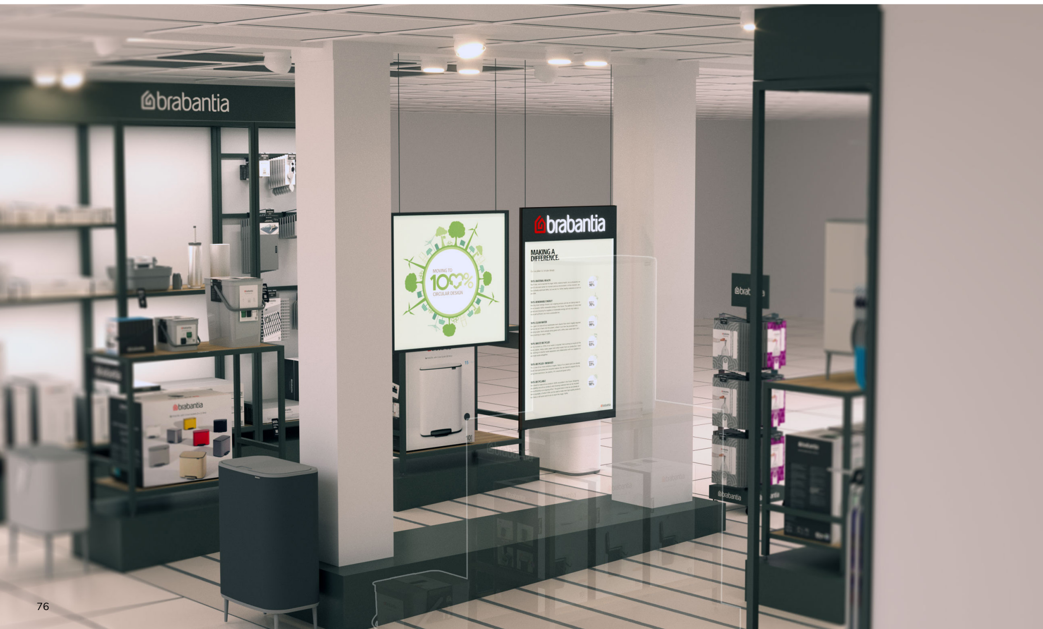
Shop in shop - Brabantia