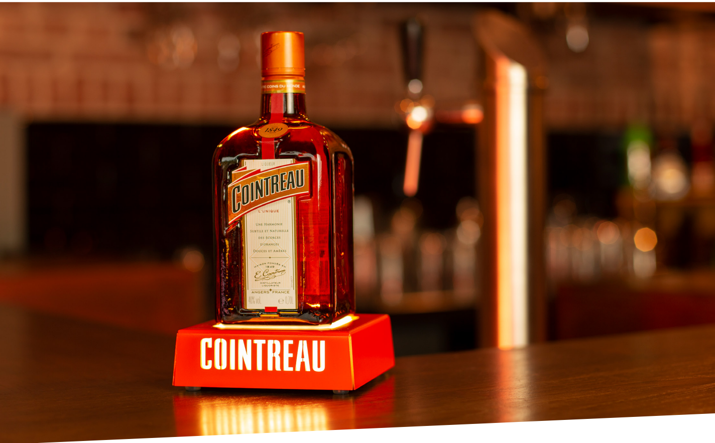
Bottle glorifier - Cointreau