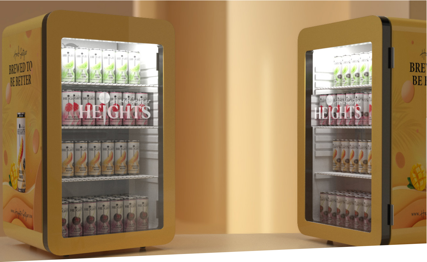
B.360 fridge - Hard Seltzer (3D render)