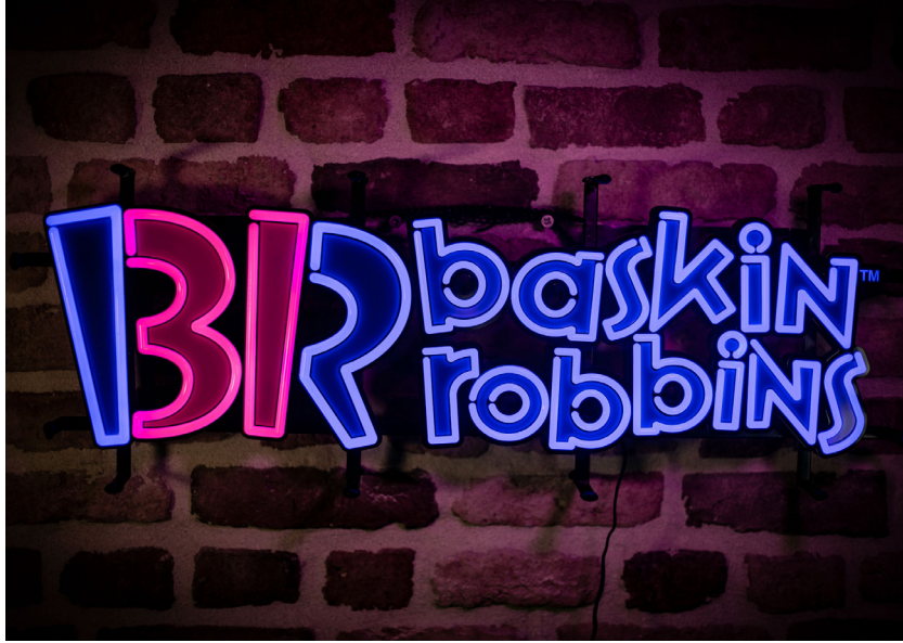
LEDNeon - Baskin Robbins