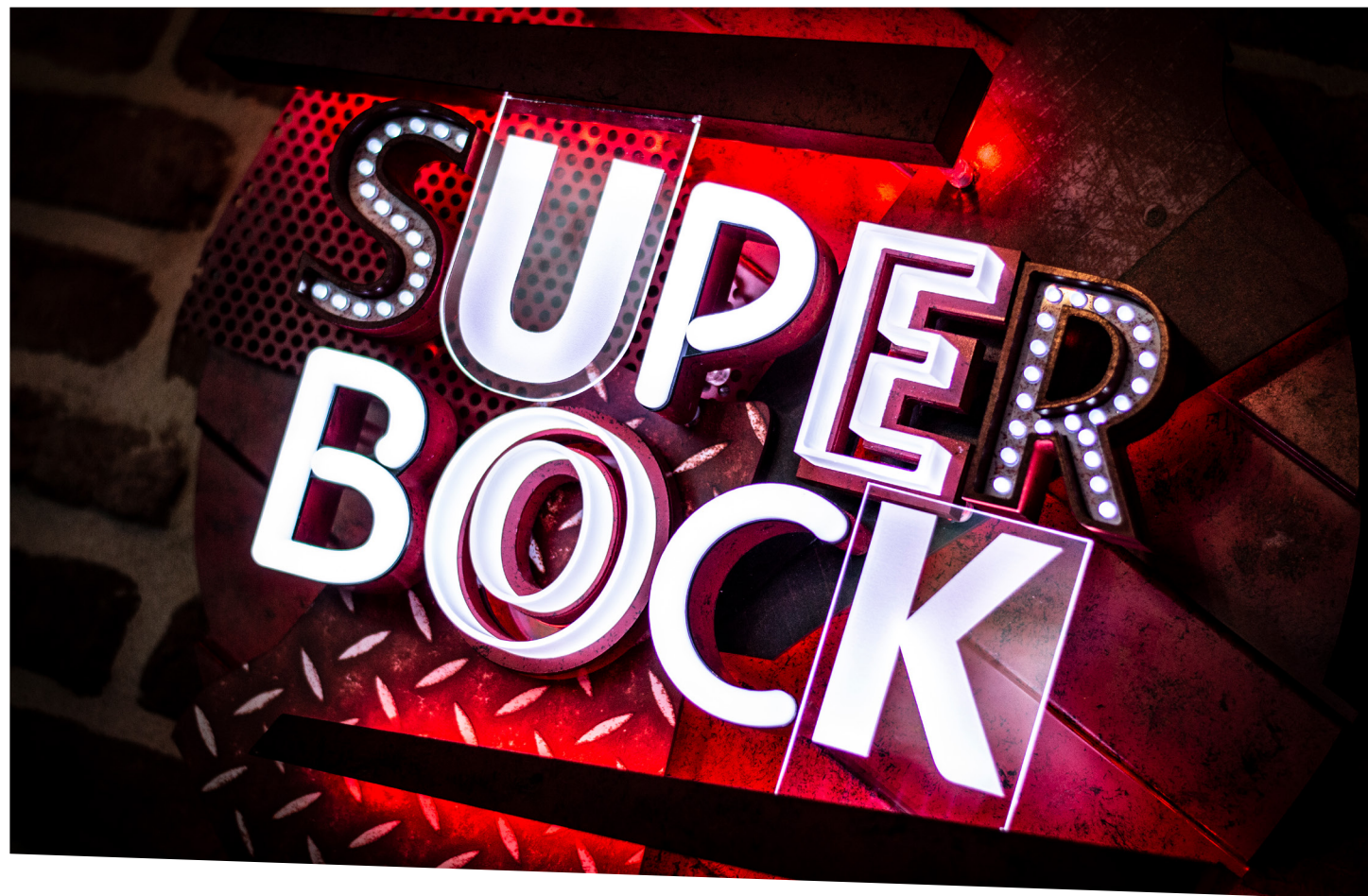
LEDSign - Superbock