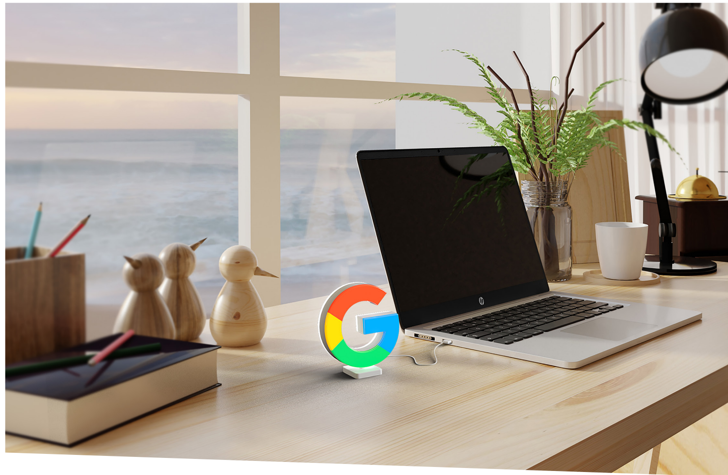
LEDSign - Google