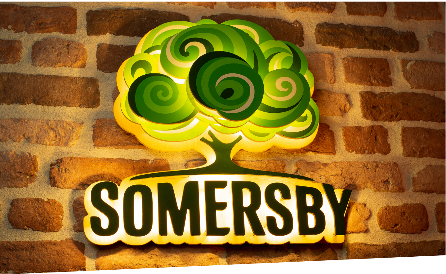
LEDSign - Somersby