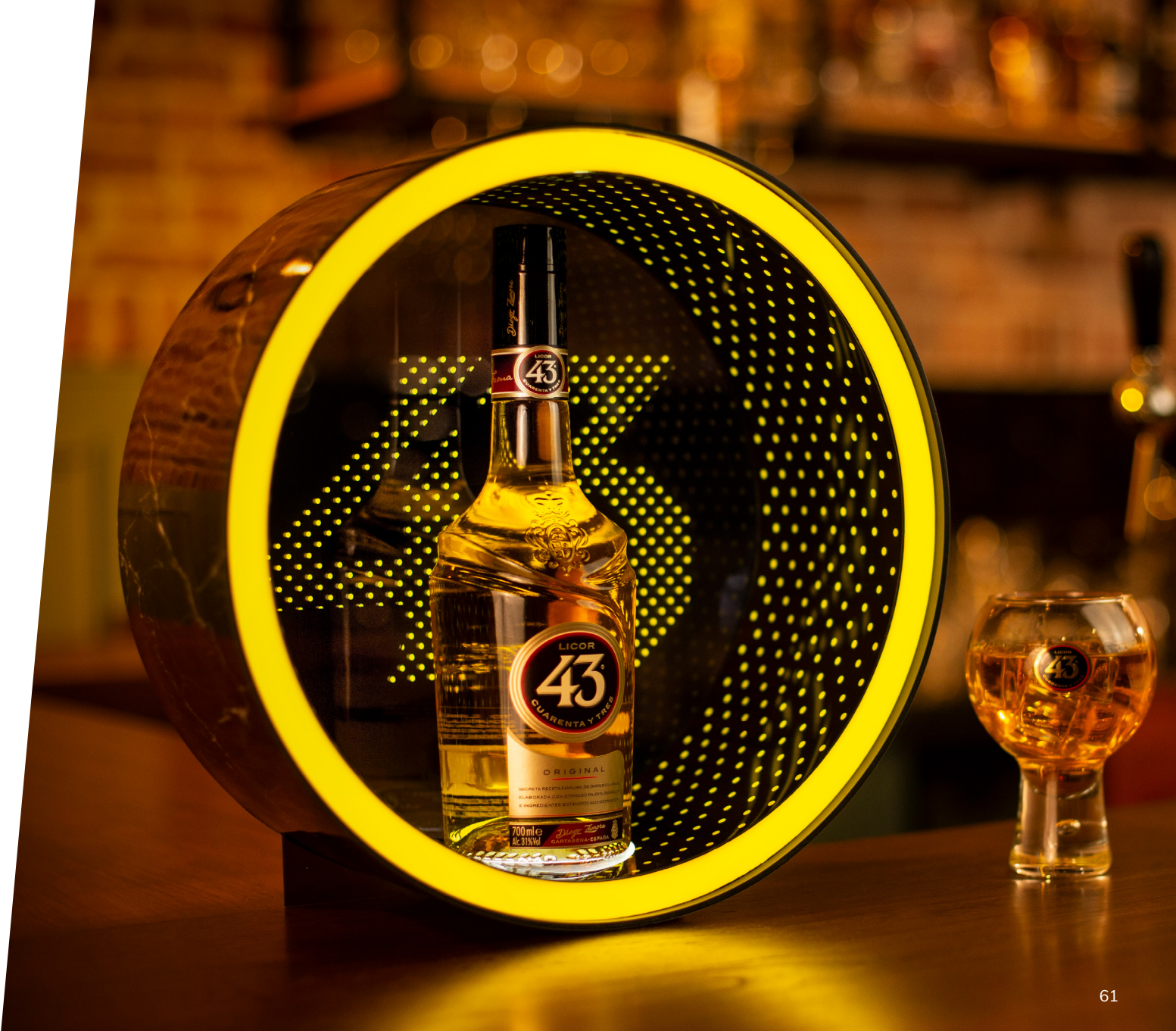
Bottle glorifier - Licor 43