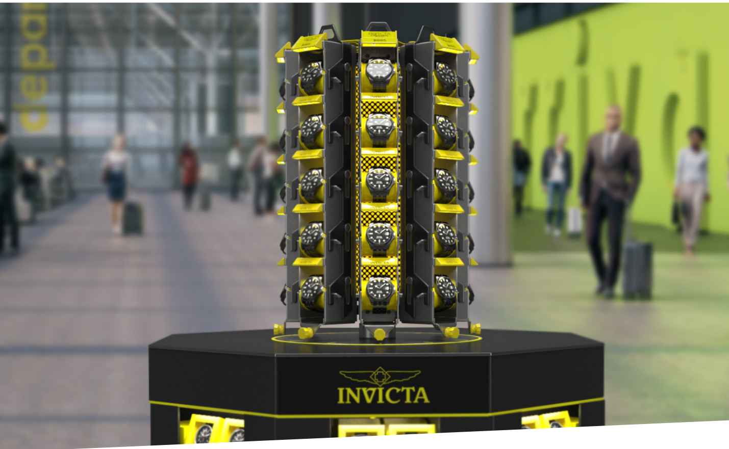
Watch display - Invicta (3D render)