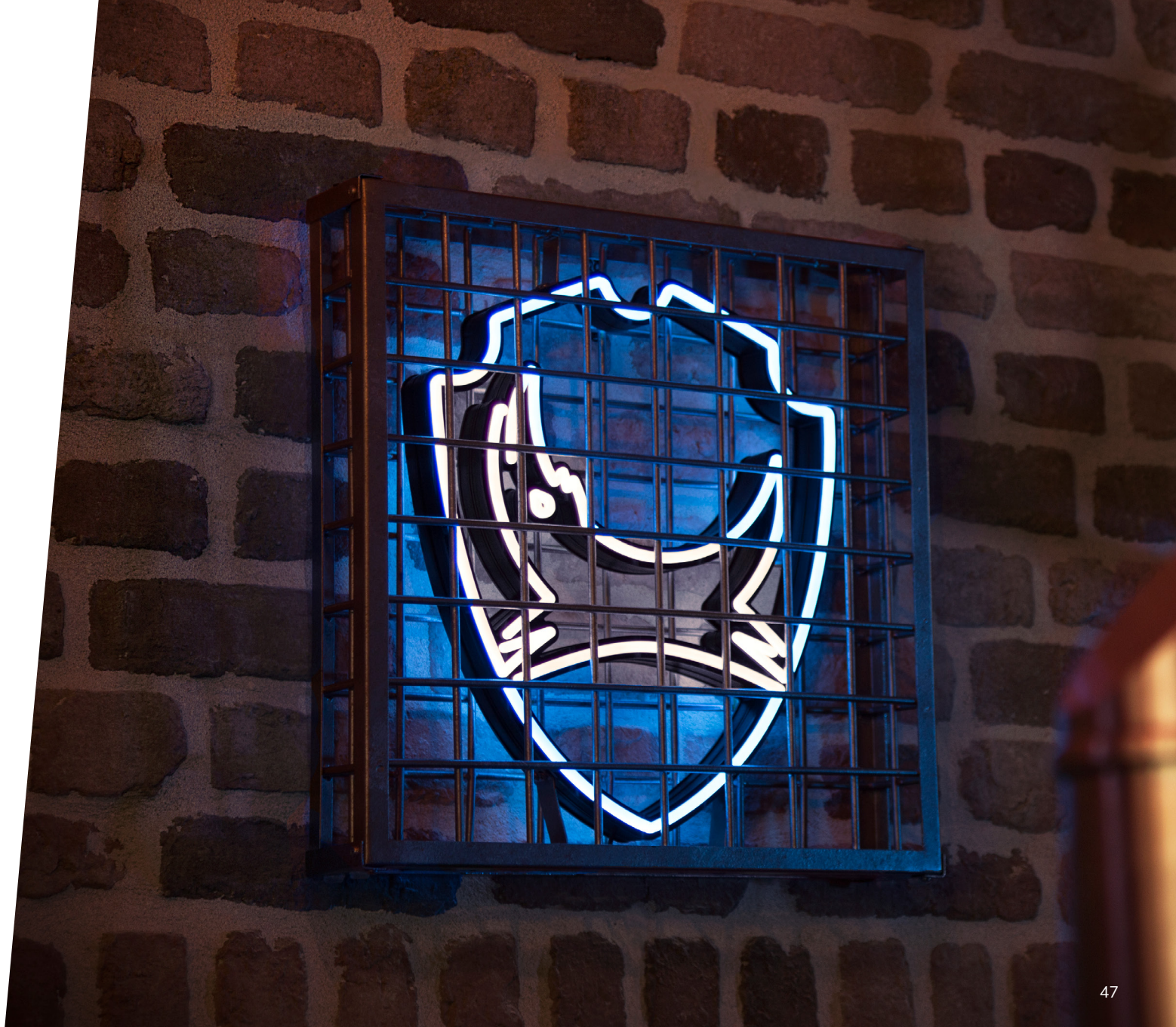
LEDNeon - Brewdog